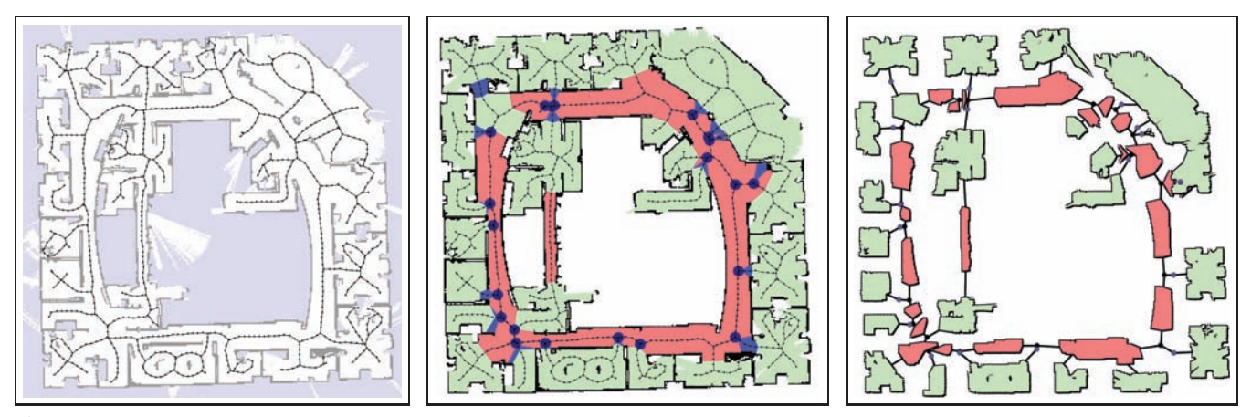
Figure 1: Intel test map: (left) Occupancy grid map built via SLAM along with Voronoi graph. (middle) The labeled Voronoi graph defines a place type for each point on the map. Hallways are colored gray (red), rooms light gray (green), doorways dark grey (blue), and junctions are indicated by black circles. (right) Topological-metric map given by the segmentation of the labeled Voronoi graph. The spatial layout of rooms and hallway sections is provided along with a connectivity structure indicated by lines and dots (doorways are dark gray (blue) dots).