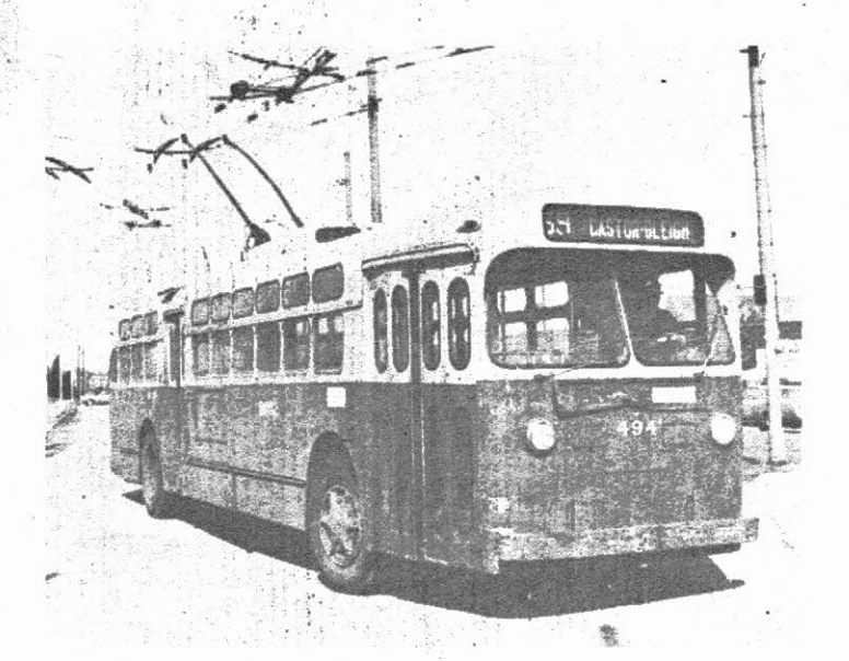
MH-46 Coach at Castor-Bleigh loop