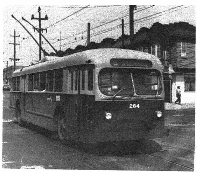
ACF-Brill TC-44 Trackless on Route 75 Wyoming Avenue