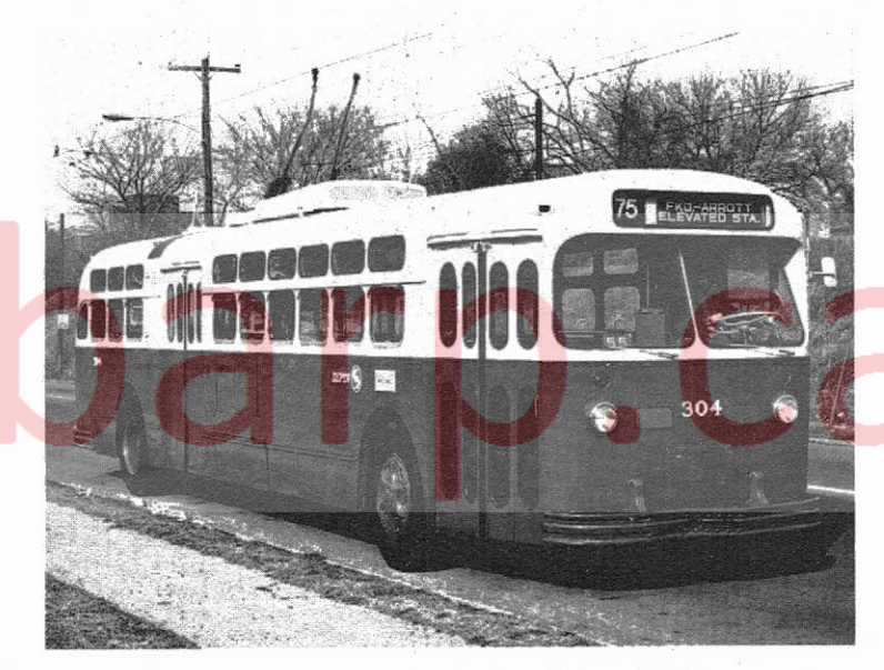
MH-49 Coach on Wyoming Avenue Bridge