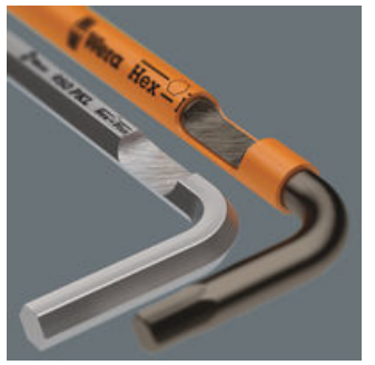
L-keys made from circular material fit into the hand better and allow less strenuous work over a longer period. Additionally, the rubber sleeve provides a pleasant grip, particularly in applications at low temperatures. Colour coding and large stamp enable the desired Lkey to be easily located. Moreover, the round material keys are more robust, particularly where smaller sizes are concerned.

Hexagon screws can endure a problem because the contact surfaces delivering the power from the conventional is tool, transferred to the screw via very small surface areas. The consequence: the screw can become damaged (rounding out). Hex-Plus tools have a greater contact surface that prevents this from happening! At the same time, as much as 20 % more torgue can be applied. Good to know: Hex-Plus tools fit into every standard hexagon socket screw!