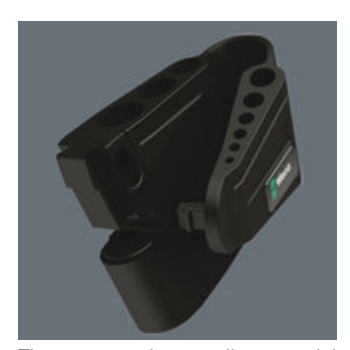
The wear-resistant clip material ensures that the L-keys are securely held yet are easy to remove.