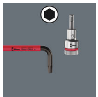
"Take it easy" tool finder system with profile and size colour-coding for quick and easy tool selection. Colour-coded system for hexagon drive screws (L-Keys, Zyklop bit sockets), external hex drive screws and nuts (Joker wrenches, Zyklop sockets and Zyklop bit sockets with holding function), and TORX® drive screws (L-Keys, Zyklop bit sockets).