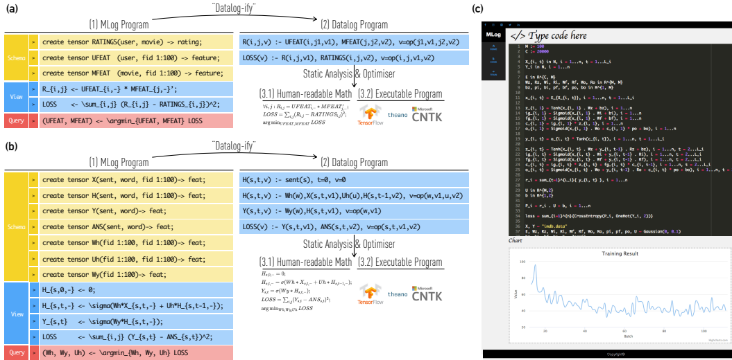
Figure 2: MLOG Examples for (a) Matrix Factorization and (b) Recurrent Neural Network. (c) User Interface of MLOG.

greSQL such that it runs on the same data representation and users can use a mix of MLOG and SQL statements. Although our formal model provides a principled way for this integration, its implementation has not been implemented yet. In this demonstration, we focus on the machine learning component and leave the full integration as future work. Second, the current MLOG optimizer does not conduct special optimizations for sparse tensors. (In fact, it does not even know the sparsity of the tensor.) Sparse tensor optimization is important for a range of machine learning tasks, and we will support it in the near future. Third, the current performance of MLOG can still be up to 2\times slower than hand-optimized TensorFlow programs. It is our ongoing work to add more optimization rules into the optimizer and to build our system on a more flexible backend, e.g. Angel [6, 5]. Despite these limitations, we believe the current MLOG prototype can stimulate discussions with the audience about the ongoing trend of supporting machine learning in data management systems.