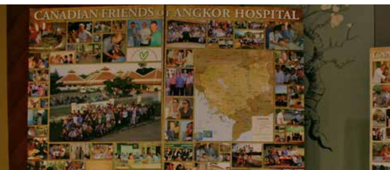
Taste The World (Canada)