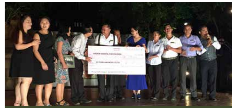
Victoria Charity Gala Dinner (Cambodia)