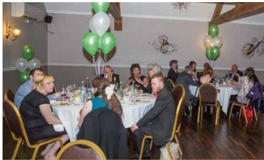
The Further Adventures of Dr Bob (UK)