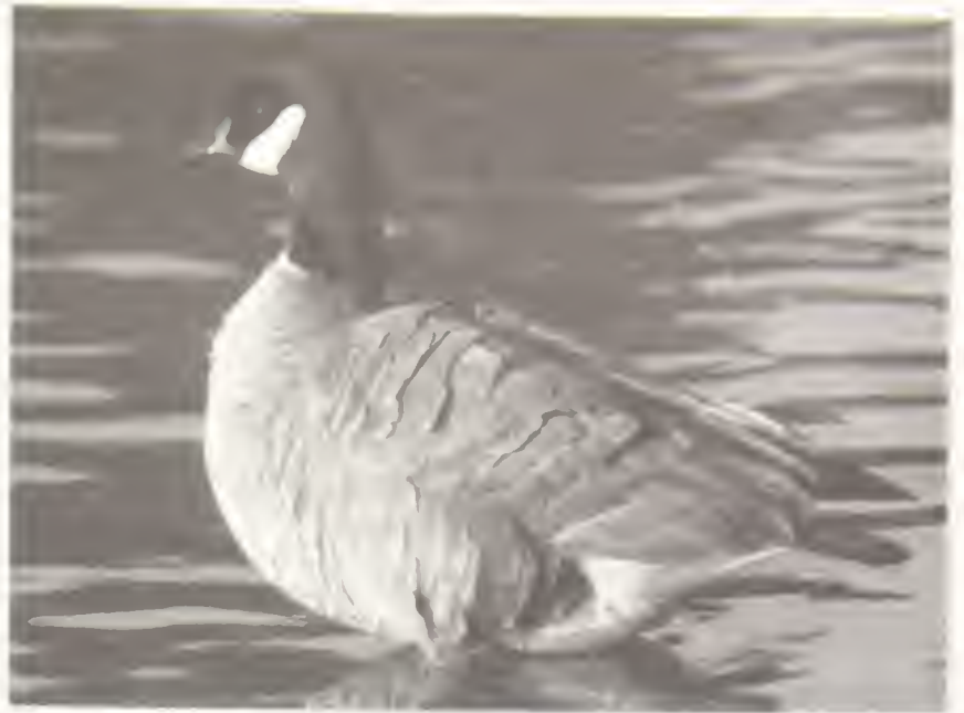
Top. Cackling Goose at Elk Glen Lake in Golden Gate Park, photographed on April 14, during the America's Birdiest City contest. Bottom. Common Merganser at Lloyd Lake in Golden Gate Park, photographed on April 14, during the America's Birdiest City contest.