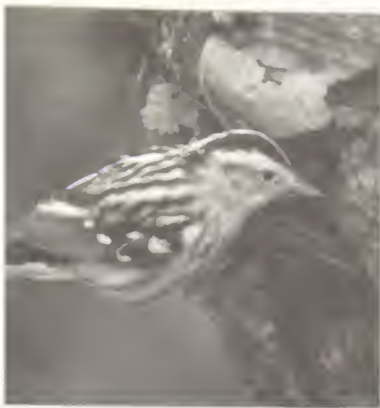
Black and white Warbler seen at Ferry Park, SF during the Americas Birdiest City contest

A Franklin's Gull was buffeted by high winds on Apr. 14 at Porto Bodego, Bodega Bay, SON (RS; mob). Several Glaucous Gulls lingered in the region, with the latest report coming on Apr. 21 from Salt Pond A16 in Alviso, SCL (mob). Black-legged