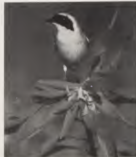
Common Yellowthroat, which nests at Palo Alto Baylands and other local marshes.