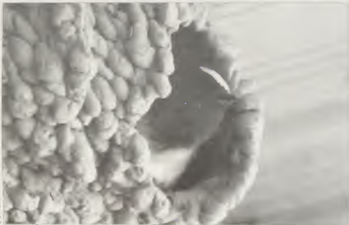
Cliff swallow in nest

Slow down this late spring and summer, and take the time to enjoy the antics of the bird world in your yard or neighborhood. Let a hummingbird dash through your sprinkler or your hose spray. Work in your garden quietly until the chickadees almost land on your head. Watch the athleticism of those rascals, the squirrels—as you chase them off your feeders. Hooray for nature!