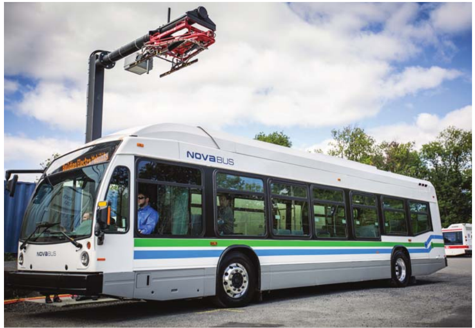
Novabus builds in both Canada and the United States. As a subsidiary of Volvo, it has access to Volvo technology and support. They currently offer their LFSe model. This 40-foot electric transit bus is based on their popular low-floor LFS design and incorporates Volvo lithium-ion batteries and a TM4 electric powertrain. NOVABUS.

In battery electric buses, Novabus currently offers their LFSe model. Based on their popular LFS design, this is a 40-foot, low-floor transit bus with a seating capacity of up to 41 seated passengers (loading capacity:71). Mechanically, it has four Volvo high voltage lithium-ion batteries in parallel. Two of the batteries are located on the roof while the other two are in the rear of the bus. Propulsion comes from a TM4 Sumo HD electric power-