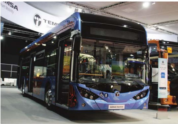
Temsa from Turkey offered their first electric bus in 2015, the MD9 ElectricITY. At the recent Busworld in Belgium they introduced their new 12-meter Avenue Electron electric bus. NBT.