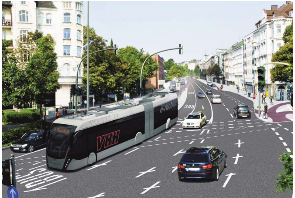
The Europeans have also developed what are known as "tram buses" that combine some of the features of high-capacity trams with the ease of bus operations. They do very well when operated on dedicated lanes or roadways. Shown here is an electric version of the Van Hool ExquiCity model that was built for Hamburg, Germany. VAN HOOL.

neck out and say that this battery capacity issue is essentially the major reason holding back a wholesale conversion to electric buses. Most cars and buses use standard lead acid batteries for starting, but they can be damaged by losing their charge and are not good for electric bus applications. Hence, most of these electric buses use lithium ion batteries.