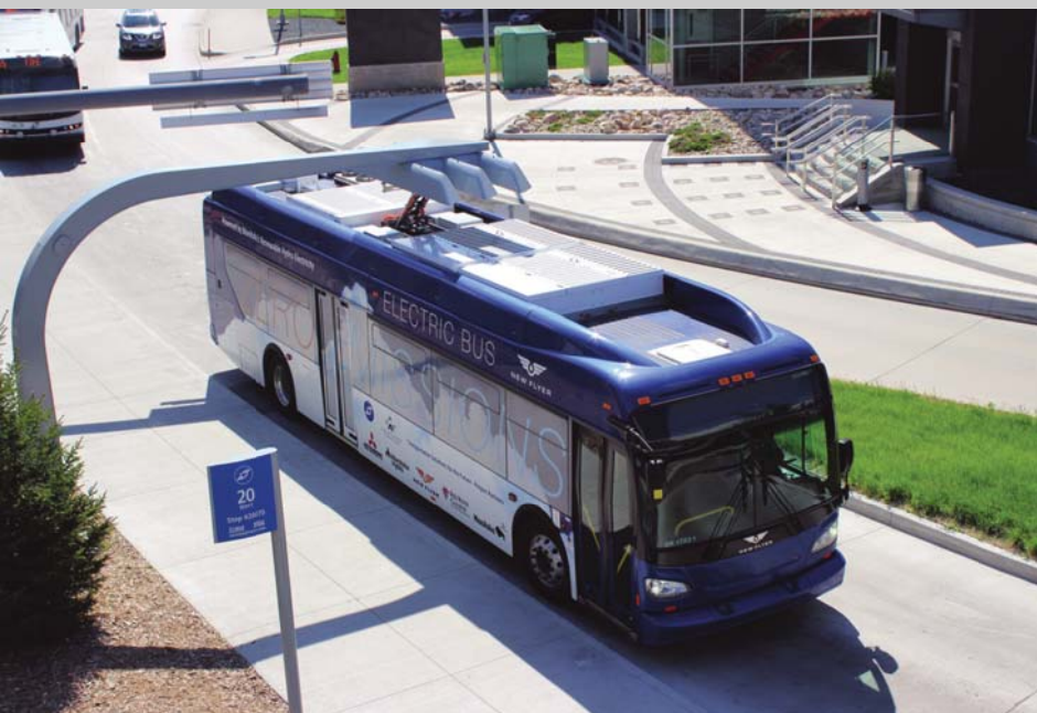
What appears to be the single biggest factor holding back electric bus development is the lack of battery capacity. One solution to this is to top off the electric charge along the route using a system in the pavement or an overhead device as illustrated by this New Flyer bus. Several manufacturers have been working to standardize electric connections. NEW FLYER.

A third type of charging system is embedded in the pavement. The bus parks over the area and receives a charge when standing still. One brand, known as the WAVE system, has been used effectively with CCW's ZEPS buses. Like the overhead contactor, this kind of system is more typically used to top off a charge at the end of a line and has the same shortcoming as the