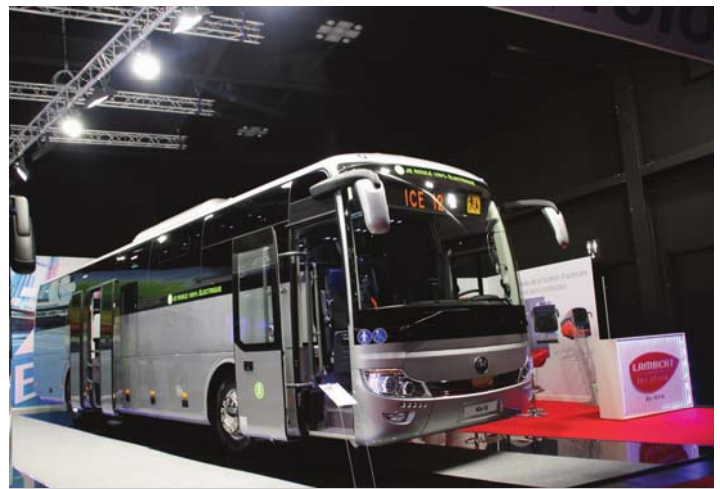
Yutong from China introduced their new two-door ICE12 electric coach with traditional coach features for the European market at the recent Busworld. It has a range of up to 165 miles. NBT.

almost 250 miles. Charging times as low as eight minutes have been claimed.