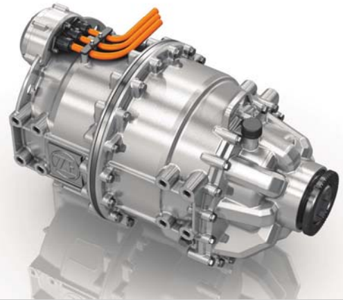
Recently introduced by ZF, their CeTrax electric motor can be connected to a conventional bus drive line. This will enable virtually any bus manufacturer to easily offer a diesel bus model as an electric. ZF.

need for an electric motor in the bus body, thus providing more free space. A second advantage is that you can design the axle to work with a low-floor bus.