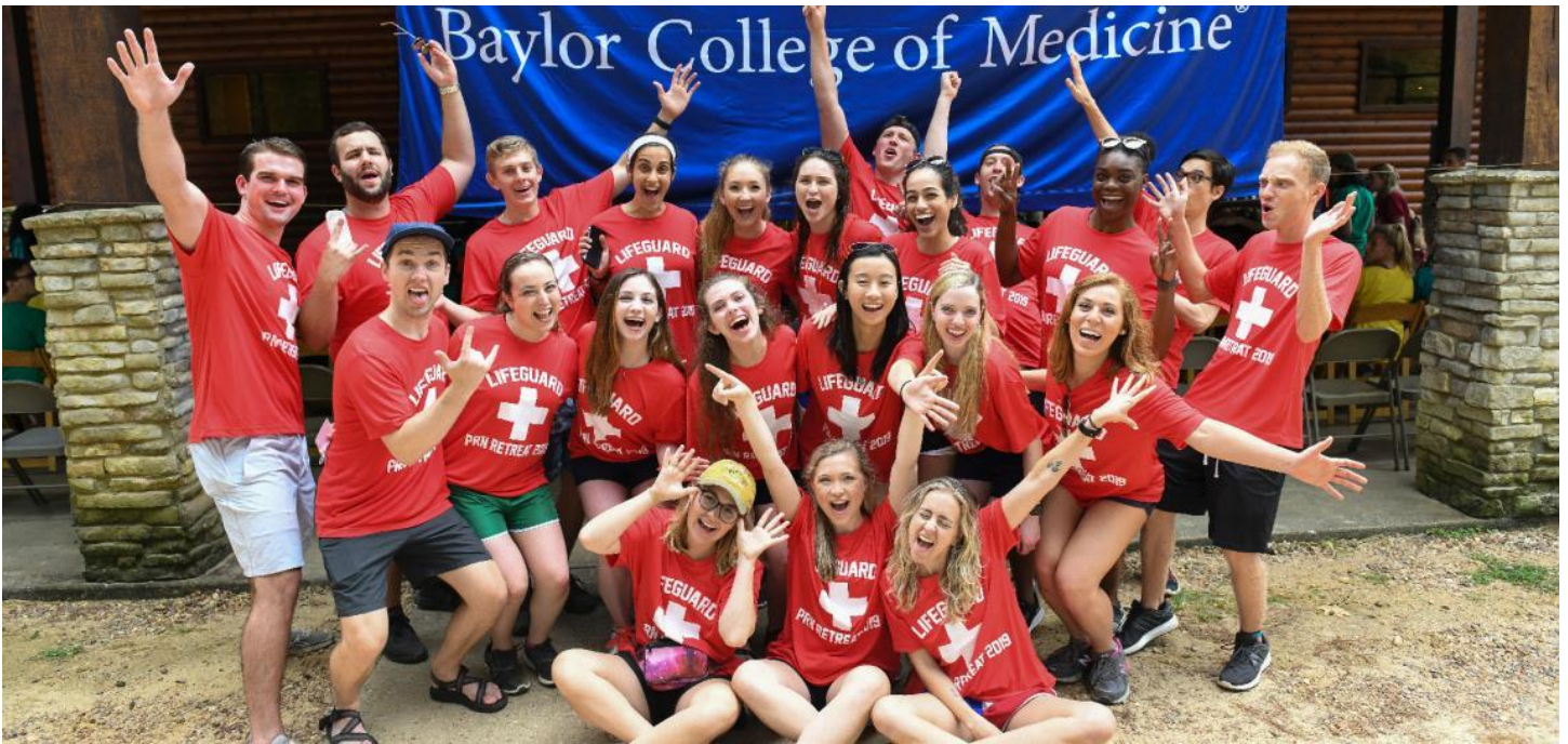
2019 PRN Orientation Retreat Coordinators and Facilitators