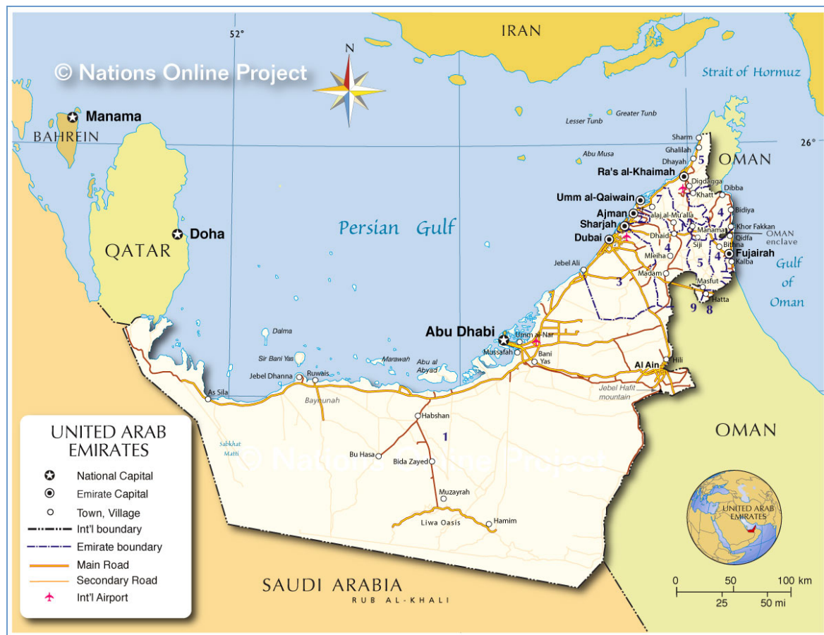
Figure 1 – Location of Fujairah