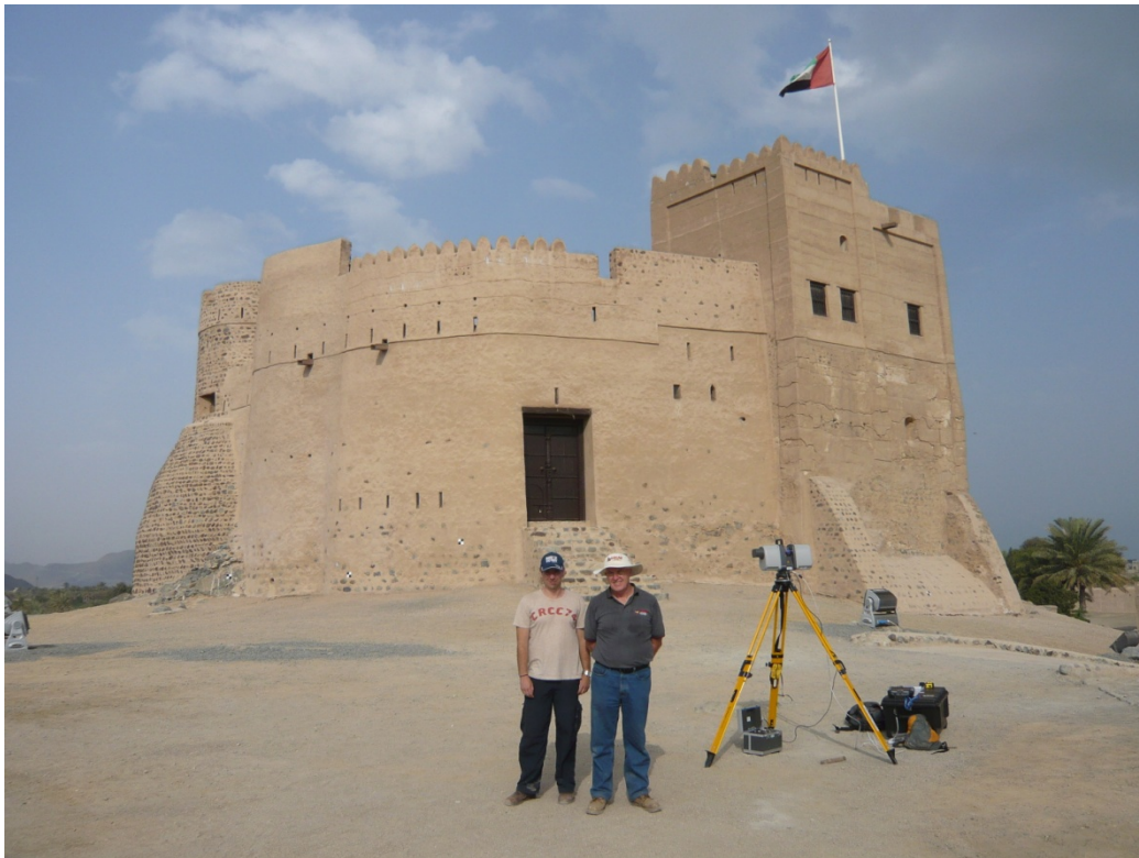
Figure 2 – Photograph of modern and restored Fujairah Fort