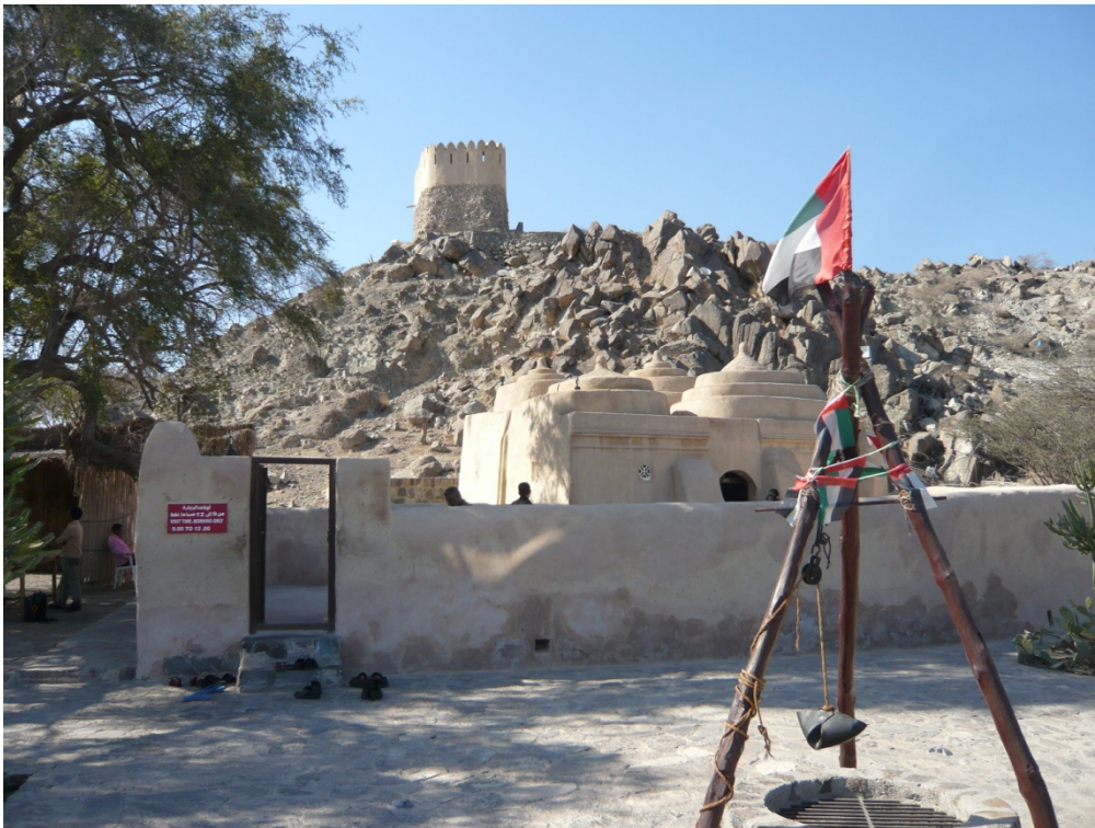
Figure 4 – Al-Bidyah Mosque after restoration