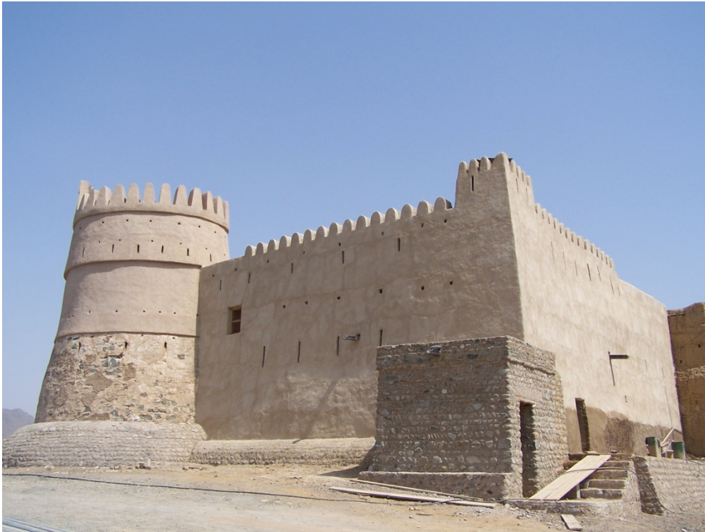
Figure 3 – Al-Bithna Fort after restoration