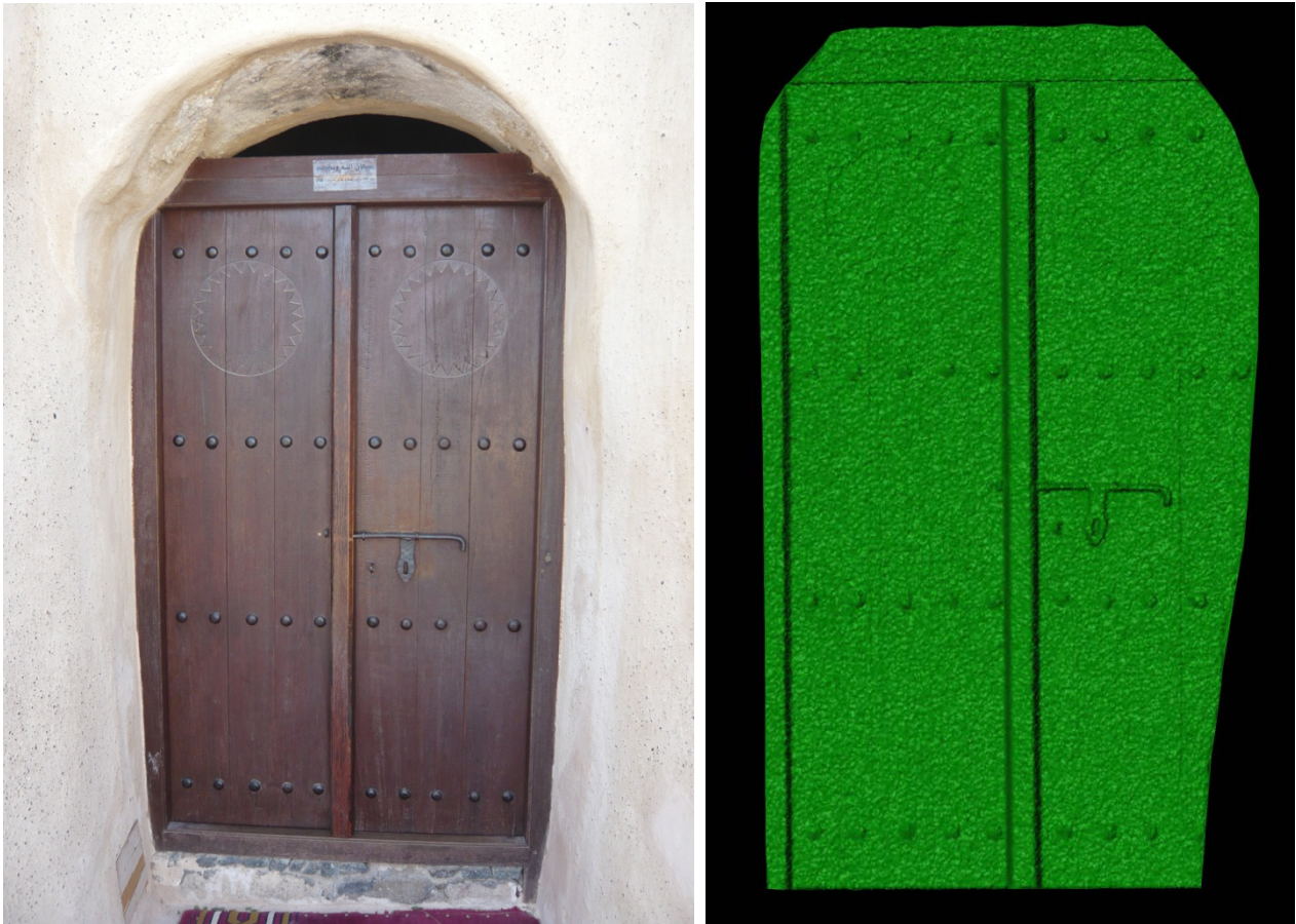
Figure 6– A photograph of the Al-Bidyah door (on left) and corresponding modelled mesh (on right).