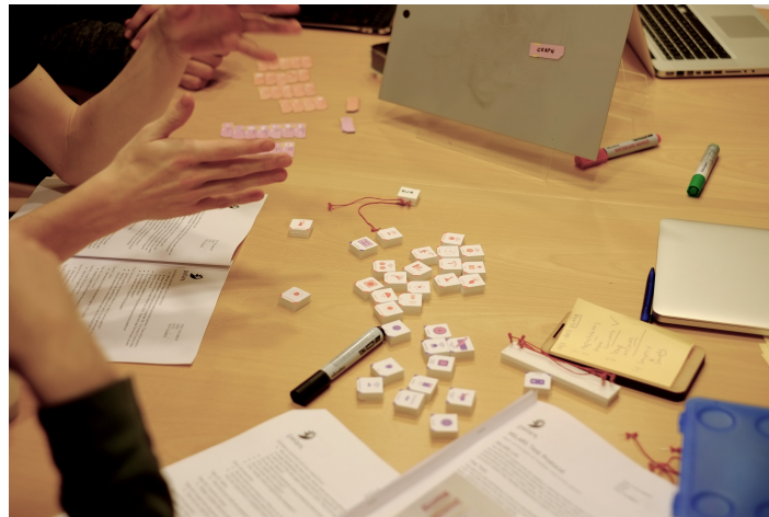
Fig. 1. Visual programming platform prototyping

in a “wizard of oz” scenario. Figure 1 illustrates how the students connected the hardware blocks of sensors and actuators (the paper blocks and strings) on the table and then the researcher put on a magnetic board (computer screen) the associated blocks (printed magnets). The researcher acted as the wizard representing the smart system that recognised which blocks the students had connected and represented the computer screen showing the visual programming interface. This prototyping system allowed the teams to discuss and adjust the inputs to generate the hypothetical outcome for the different tasks.