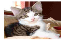
1: a cat is sitting on a couch 2: a cat is sitting on the floor next to a cat