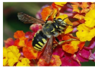
1: a small bee sitting on a flower 2: a small bird sitting on a tree branch

id_sentence4.txt is the results generated by our final model which is firstly trained only using the examples in the MSCOCO dataset and then fine tuned on the combination of Flickr8K, Flickr30k and the manually selected examples. And the median score of the generated sentences is 0.1711. This submitted run is the best of our submitted runs and also the best one for natural language caption generation of ImageCLEF 2016.