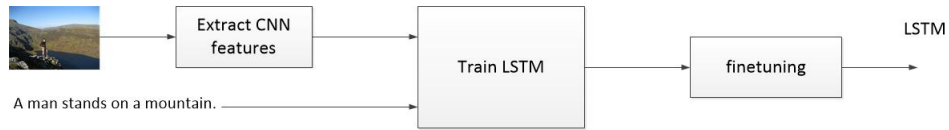
Fig. 1. An illustration of training stage.

The model we use contains two types of neural networks, as illustrated in Figure 1. The first stage is CNN for image encoding and the second stage is Long-Short Term Memory(LSTM) based Recurrent Neural Network for sentence encoding [7, 8]. For CNN, we use the pre-trained VGGNet [10] for feature extraction. Using the VGGNet , we transform the pixels inside an image to a 4096-dimensional vector. After getting the visual features, we train an LSTM to obtain linguistic captions. In the LSTM training procedure, we change the parameters of both CNN and LSTM together. At last we fine tune the pre-trained model to get a more suitable model for the natural language caption generation task.