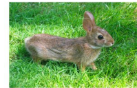
1: a rabbit is sitting in a field 2: a cat is sitting in the grass near a tree