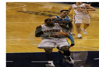
1: a basketball player in white uniform is dribbling the ball 2: a man is playing tennis on a tennis court