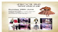
1: the cover of a book 2: a picture of a man and a woman in a room