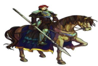
1: a man is sitting on a horse 2: a man is standing on a motorcycle in a field