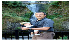
1: a man and a young boy are standing in front of a water fall 2: a man in a suit and tie standing in a field