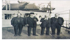
1: a group of people standing next to each other 2: a group of people standing next to a train