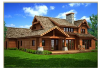
1: a building with a tree on the side of it 2: a building with a clock on the side of it