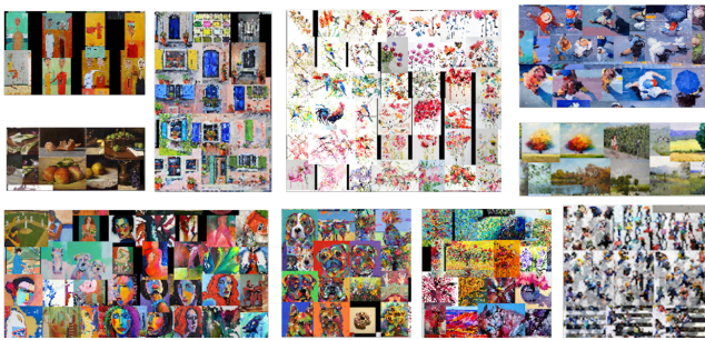
Figure 2: Examples of visual clusters automatically generated to sample triples for the training set.

Creating Visual Clusters. Some of the sampling guidelines are based on visual similarity of the items, and although we have some metadata for the images in the dataset, there is a significant number of missing values: only 45% of the images have information about subject (e.g., architecture, nature, travel) and 53% about style (e.g., abstract, surrealism, pop art). For this reason, we conduct a clustering of images based on their visual representation, in such a way that items with visual embeddings that are too similar will not be used to sample positive/negative pairs (i_+, j_-) . To obtain these visual clusters, we followed the following procedure: (i) Conduct a Principal Component Analysis to reduce the dimensionality of images embedding vectors from \mathbb{R}^{2,048} to \mathbb{R}^{200} , (ii) perform k-means clustering with 100 clusters. We conducted k-means clustering 20 times and for each time we calculated the Silhouette coefficient [34] (an intrinsic metric of clustering quality), so we kept the clustering resulting with the highest Silhouette value. Finally, (iii) we assign each image the label of its respective visual cluster. Samples of our clusters in a 2-dimensional projection map of images, built with the UMAP method [31], can be seen in Figure 2.