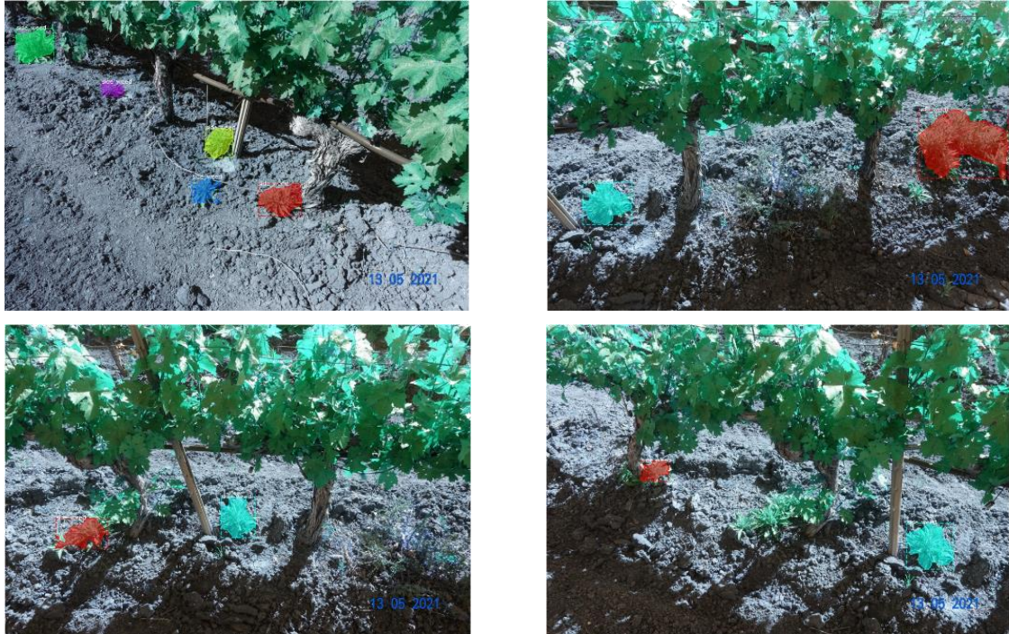
Figure 2: Validation from unknown images.