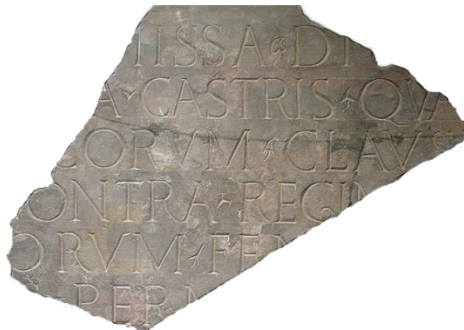
Figure 1: Damaged inscription from the Fortress of Deva, EDCS-09400486.

In fact, aside from the humanistic point of view, the problem of filling lacunae in Latin is nevertheless a challenging problem from the deep learning perspective, since these kinds of methods require to be trained on a large amount of data, which is not available when working with an ancient language such as Latin.