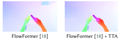
Figure 2: Effect of TTA on optical flow estimation.

TTA for real-time Optical Flow estimates A model trained on the optical flow computed using the TV-L1 algorithm [16] experience a pronounced performance drop when tested on the estimated optical flow produced by PWC-Net [17], as the accuracy drops from 50.53% to 25.04%. Since TTA has proven to be a viable approach to improve model accuracy in the presence of domain shift, we explore the applicability of TTA to reduce this drop (Table 6). The best TTA approach, 1 step of IM and BN updates, is able to effectively bridge part of the gap between the two sources, recovering more than 7%.