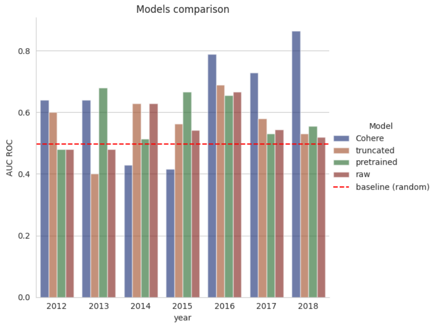
Figure 3: Assessing distinction between right-wing and left-wing communities. This figure presents AUC ROC scores as a measure of how well the model distinguishes between right-wing and left-wing communities for each model using annual data spanning 2012 to 2018. Higher AUC ROC scores indicate superior discrimination ability, offering insights into the model’s performance and its ability to capture evolving distinctions between these communities.