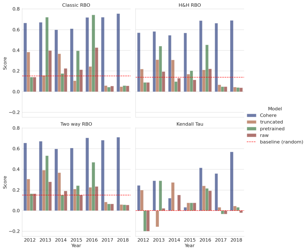
Figure 2: Comparison of Similarity Measures between our rankings and Waller’s gold standard. In this figure, the dashed red line represents a baseline using random rankings for each corresponding measure, serving as a point of reference. This comparison offers valuable insights into the performance of our rankings relative to the established gold standard.

model is a larger and more complex architecture than the simpler skipgram-based FastText model. This observation aligns with the results obtained in previous works [14], where it is demonstrated that another transformer-based model (BERT) is able to distinguish between the two communities’ ways of speaking even when they are very similar, exploiting differences that are not readily perceptible to humans. We obtained best results overall on the models trained on data from 2016-2018. This could be explained by the imbalance in the number of annual submissions, suggesting that Waller’s results might be biased toward the 2016-2018 data.