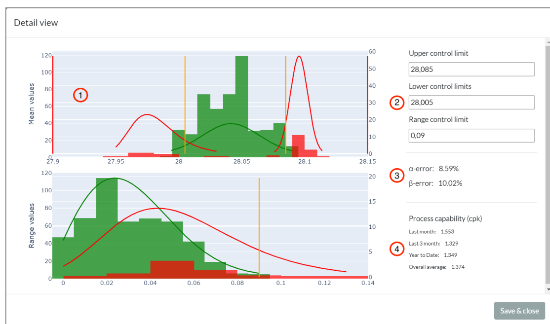
Figure 3: View 2: Configuring the control chart

The user can switch back and forth between the two views we just described (Figure 2 and 3). This supports the iterative process of Phase I of designing a control chart where control limits are evaluated and the in-control definition of the process can be revised (see Section 2). The whole process requires extensive knowledge about the process from the user to identify the in-control process correctly and find suitable control limits for the resulting control charts. Using our application the process expert can incorporate his know-how (DP3).