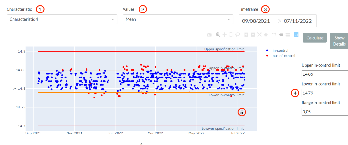
Figure 2: View 1: Defining the in-control process

The design of a control chart is conducted in a retrospective analysis (Phase I) of process data to define the in-control process (see section 2). Based on the historic data of the in-control process the control limits for the control charts are defined. Therefore our application first enables the user to identify the in-control process by setting suitable limits (see Figure 2). The user is presented with historical data of interval inspections to support this process. The drop-down menu at the top left (1) allows the user to select the quality characteristic to inspect. Next to the drop-down menu (2) he can switch between showing the mean, range, or all values of the individual samples of the inspections. Also, the period to consider can be changed (3). With simple input fields (4) the user is able to adjust the limits for the in-control process. All changes are shown in real time in the central graph (5). Specification limits of the quality characteristics are shown in red, and limits of the in-control process are in orange. In-control data points are colored blue, and points indicating an out-of-control process are red.