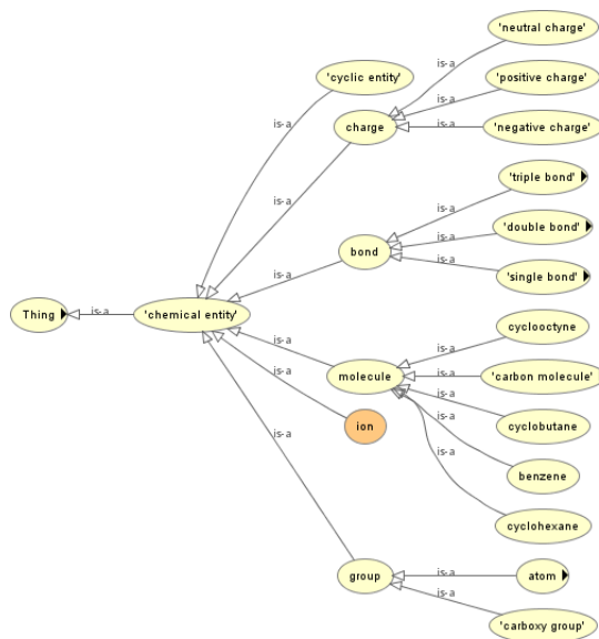
Fig. 1. Core ontology structure

The vertices (but not the properties) of the description graphs are also classified in the main OWL ontology. The main class is classified beneath ‘molecule’ in the main ontology, the atoms beneath ‘atom’ and the bonds beneath ‘bond’.