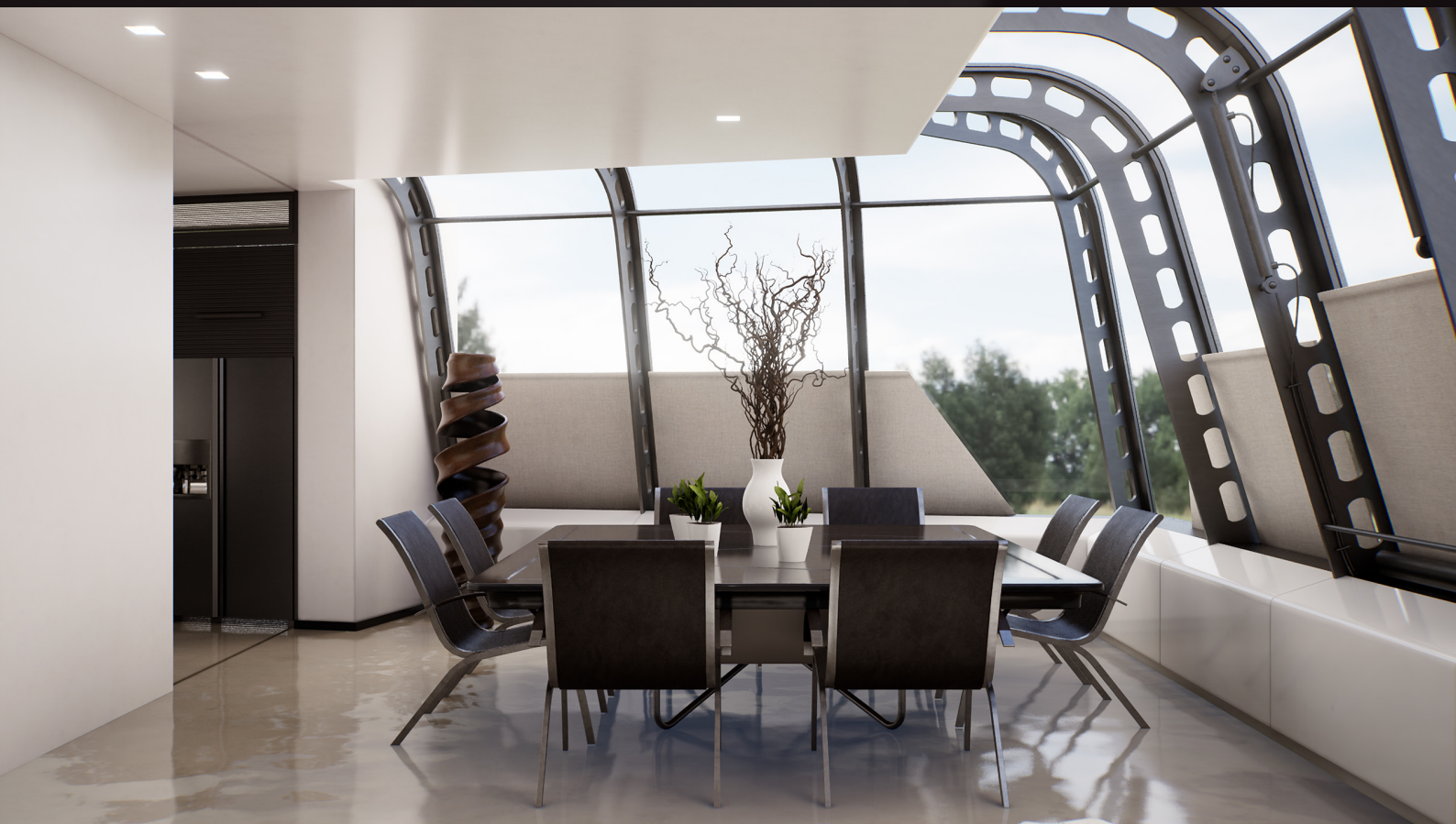
screenshot scene 01 cam 02

Get full immersion! With Archinteriors for Unreal Engine 4 vol. 1 Remastered you can experience the architectural scenes as never before. Six interior scenes for Unreal Engine 4 - compatible with RTX graphics cards and the latest Unreal Engine 4 version. All scenes come now with improved lighting and reflections, new textures and materials, many new props and optimised geometry. All customers that will get this scene, will get also an update to Unreal Engine 5 for free, when it will be released.