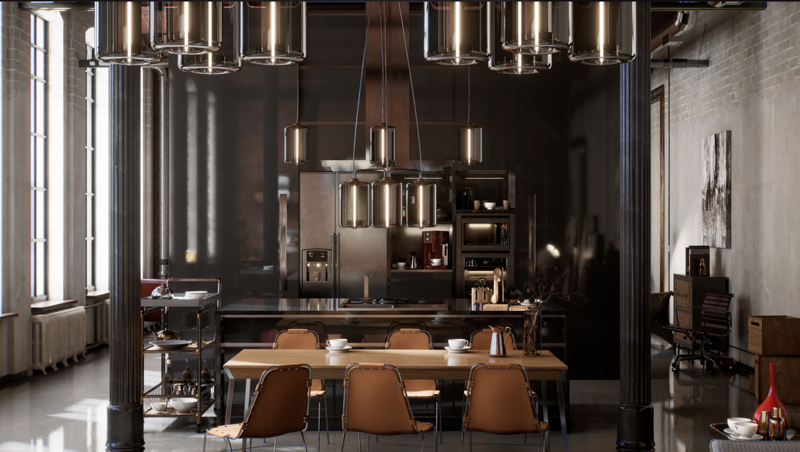
screenshot scene 06 cam 01

Get full immersion! With Archinteriors for Unreal Engine 4 vol. 1 Remastered you can experience the architectural scenes as never before. Six interior scenes for Unreal Engine 4 - compatible with RTX graphics cards and the latest Unreal Engine 4 version. All scenes come now with improved lighting and reflections, new textures and materials, many new props and optimised geometry. All customers that will get this scene, will get also an update to Unreal Engine 5 for free, when it will be released.