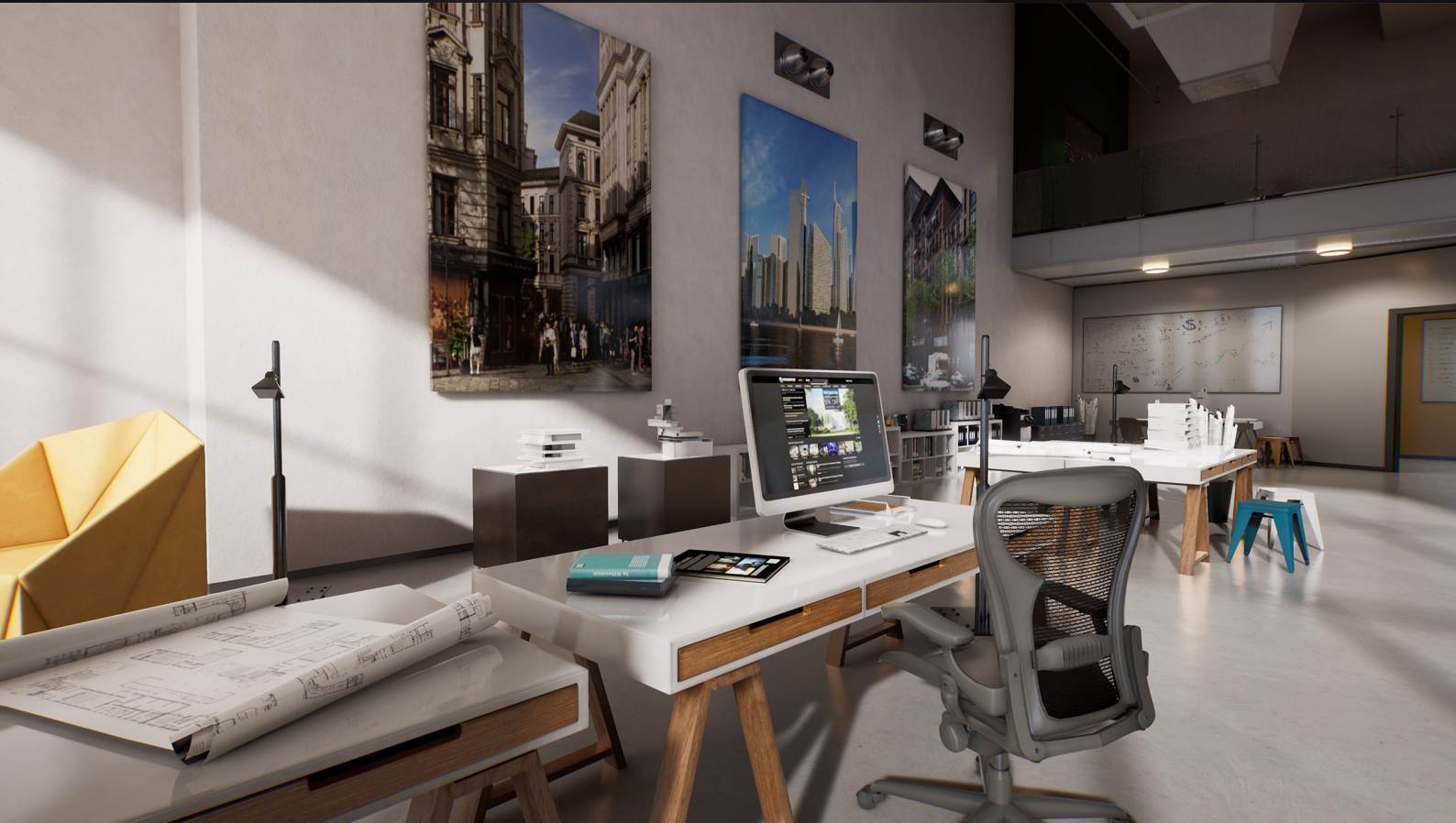
screenshot scene 05 cam 05

Get full immersion! With Archinteriors for Unreal Engine 4 vol. 1 Remastered you can experience the architectural scenes as never before. Six interior scenes for Unreal Engine 4 - compatible with RTX graphics cards and the latest Unreal Engine 4 version. All scenes come now with improved lighting and reflections, new textures and materials, many new props and optimised geometry. All customers that will get this scene, will get also an update to Unreal Engine 5 for free, when it will be released.