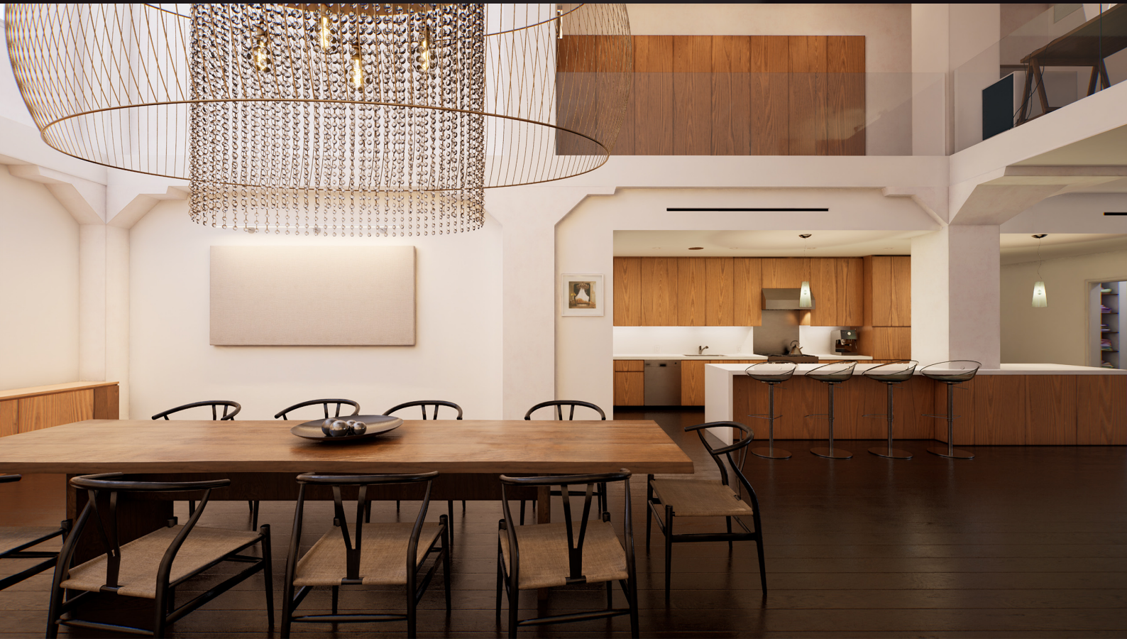
screenshot scene 04 cam 03

Get full immersion! With Archinteriors for Unreal Engine 4 vol. 1 Remastered you can experience the architectural scenes as never before. Six interior scenes for Unreal Engine 4 - compatible with RTX graphics cards and the latest Unreal Engine 4 version. All scenes come now with improved lighting and reflections, new textures and materials, many new props and optimised geometry. All customers that will get this scene, will get also an update to Unreal Engine 5 for free, when it will be released.