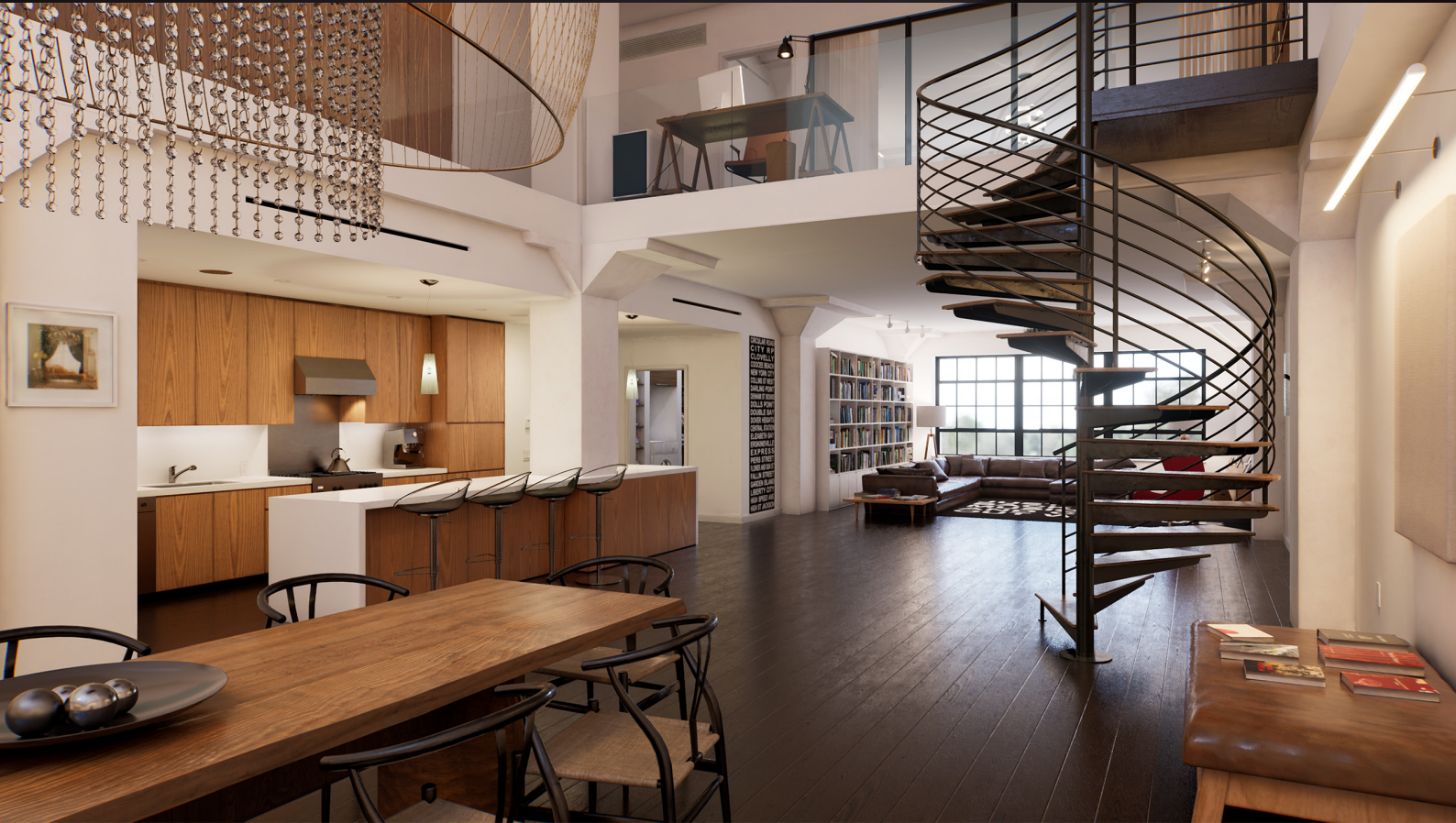
screenshot scene 04 cam 01

Get full immersion! With Archinteriors for Unreal Engine 4 vol. 1 Remastered you can experience the architectural scenes as never before. Six interior scenes for Unreal Engine 4 - compatible with RTX graphics cards and the latest Unreal Engine 4 version. All scenes come now with improved lighting and reflections, new textures and materials, many new props and optimised geometry. All customers that will get this scene, will get also an update to Unreal Engine 5 for free, when it will be released.