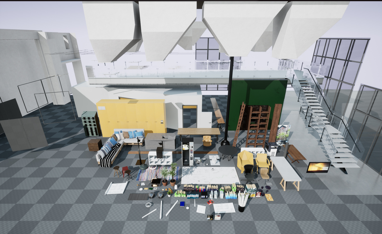
overview scene 05

Get full immersion! With Archinteriors for Unreal Engine 4 vol. 1 Remastered you can experience the architectural scenes as never before. Six interior scenes for Unreal Engine 4 - compatible with RTX graphics cards and the latest Unreal Engine 4 version. All scenes come now with improved lighting and reflections, new textures and materials, many new props and optimised geometry. All customers that will get this scene, will get also an update to Unreal Engine 5 for free, when it will be released.