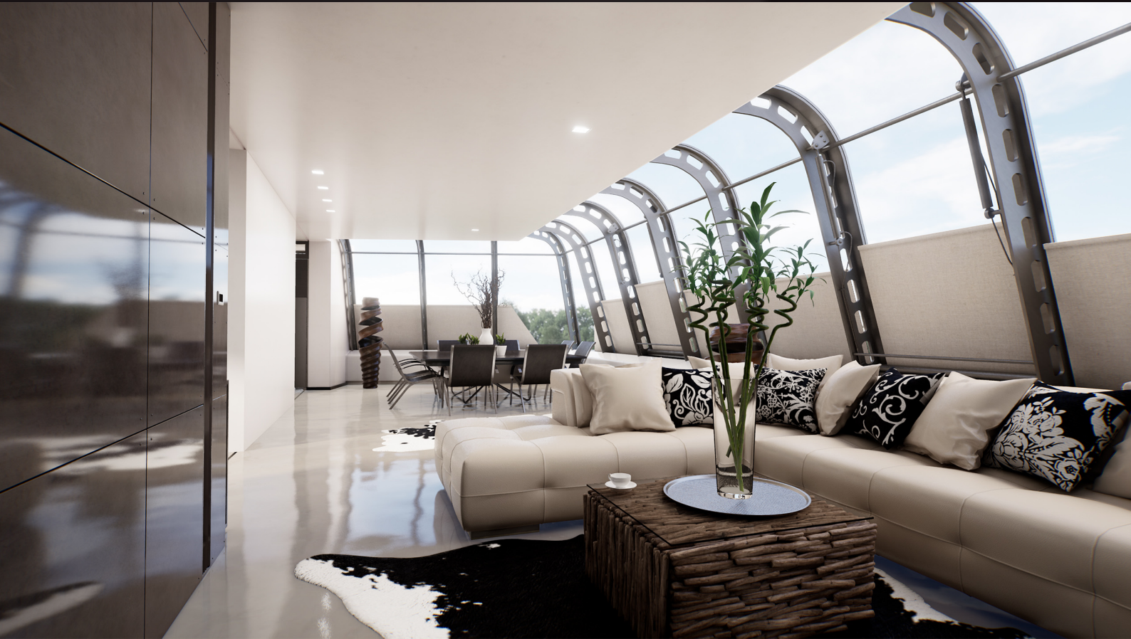
screenshot scene 01 cam 01

Get full immersion! With Archinteriors for Unreal Engine 4 vol. 1 Remastered you can experience the architectural scenes as never before. Six interior scenes for Unreal Engine 4 - compatible with RTX graphics cards and the latest Unreal Engine 4 version. All scenes come now with improved lighting and reflections, new textures and materials, many new props and optimised geometry. All customers that will get this scene, will get also an update to Unreal Engine 5 for free, when it will be released.