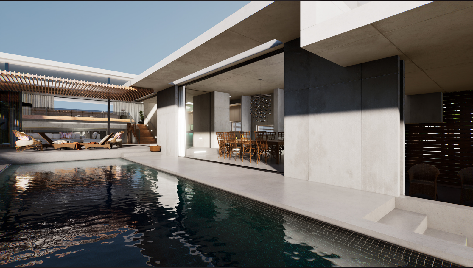
screenshot scene 02 cam 03

Get full immersion! With Archinteriors for Unreal Engine 4 vol. 1 Remastered you can experience the architectural scenes as never before. Six interior scenes for Unreal Engine 4 - compatible with RTX graphics cards and the latest Unreal Engine 4 version. All scenes come now with improved lighting and reflections, new textures and materials, many new props and optimised geometry. All customers that will get this scene, will get also an update to Unreal Engine 5 for free, when it will be released.