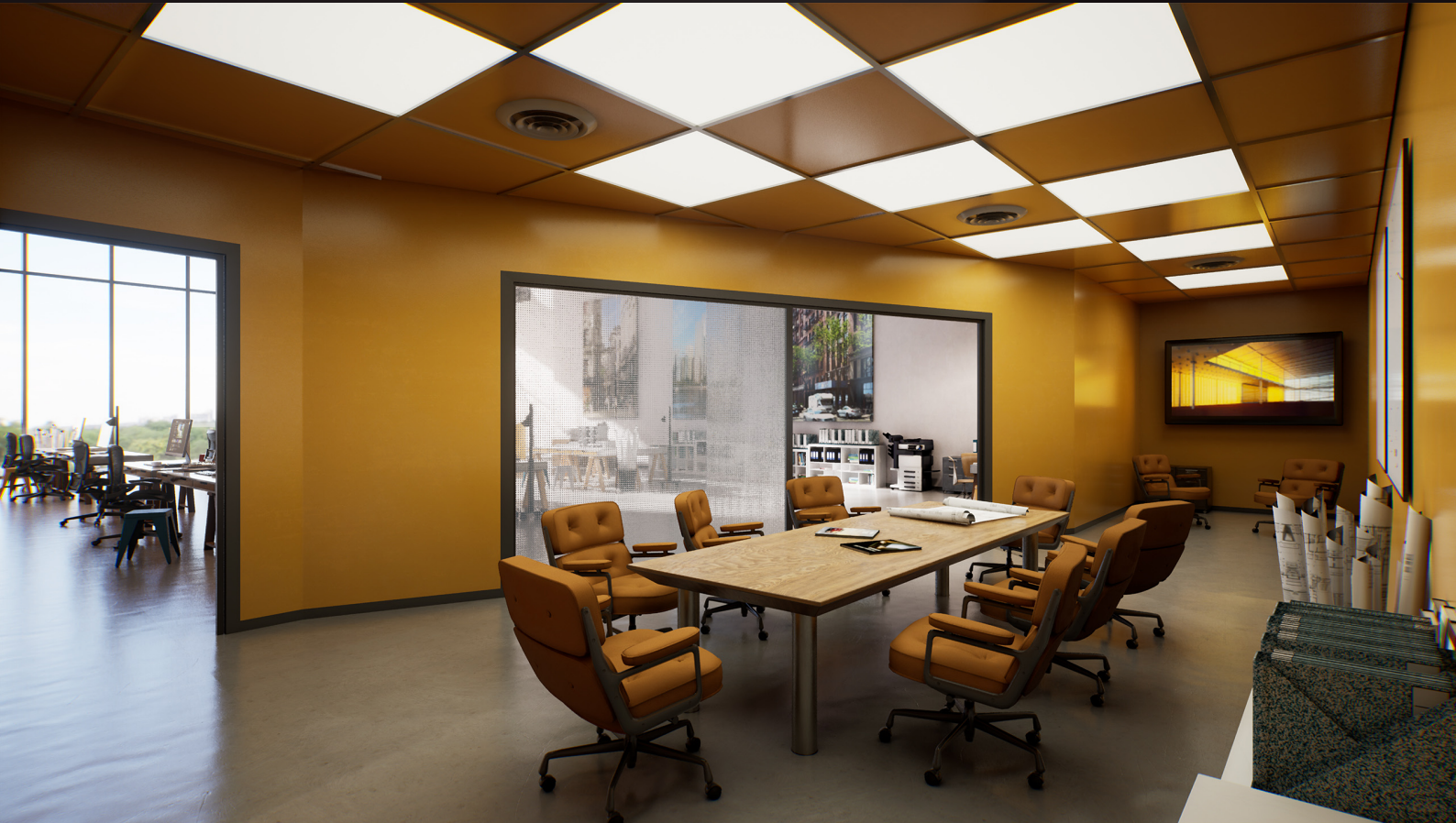
screenshot scene 05 cam 03

Get full immersion! With Archinteriors for Unreal Engine 4 vol. 1 Remastered you can experience the architectural scenes as never before. Six interior scenes for Unreal Engine 4 - compatible with RTX graphics cards and the latest Unreal Engine 4 version. All scenes come now with improved lighting and reflections, new textures and materials, many new props and optimised geometry. All customers that will get this scene, will get also an update to Unreal Engine 5 for free, when it will be released.