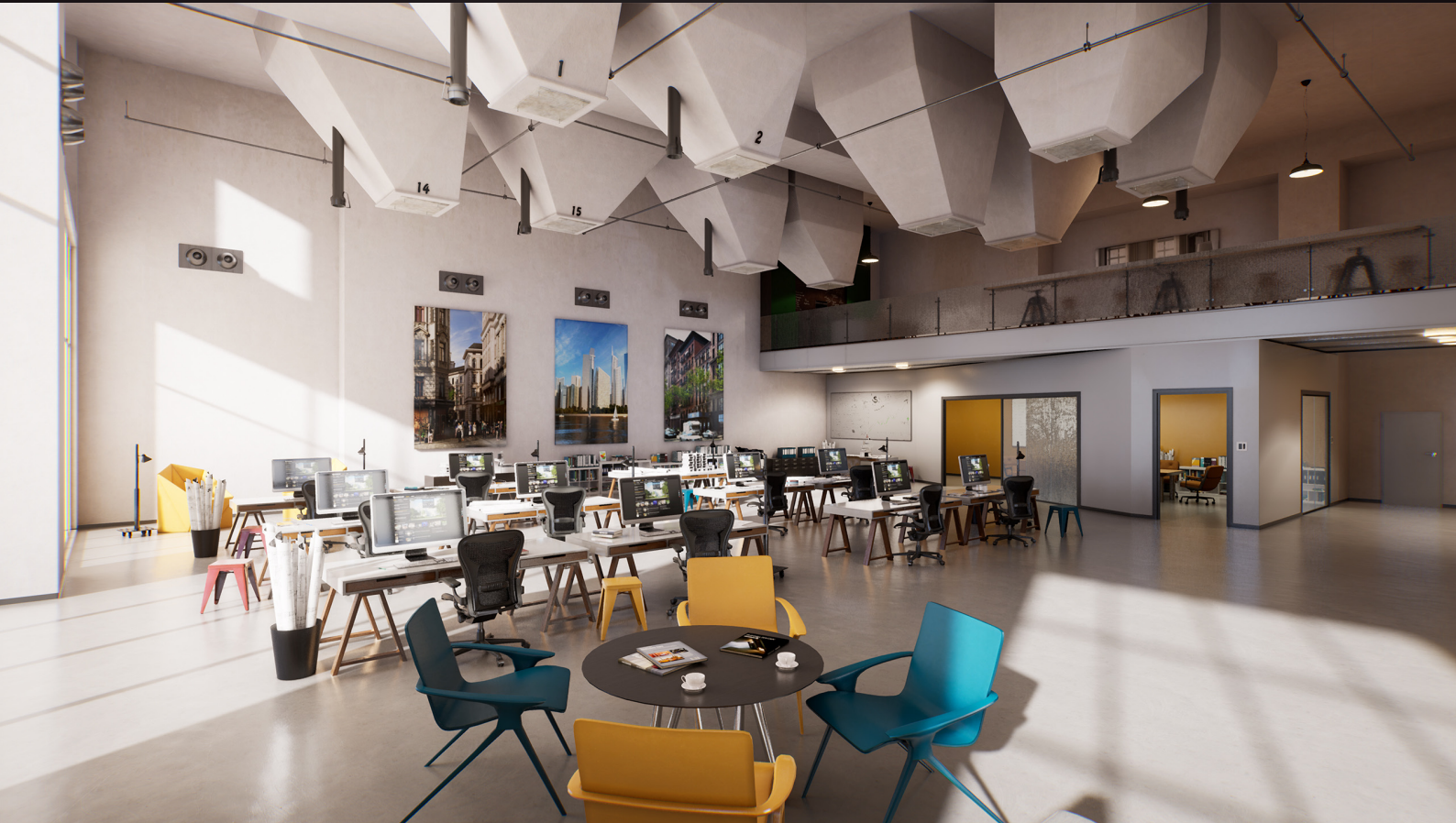
screenshot scene 05 cam 01

Get full immersion! With Archinteriors for Unreal Engine 4 vol. 1 Remastered you can experience the architectural scenes as never before. Six interior scenes for Unreal Engine 4 - compatible with RTX graphics cards and the latest Unreal Engine 4 version. All scenes come now with improved lighting and reflections, new textures and materials, many new props and optimised geometry. All customers that will get this scene, will get also an update to Unreal Engine 5 for free, when it will be released.