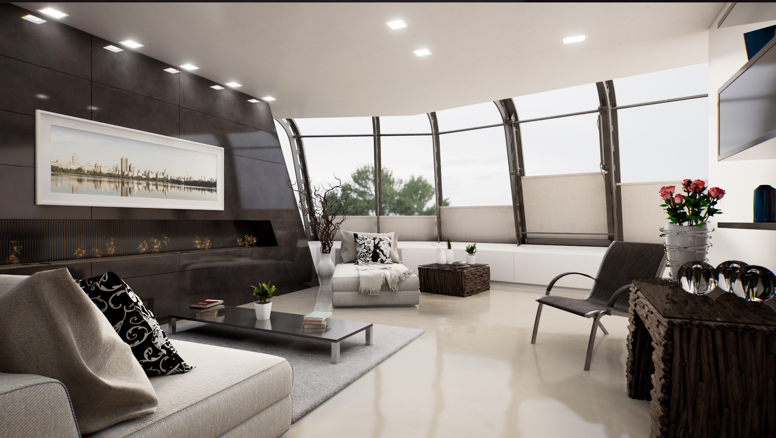
screenshot scene 01 cam 04

Get full immersion! With Archinteriors for Unreal Engine 4 vol. 1 Remastered you can experience the architectural scenes as never before. Six interior scenes for Unreal Engine 4 - compatible with RTX graphics cards and the latest Unreal Engine 4 version. All scenes come now with improved lighting and reflections, new textures and materials, many new props and optimised geometry. All customers that will get this scene, will get also an update to Unreal Engine 5 for free, when it will be released.