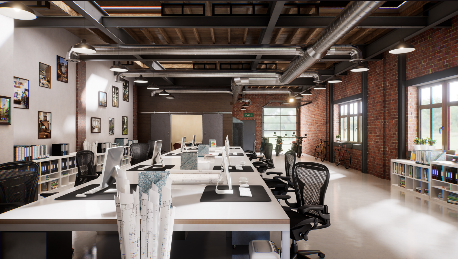
screenshot scene 03 cam 05

Get full immersion! With Archinteriors for Unreal Engine 4 vol. 1 Remastered you can experience the architectural scenes as never before. Six interior scenes for Unreal Engine 4 - compatible with RTX graphics cards and the latest Unreal Engine 4 version. All scenes come now with improved lighting and reflections, new textures and materials, many new props and optimised geometry. All customers that will get this scene, will get also an update to Unreal Engine 5 for free, when it will be released.