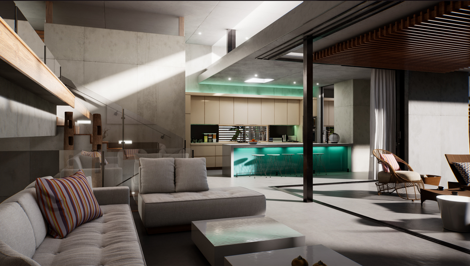
screenshot scene 02 cam 01

Get full immersion! With Archinteriors for Unreal Engine 4 vol. 1 Remastered you can experience the architectural scenes as never before. Six interior scenes for Unreal Engine 4 - compatible with RTX graphics cards and the latest Unreal Engine 4 version. All scenes come now with improved lighting and reflections, new textures and materials, many new props and optimised geometry. All customers that will get this scene, will get also an update to Unreal Engine 5 for free, when it will be released.