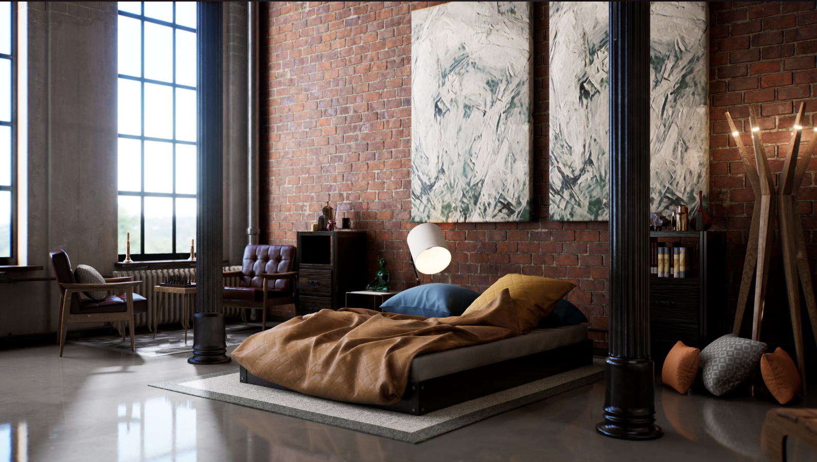
screenshot scene 06 cam 05

Get full immersion! With Archinteriors for Unreal Engine 4 vol. 1 Remastered you can experience the architectural scenes as never before. Six interior scenes for Unreal Engine 4 - compatible with RTX graphics cards and the latest Unreal Engine 4 version. All scenes come now with improved lighting and reflections, new textures and materials, many new props and optimised geometry. All customers that will get this scene, will get also an update to Unreal Engine 5 for free, when it will be released.