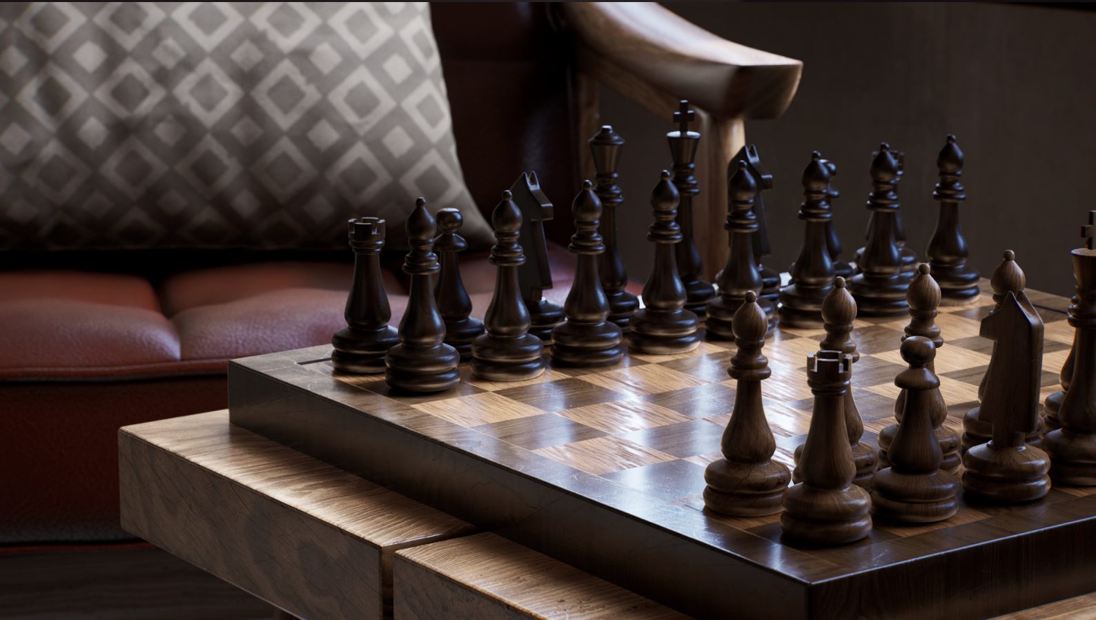
screenshot scene 06 cam 04

Get full immersion! With Archinteriors for Unreal Engine 4 vol. 1 Remastered you can experience the architectural scenes as never before. Six interior scenes for Unreal Engine 4 - compatible with RTX graphics cards and the latest Unreal Engine 4 version. All scenes come now with improved lighting and reflections, new textures and materials, many new props and optimised geometry. All customers that will get this scene, will get also an update to Unreal Engine 5 for free, when it will be released.