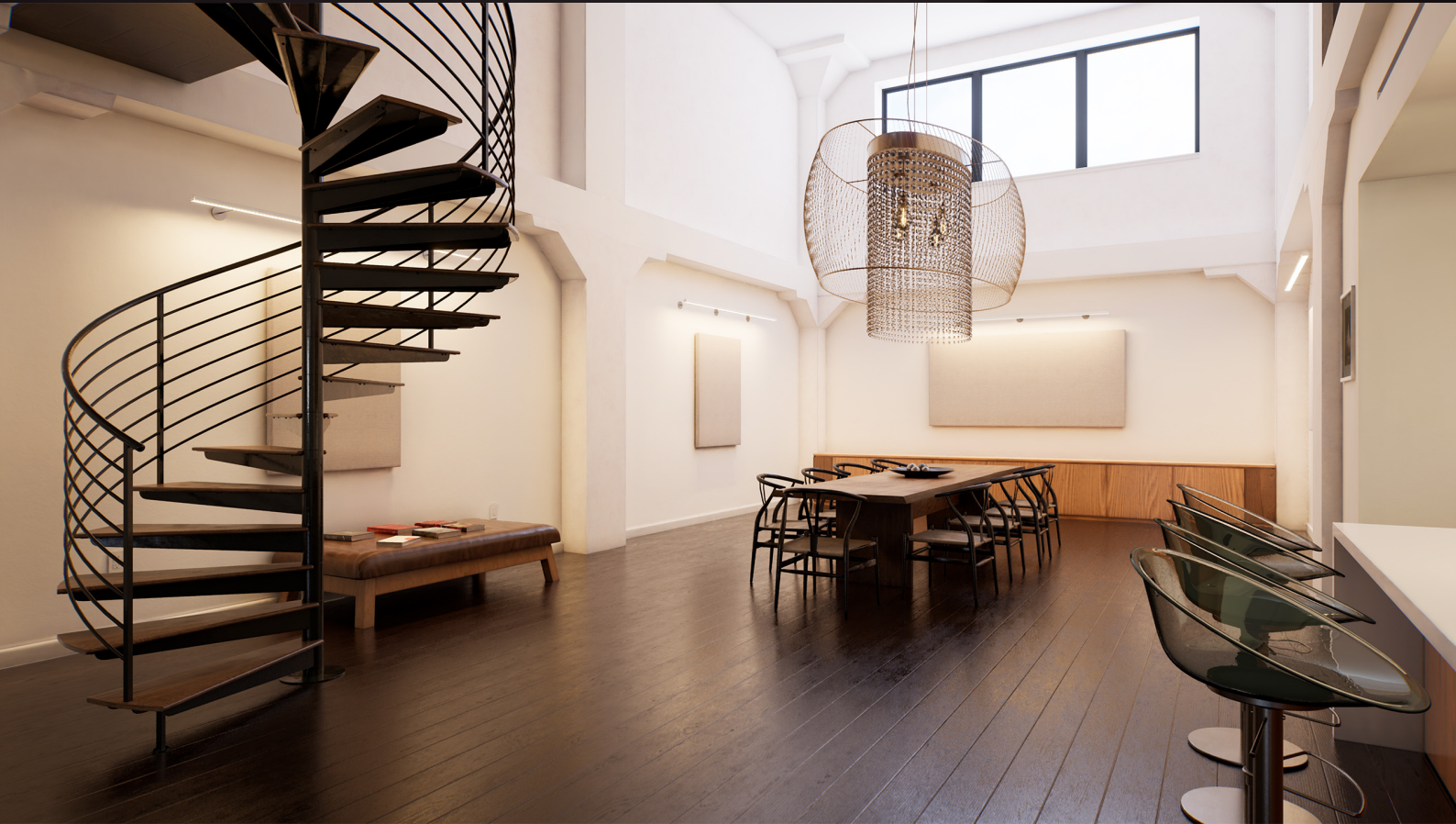
screenshot scene 04 cam 02

Get full immersion! With Archinteriors for Unreal Engine 4 vol. 1 Remastered you can experience the architectural scenes as never before. Six interior scenes for Unreal Engine 4 - compatible with RTX graphics cards and the latest Unreal Engine 4 version. All scenes come now with improved lighting and reflections, new textures and materials, many new props and optimised geometry. All customers that will get this scene, will get also an update to Unreal Engine 5 for free, when it will be released.