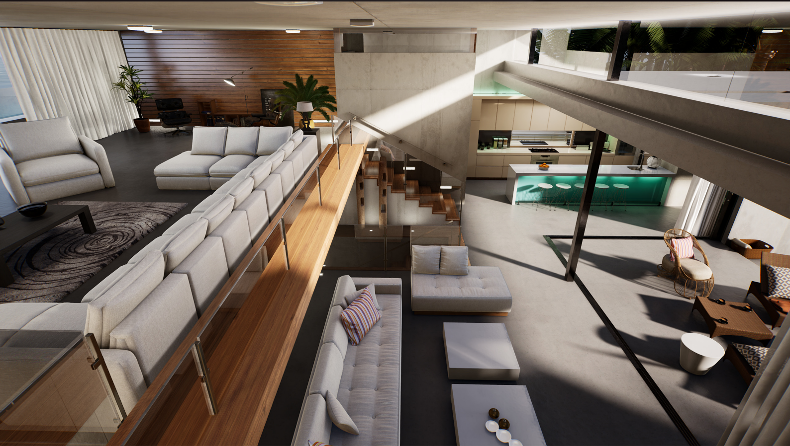
screenshot scene 02 cam 02

Get full immersion! With Archinteriors for Unreal Engine 4 vol. 1 Remastered you can experience the architectural scenes as never before. Six interior scenes for Unreal Engine 4 - compatible with RTX graphics cards and the latest Unreal Engine 4 version. All scenes come now with improved lighting and reflections, new textures and materials, many new props and optimised geometry. All customers that will get this scene, will get also an update to Unreal Engine 5 for free, when it will be released.