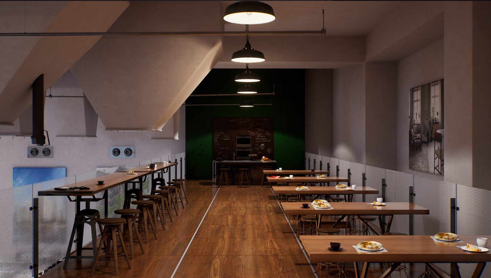
screenshot scene 05 cam 02

Get full immersion! With Archinteriors for Unreal Engine 4 vol. 1 Remastered you can experience the architectural scenes as never before. Six interior scenes for Unreal Engine 4 - compatible with RTX graphics cards and the latest Unreal Engine 4 version. All scenes come now with improved lighting and reflections, new textures and materials, many new props and optimised geometry. All customers that will get this scene, will get also an update to Unreal Engine 5 for free, when it will be released.