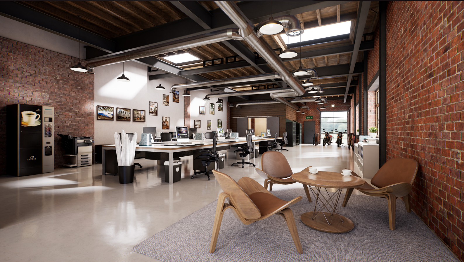
screenshot scene 03 cam 01

Get full immersion! With Archinteriors for Unreal Engine 4 vol. 1 Remastered you can experience the architectural scenes as never before. Six interior scenes for Unreal Engine 4 - compatible with RTX graphics cards and the latest Unreal Engine 4 version. All scenes come now with improved lighting and reflections, new textures and materials, many new props and optimised geometry. All customers that will get this scene, will get also an update to Unreal Engine 5 for free, when it will be released.