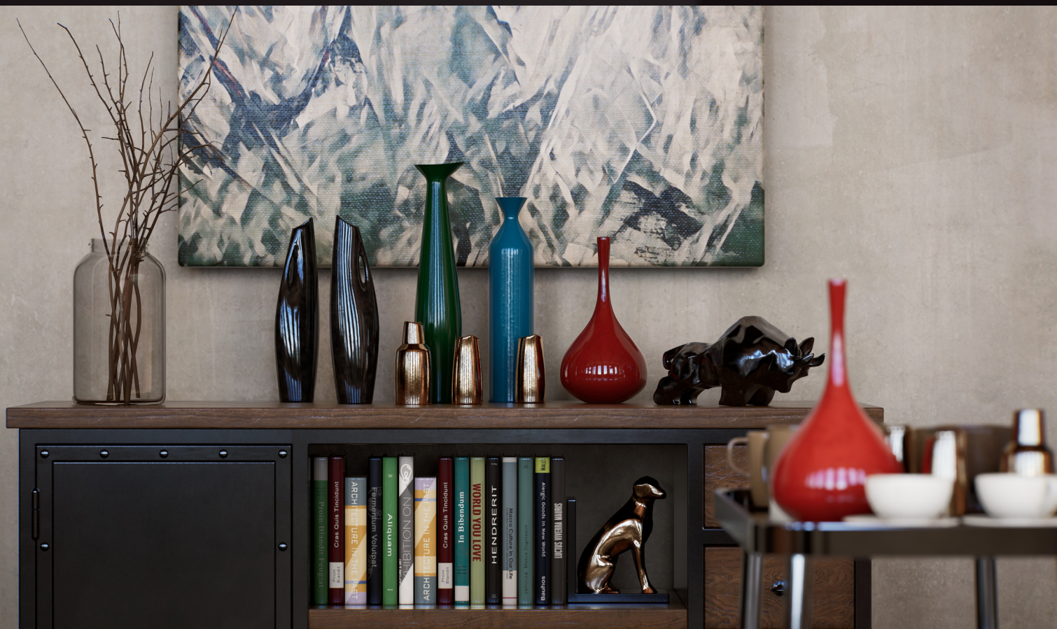
screenshot scene 06 cam 03

Get full immersion! With Archinteriors for Unreal Engine 4 vol. 1 Remastered you can experience the architectural scenes as never before. Six interior scenes for Unreal Engine 4 - compatible with RTX graphics cards and the latest Unreal Engine 4 version. All scenes come now with improved lighting and reflections, new textures and materials, many new props and optimised geometry. All customers that will get this scene, will get also an update to Unreal Engine 5 for free, when it will be released.