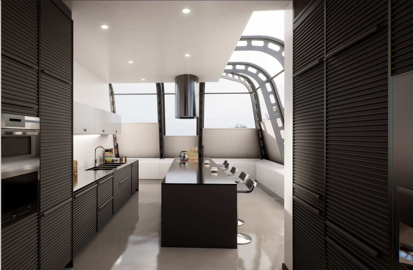
screenshot scene 01 cam 03

Get full immersion! With Archinteriors for Unreal Engine 4 vol. 1 Remastered you can experience the architectural scenes as never before. Six interior scenes for Unreal Engine 4 - compatible with RTX graphics cards and the latest Unreal Engine 4 version. All scenes come now with improved lighting and reflections, new textures and materials, many new props and optimised geometry. All customers that will get this scene, will get also an update to Unreal Engine 5 for free, when it will be released.