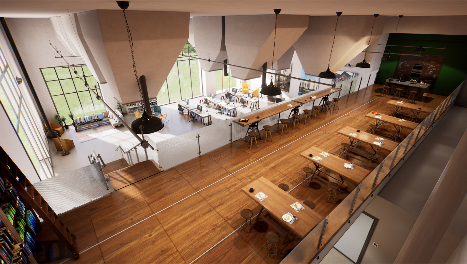
screenshot scene 05 cam 04

Get full immersion! With Archinteriors for Unreal Engine 4 vol. 1 Remastered you can experience the architectural scenes as never before. Six interior scenes for Unreal Engine 4 - compatible with RTX graphics cards and the latest Unreal Engine 4 version. All scenes come now with improved lighting and reflections, new textures and materials, many new props and optimised geometry. All customers that will get this scene, will get also an update to Unreal Engine 5 for free, when it will be released.