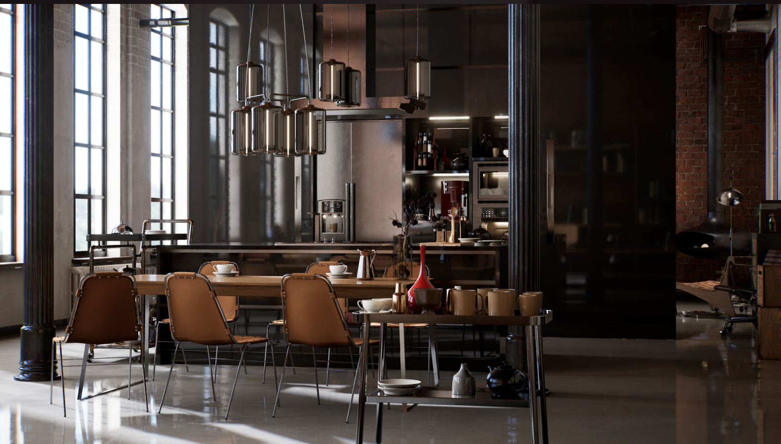
screenshot scene 06 cam 02

Get full immersion! With Archinteriors for Unreal Engine 4 vol. 1 Remastered you can experience the architectural scenes as never before. Six interior scenes for Unreal Engine 4 - compatible with RTX graphics cards and the latest Unreal Engine 4 version. All scenes come now with improved lighting and reflections, new textures and materials, many new props and optimised geometry. All customers that will get this scene, will get also an update to Unreal Engine 5 for free, when it will be released.