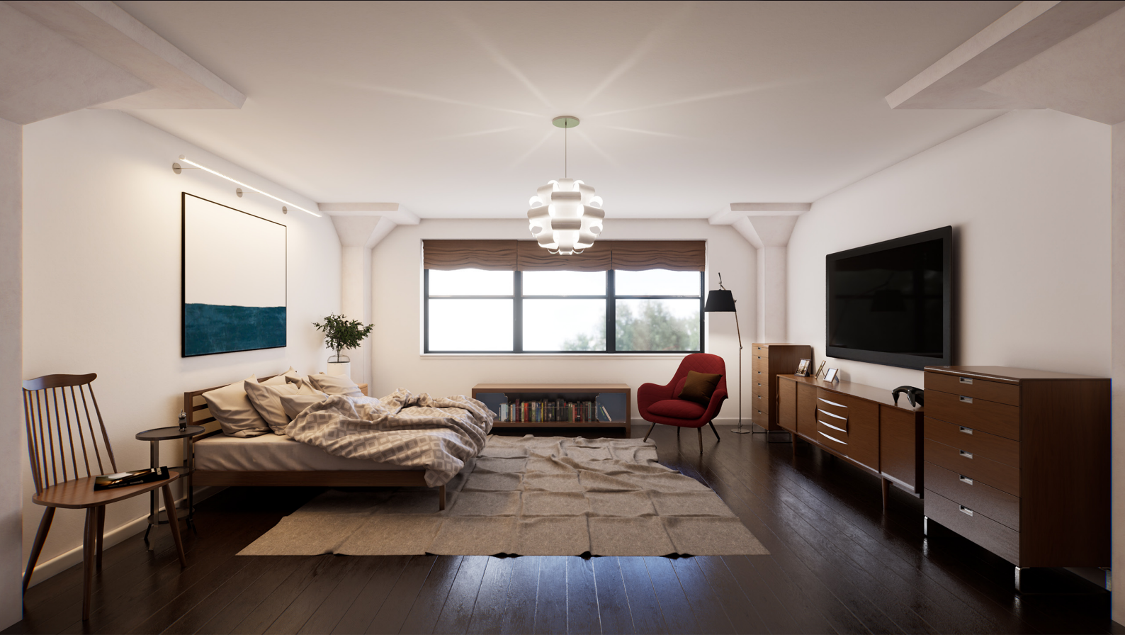
screenshot scene 04 cam 05

Get full immersion! With Archinteriors for Unreal Engine 4 vol. 1 Remastered you can experience the architectural scenes as never before. Six interior scenes for Unreal Engine 4 - compatible with RTX graphics cards and the latest Unreal Engine 4 version. All scenes come now with improved lighting and reflections, new textures and materials, many new props and optimised geometry. All customers that will get this scene, will get also an update to Unreal Engine 5 for free, when it will be released.