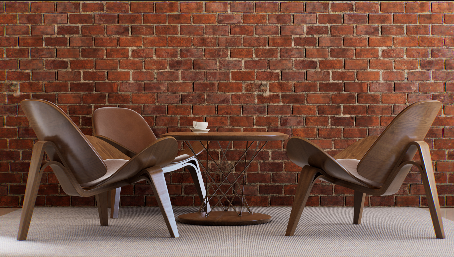
screenshot scene 03 cam 03

Get full immersion! With Archinteriors for Unreal Engine 4 vol. 1 Remastered you can experience the architectural scenes as never before. Six interior scenes for Unreal Engine 4 - compatible with RTX graphics cards and the latest Unreal Engine 4 version. All scenes come now with improved lighting and reflections, new textures and materials, many new props and optimised geometry. All customers that will get this scene, will get also an update to Unreal Engine 5 for free, when it will be released.