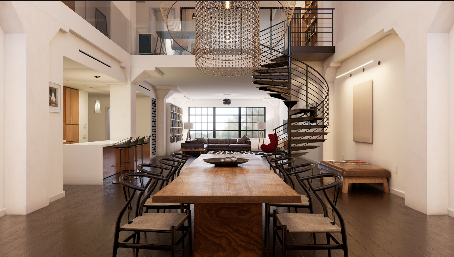
screenshot scene 04 cam 04

Get full immersion! With Archinteriors for Unreal Engine 4 vol. 1 Remastered you can experience the architectural scenes as never before. Six interior scenes for Unreal Engine 4 - compatible with RTX graphics cards and the latest Unreal Engine 4 version. All scenes come now with improved lighting and reflections, new textures and materials, many new props and optimised geometry. All customers that will get this scene, will get also an update to Unreal Engine 5 for free, when it will be released.