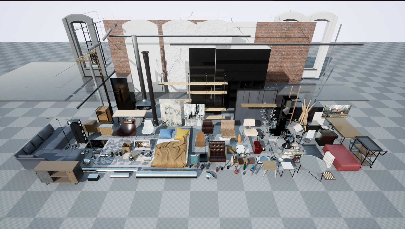
overview scene 06

Get full immersion! With Archinteriors for Unreal Engine 4 vol. 1 Remastered you can experience the architectural scenes as never before. Six interior scenes for Unreal Engine 4 - compatible with RTX graphics cards and the latest Unreal Engine 4 version. All scenes come now with improved lighting and reflections, new textures and materials, many new props and optimised geometry. All customers that will get this scene, will get also an update to Unreal Engine 5 for free, when it will be released.