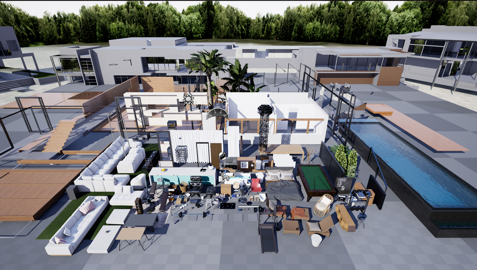
overview scene 02

Get full immersion! With Archinteriors for Unreal Engine 4 vol. 1 Remastered you can experience the architectural scenes as never before. Six interior scenes for Unreal Engine 4 - compatible with RTX graphics cards and the latest Unreal Engine 4 version. All scenes come now with improved lighting and reflections, new textures and materials, many new props and optimised geometry. All customers that will get this scene, will get also an update to Unreal Engine 5 for free, when it will be released.