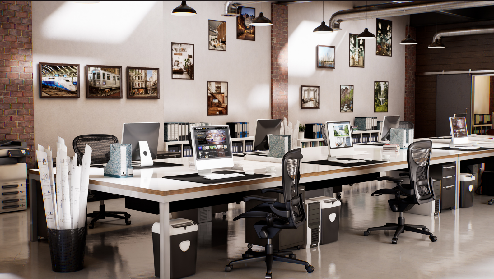
screenshot scene 03 cam 04

Get full immersion! With Archinteriors for Unreal Engine 4 vol. 1 Remastered you can experience the architectural scenes as never before. Six interior scenes for Unreal Engine 4 - compatible with RTX graphics cards and the latest Unreal Engine 4 version. All scenes come now with improved lighting and reflections, new textures and materials, many new props and optimised geometry. All customers that will get this scene, will get also an update to Unreal Engine 5 for free, when it will be released.