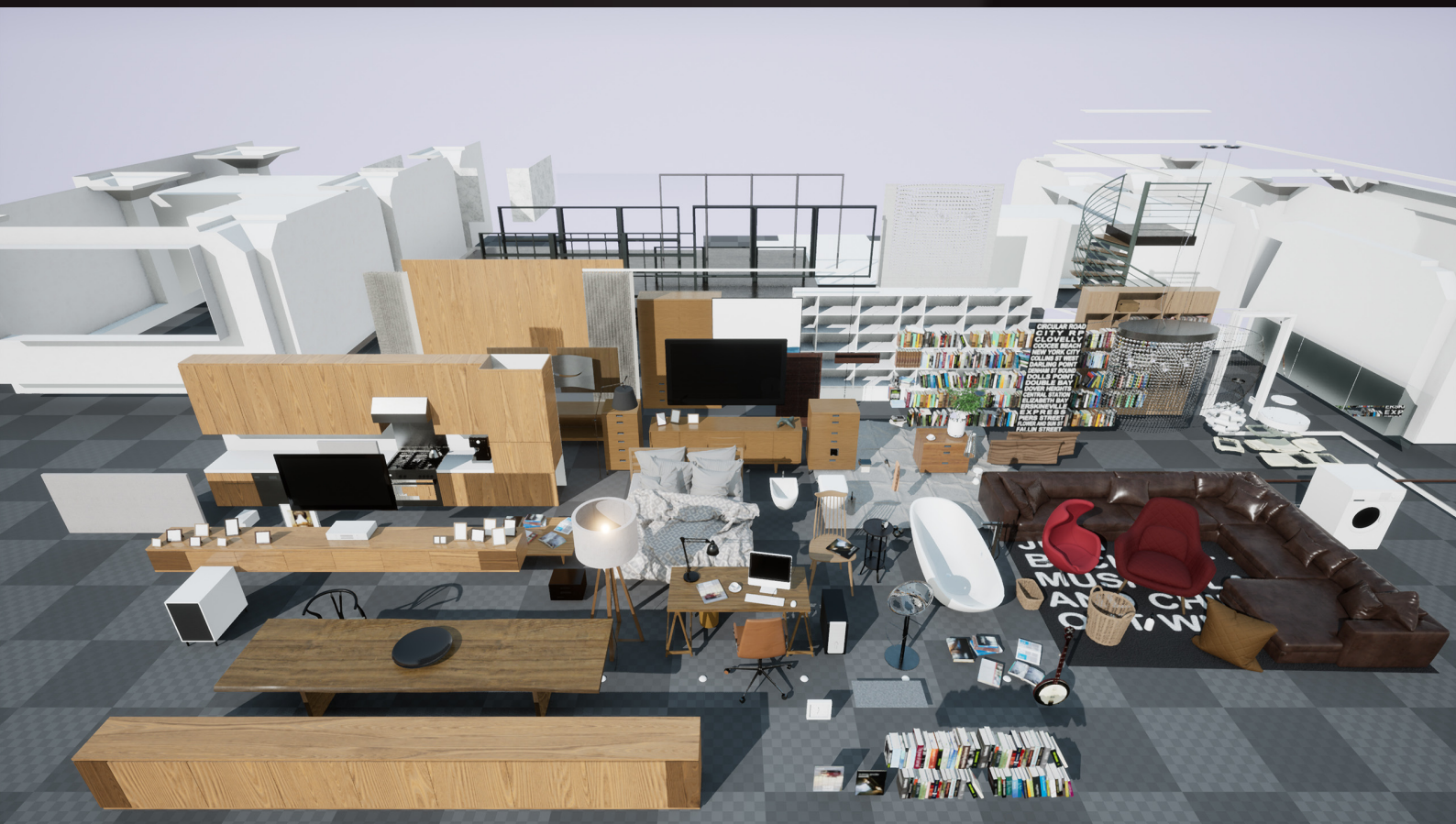
overview scene 04

Get full immersion! With Archinteriors for Unreal Engine 4 vol. 1 Remastered you can experience the architectural scenes as never before. Six interior scenes for Unreal Engine 4 - compatible with RTX graphics cards and the latest Unreal Engine 4 version. All scenes come now with improved lighting and reflections, new textures and materials, many new props and optimised geometry. All customers that will get this scene, will get also an update to Unreal Engine 5 for free, when it will be released.