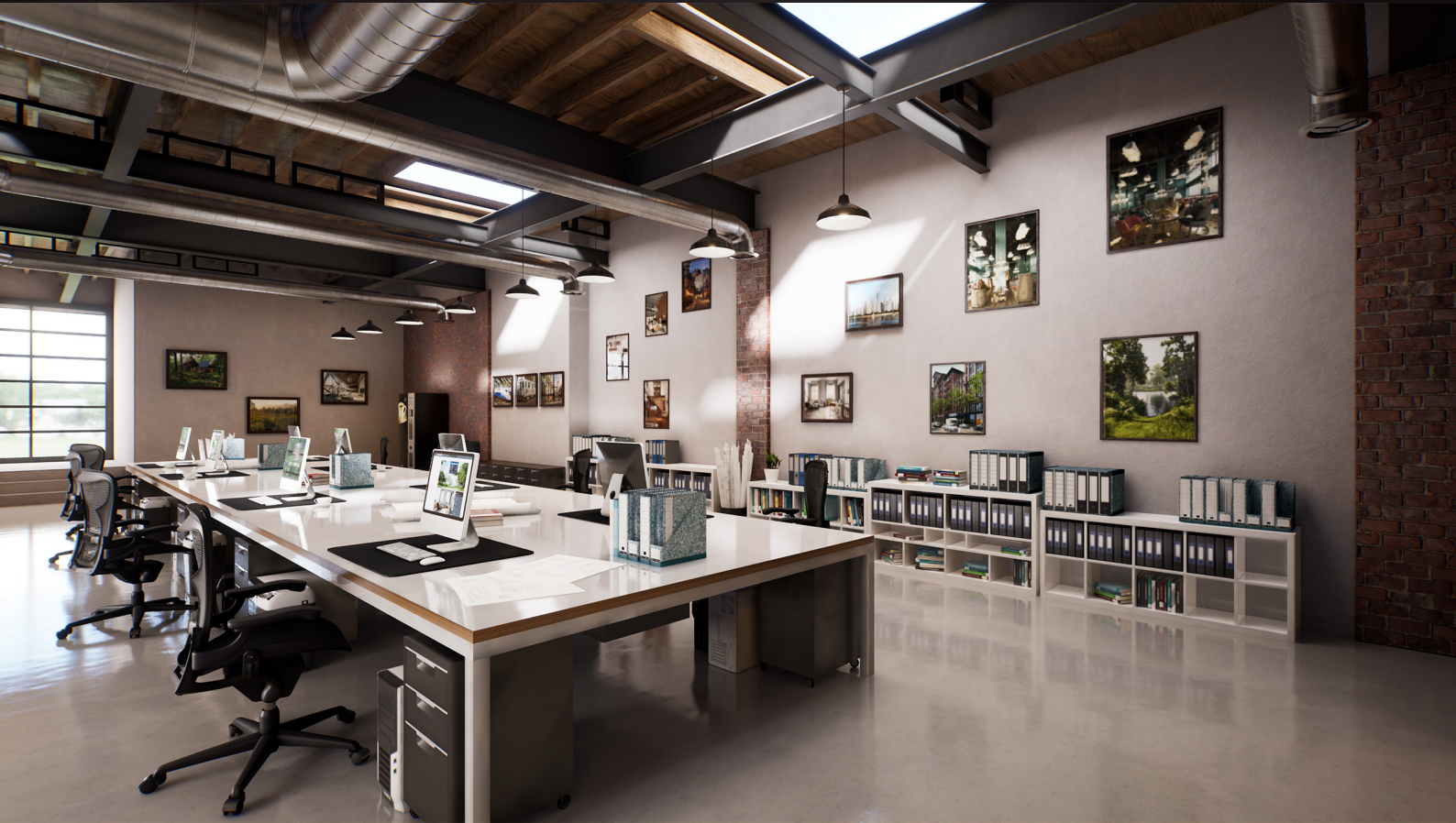
screenshot scene 03 cam 02

Get full immersion! With Archinteriors for Unreal Engine 4 vol. 1 Remastered you can experience the architectural scenes as never before. Six interior scenes for Unreal Engine 4 - compatible with RTX graphics cards and the latest Unreal Engine 4 version. All scenes come now with improved lighting and reflections, new textures and materials, many new props and optimised geometry. All customers that will get this scene, will get also an update to Unreal Engine 5 for free, when it will be released.