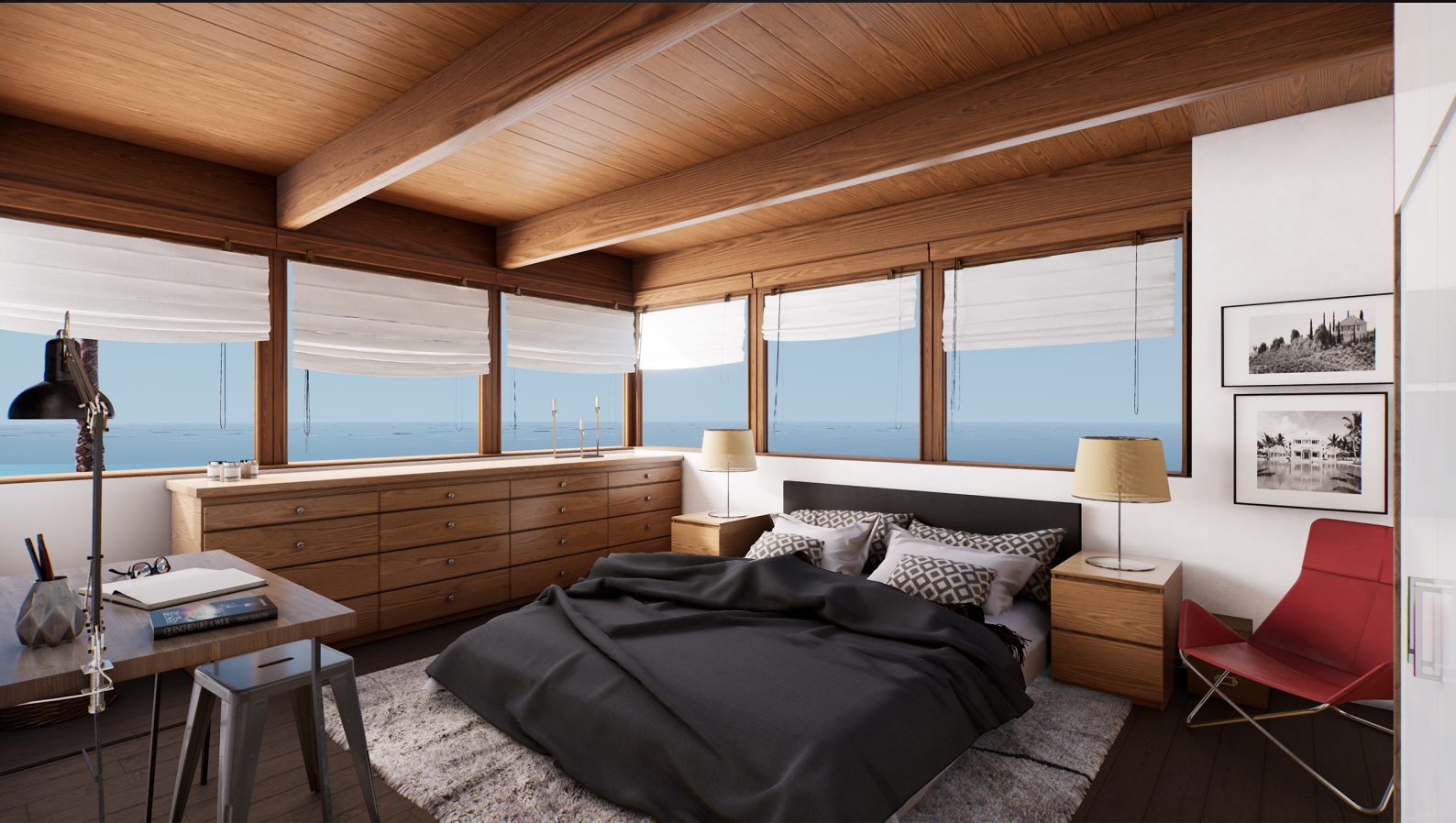
screenshot scene 02 cam 04

Get full immersion! With Archinteriors for Unreal Engine 4 vol. 1 Remastered you can experience the architectural scenes as never before. Six interior scenes for Unreal Engine 4 - compatible with RTX graphics cards and the latest Unreal Engine 4 version. All scenes come now with improved lighting and reflections, new textures and materials, many new props and optimised geometry. All customers that will get this scene, will get also an update to Unreal Engine 5 for free, when it will be released.