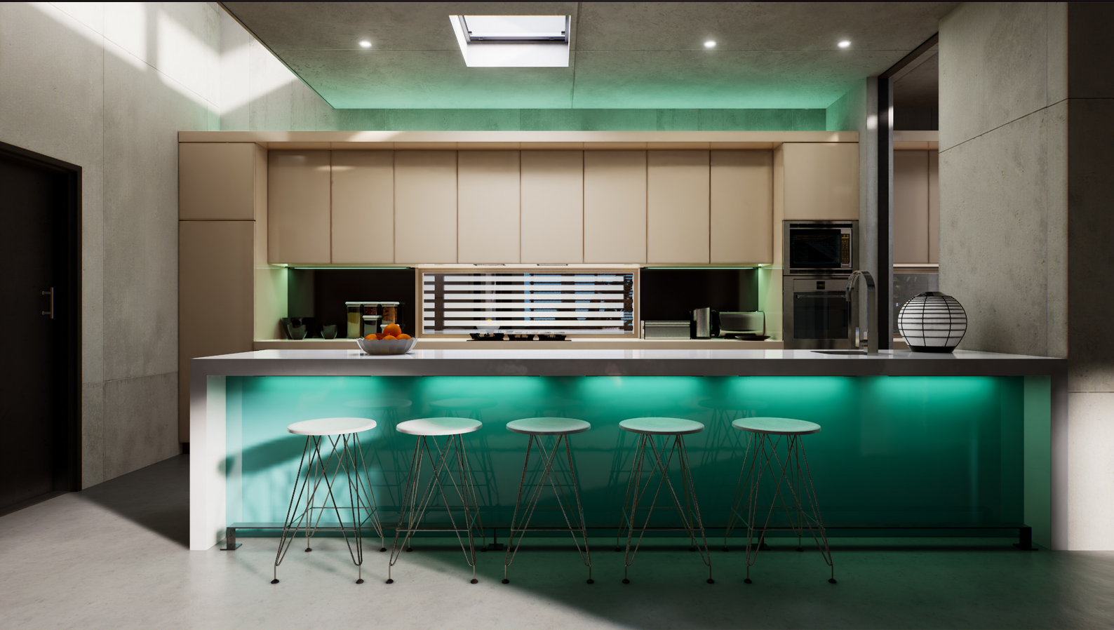
screenshot scene 02 cam 05

Get full immersion! With Archinteriors for Unreal Engine 4 vol. 1 Remastered you can experience the architectural scenes as never before. Six interior scenes for Unreal Engine 4 - compatible with RTX graphics cards and the latest Unreal Engine 4 version. All scenes come now with improved lighting and reflections, new textures and materials, many new props and optimised geometry. All customers that will get this scene, will get also an update to Unreal Engine 5 for free, when it will be released.