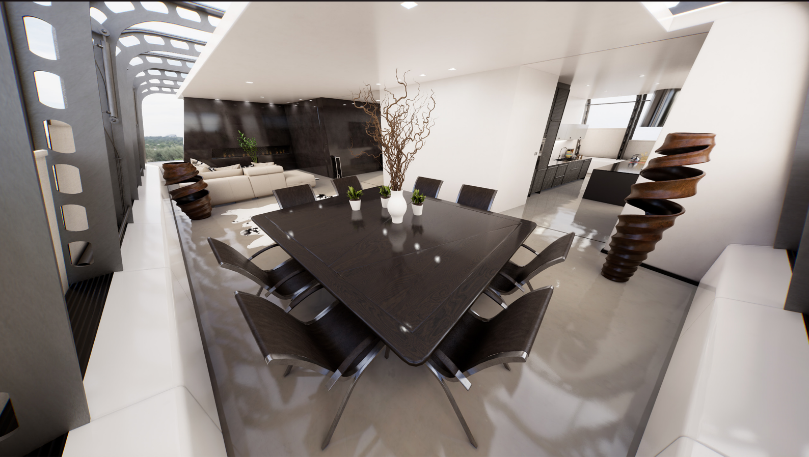
screenshot scene 01 cam 05

Get full immersion! With Archinteriors for Unreal Engine 4 vol. 1 Remastered you can experience the architectural scenes as never before. Six interior scenes for Unreal Engine 4 - compatible with RTX graphics cards and the latest Unreal Engine 4 version. All scenes come now with improved lighting and reflections, new textures and materials, many new props and optimised geometry. All customers that will get this scene, will get also an update to Unreal Engine 5 for free, when it will be released.