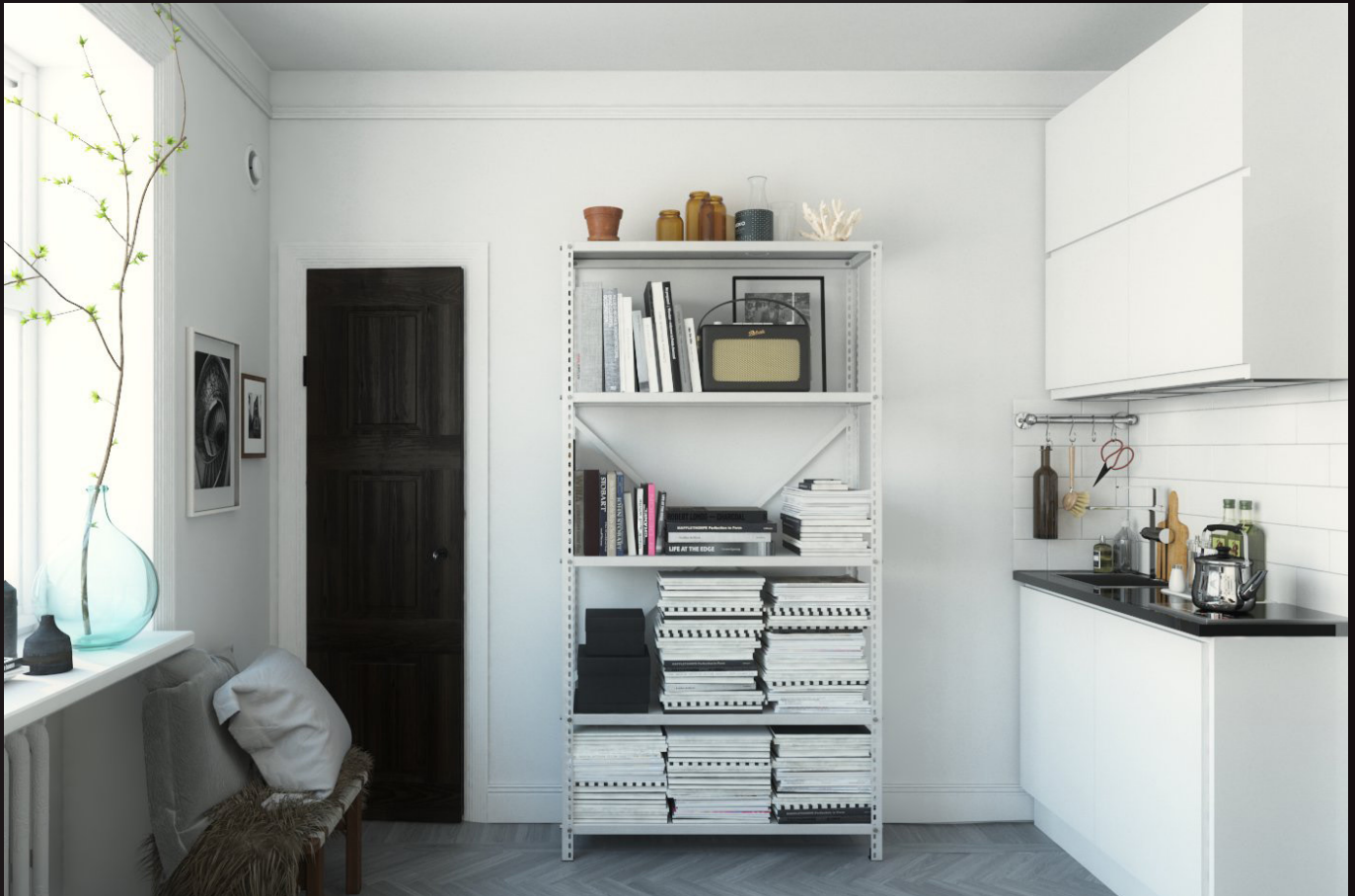
scene 03 cam 02

Have you ever wanted to make professional interior renderings? Do you know how to use V-RaySun, V-RaySky and V-RayPhysicalCamera? Have you ever had problems with composition? Archinteriors will end all your problems. Take a look at this 10 fully textured scenes with professional shaders and lighting ready to render. Get your own portfolio and join cg market.