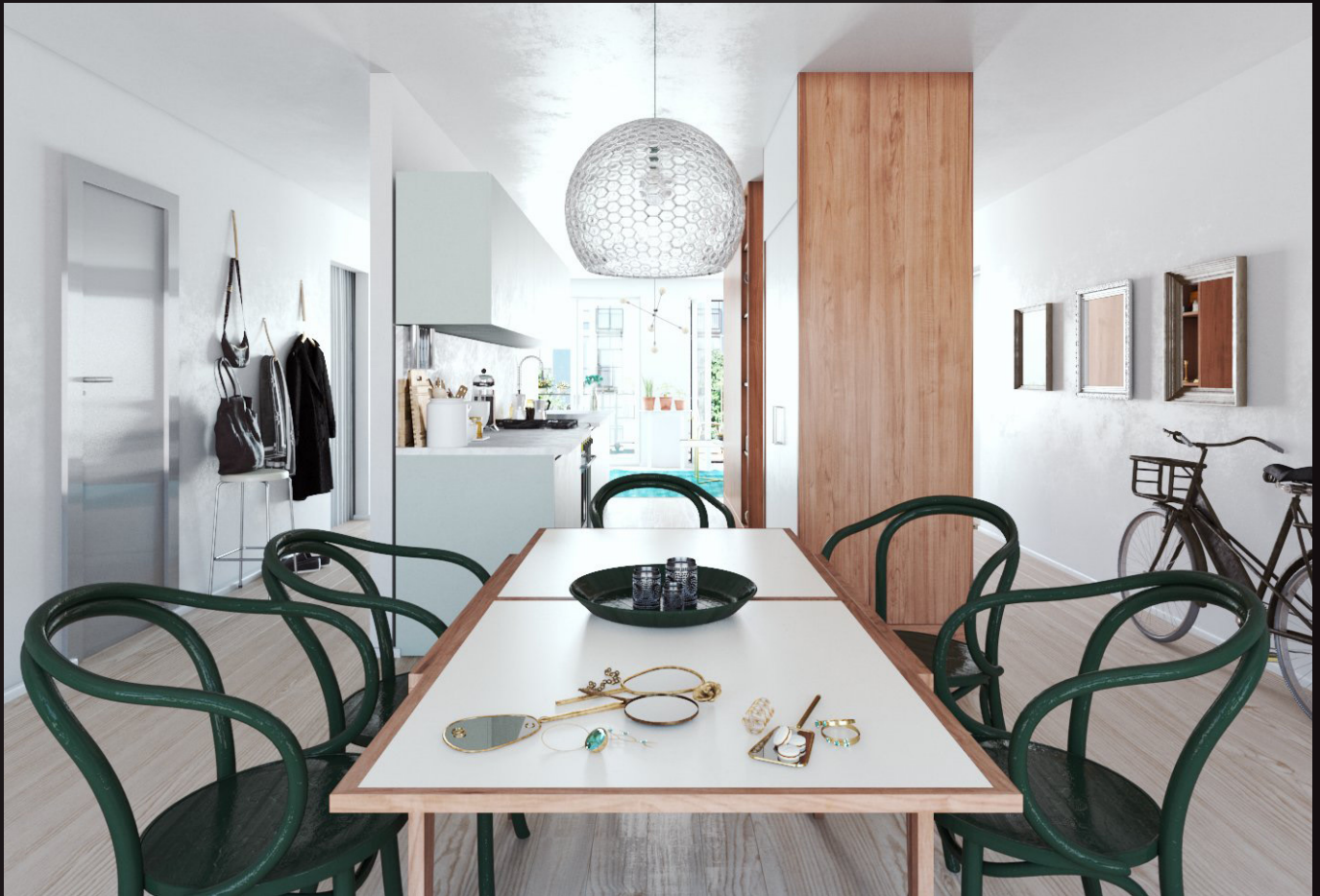
scene 07 cam 01

Have you ever wanted to make professional interior renderings? Do you know how to use V-RaySun, V-RaySky and V-RayPhysicalCamera? Have you ever had problems with composition? Archinteriors will end all your problems. Take a look at this 10 fully textured scenes with professional shaders and lighting ready to render. Get your own portfolio and join cg market.