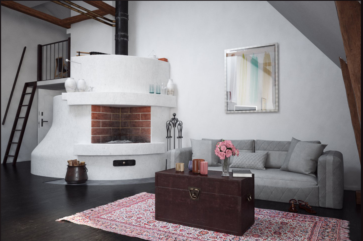
scene 10 cam 02

Have you ever wanted to make professional interior renderings? Do you know how to use V-RaySun, V-RaySky and V-RayPhysicalCamera? Have you ever had problems with composition? Archinteriors will end all your problems. Take a look at this 10 fully textured scenes with professional shaders and lighting ready to render. Get your own portfolio and join cg market.