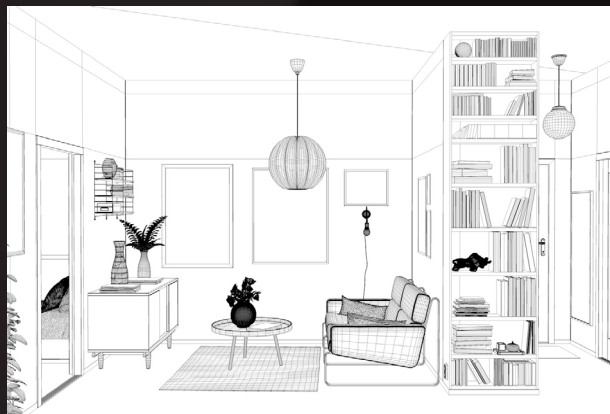
scene 06 cam 02 wire

Software and models © 2019 EVERMOTION. EVERMOTION logo is trademark or registered trademark of Evermotion Inc. in the U.S. and/or other countries. All rights reserved. All *.c4d and bitmaps models included on this collection with data are an integral part of „archinteriors vol.45 C4D” and the resale of this data is strictly prohibited. All models can be used for commercial purposes only by owners who bought this collection. The sharing of collection is strictly prohibited unless that user has written authorization from EVERMOTION.