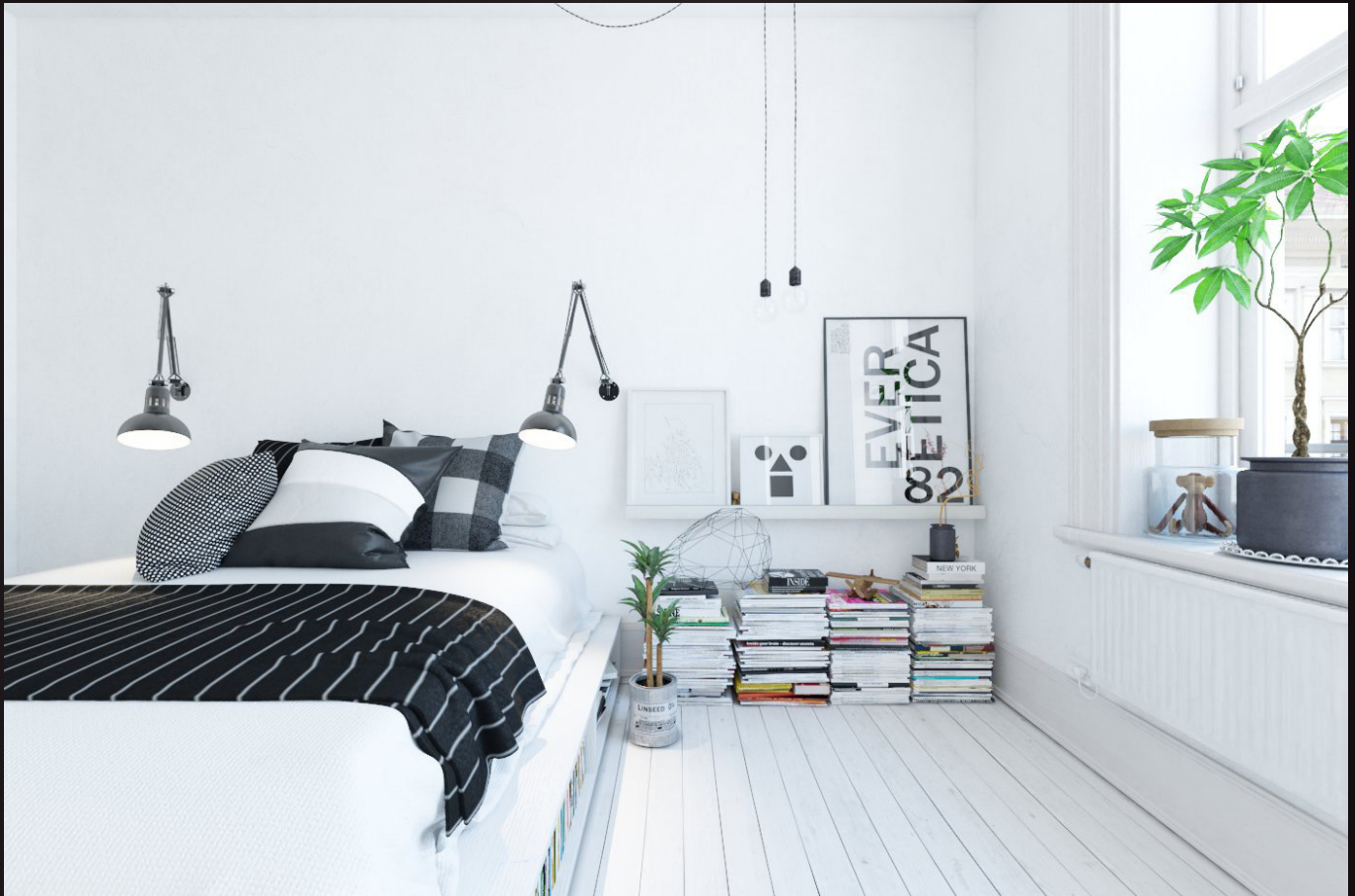
scene 04 cam 02

Have you ever wanted to make professional interior renderings? Do you know how to use V-RaySun, V-RaySky and V-RayPhysicalCamera? Have you ever had problems with composition? Archinteriors will end all your problems. Take a look at this 10 fully textured scenes with professional shaders and lighting ready to render. Get your own portfolio and join cg market.