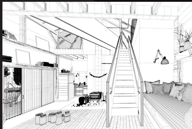
scene 09 cam 01 wire

Software and models © 2019 EVERMOTION. EVERMOTION logo is trademark or registered trademark of Evermotion Inc. in the U.S. and/or other countries. All rights reserved. All *.c4d and bitmaps models included on this collection with data are an integral part of „archinteriors vol.45 C4D” and the resale of this data is strictly prohibited. All models can be used for commercial purposes only by owners who bought this collection. The sharing of collection is strictly prohibited unless that user has written authorization from EVERMOTION.