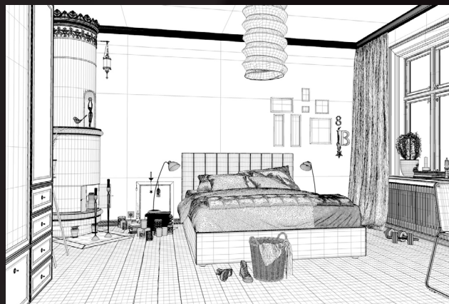
scene 01 cam 01 wire

Software and models © 2019 EVERMOTION. EVERMOTION logo is trademark or registered trademark of Evermotion Inc. in the U.S. and/or other countries. All rights reserved. All *.c4d and bitmaps models included on this collection with data are an integral part of „archinteriors vol.45 C4D” and the resale of this data is strictly prohibited. All models can be used for commercial purposes only by owners who bought this collection. The sharing of collection is strictly prohibited unless that user has written authorization from EVERMOTION.