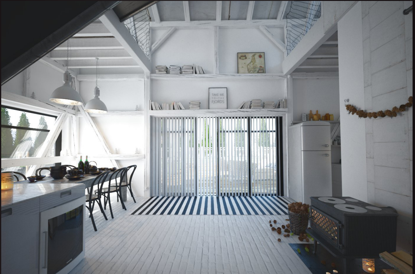
scene 09 cam 02

Have you ever wanted to make professional interior renderings? Do you know how to use V-RaySun, V-RaySky and V-RayPhysicalCamera? Have you ever had problems with composition? Archinteriors will end all your problems. Take a look at this 10 fully textured scenes with professional shaders and lighting ready to render. Get your own portfolio and join cg market.