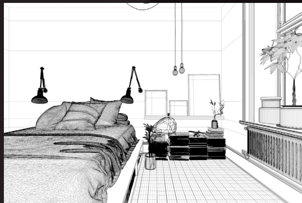
scene 04 cam 02 wire

Software and models © 2019 EVERMOTION. EVERMOTION logo is trademark or registered trademark of Evermotion Inc. in the U.S. and/or other countries. All rights reserved. All *.c4d and bitmaps models included on this collection with data are an integral part of „archinteriors vol.45 C4D” and the resale of this data is strictly prohibited. All models can be used for commercial purposes only by owners who bought this collection. The sharing of collection is strictly prohibited unless that user has written authorization from EVERMOTION.