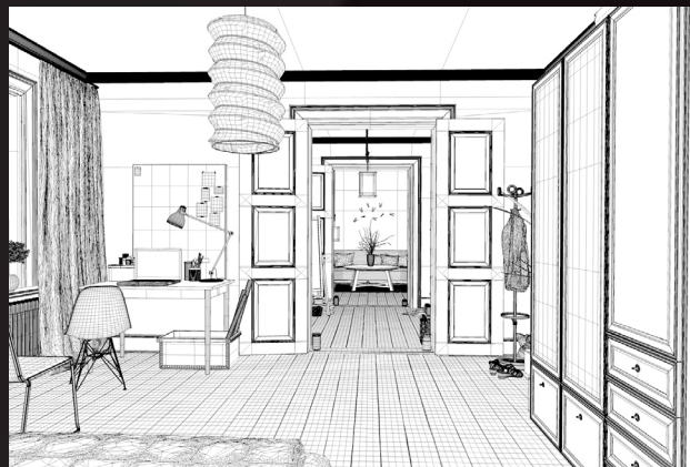
scene 01 cam 02 wire

Software and models © 2019 EVERMOTION. EVERMOTION logo is trademark or registered trademark of Evermotion Inc. in the U.S. and/or other countries. All rights reserved. All *.c4d and bitmaps models included on this collection with data are an integral part of „archinteriors vol.45 C4D” and the resale of this data is strictly prohibited. All models can be used for commercial purposes only by owners who bought this collection. The sharing of collection is strictly prohibited unless that user has written authorization from EVERMOTION.