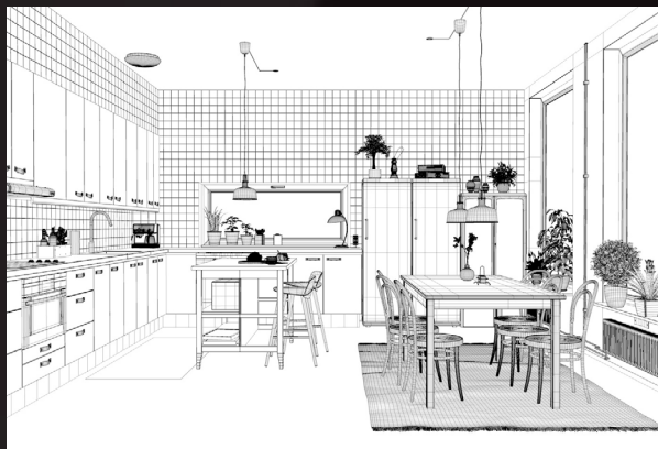
scene 06 cam 01 wire

Software and models © 2019 EVERMOTION. EVERMOTION logo is trademark or registered trademark of Evermotion Inc. in the U.S. and/or other countries. All rights reserved. All *.c4d and bitmaps models included on this collection with data are an integral part of „archinteriors vol.45 C4D” and the resale of this data is strictly prohibited. All models can be used for commercial purposes only by owners who bought this collection. The sharing of collection is strictly prohibited unless that user has written authorization from EVERMOTION.