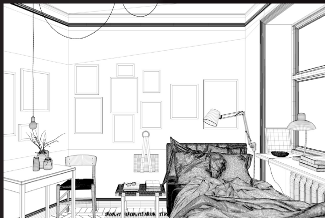
scene 03 cam 01 wire

Software and models © 2019 EVERMOTION. EVERMOTION logo is trademark or registered trademark of Evermotion Inc. in the U.S. and/or other countries. All rights reserved. All *.c4d and bitmaps models included on this collection with data are an integral part of „archinteriors vol.45 C4D” and the resale of this data is strictly prohibited. All models can be used for commercial purposes only by owners who bought this collection. The sharing of collection is strictly prohibited unless that user has written authorization from EVERMOTION.