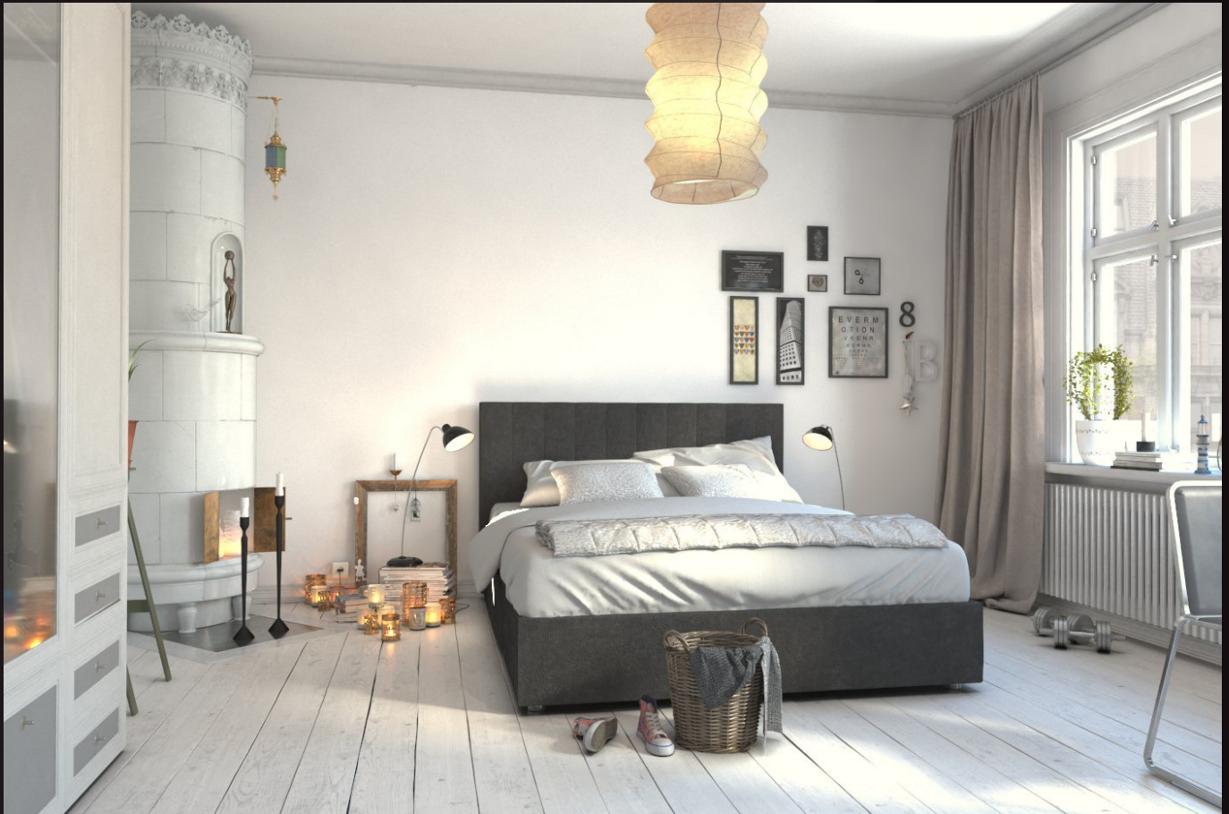
scene 01 cam 01

Have you ever wanted to make professional interior renderings? Do you know how to use V-RaySun, V-RaySky and V-RayPhysicalCamera? Have you ever had problems with composition? Archinteriors will end all your problems. Take a look at this 10 fully textured scenes with professional shaders and lighting ready to render. Get your own portfolio and join cg market.