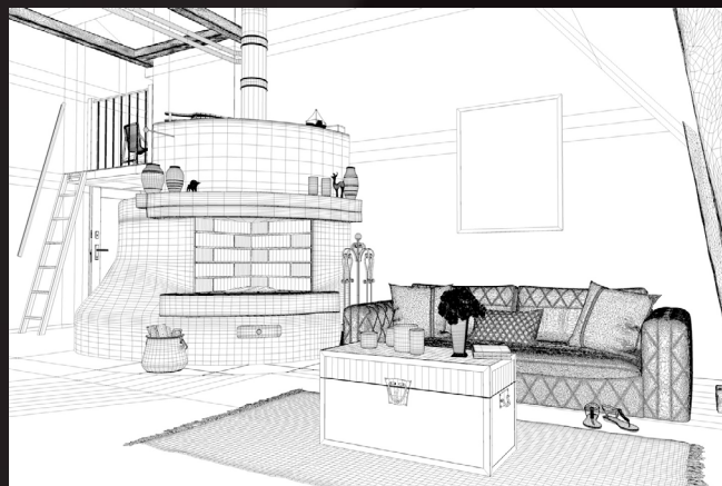
scene 10 cam 02 wire

Software and models © 2019 EVERMOTION. EVERMOTION logo is trademark or registered trademark of Evermotion Inc. in the U.S. and/or other countries. All rights reserved. All *.c4d and bitmaps models included on this collection with data are an integral part of „archinteriors vol.45 C4D” and the resale of this data is strictly prohibited. All models can be used for commercial purposes only by owners who bought this collection. The sharing of collection is strictly prohibited unless that user has written authorization from EVERMOTION.