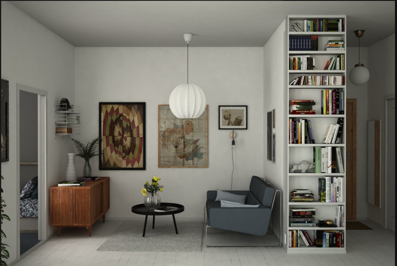
scene 06 cam 02

Have you ever wanted to make professional interior renderings? Do you know how to use V-RaySun, V-RaySky and V-RayPhysicalCamera? Have you ever had problems with composition? Archinteriors will end all your problems. Take a look at this 10 fully textured scenes with professional shaders and lighting ready to render. Get your own portfolio and join cg market.