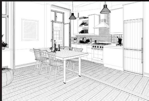
scene 05 cam 01 wire

Software and models © 2019 EVERMOTION. EVERMOTION logo is trademark or registered trademark of Evermotion Inc. in the U.S. and/or other countries. All rights reserved. All *.c4d and bitmaps models included on this collection with data are an integral part of „archinteriors vol.45 C4D” and the resale of this data is strictly prohibited. All models can be used for commercial purposes only by owners who bought this collection. The sharing of collection is strictly prohibited unless that user has written authorization from EVERMOTION.