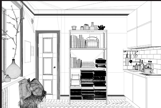
scene 03 cam 02 wire

Software and models © 2019 EVERMOTION. EVERMOTION logo is trademark or registered trademark of Evermotion Inc. in the U.S. and/or other countries. All rights reserved. All *.c4d and bitmaps models included on this collection with data are an integral part of „archinteriors vol.45 C4D” and the resale of this data is strictly prohibited. All models can be used for commercial purposes only by owners who bought this collection. The sharing of collection is strictly prohibited unless that user has written authorization from EVERMOTION.