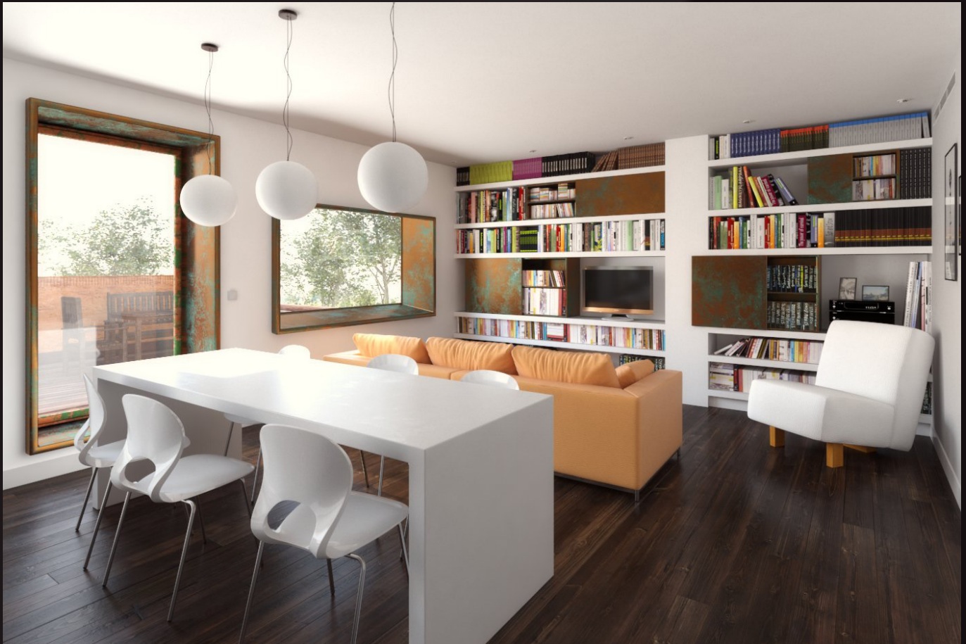
scene 02 cam 01

Have you ever wanted to make professional interior renderings? Do you know how to use V-RaySun, V-RaySky and V-RayPhysicalCamera? Have you ever had problems with composition? Archinteriors will end all your problems. Take a look at this 10 fully textured scenes with professional shaders and lighting ready to render. Get your own portfolio and join cg market.