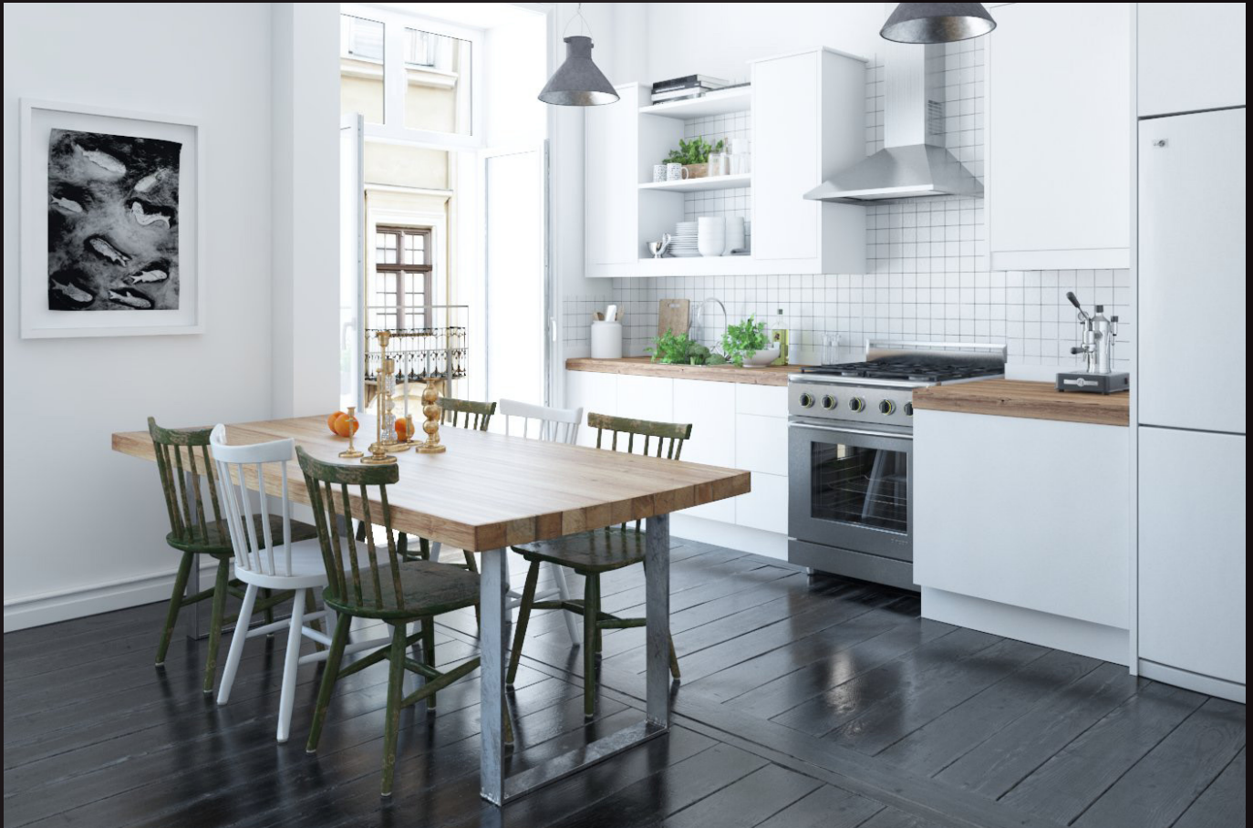
scene 05 cam 01

Have you ever wanted to make professional interior renderings? Do you know how to use V-RaySun, V-RaySky and V-RayPhysicalCamera? Have you ever had problems with composition? Archinteriors will end all your problems. Take a look at this 10 fully textured scenes with professional shaders and lighting ready to render. Get your own portfolio and join cg market.