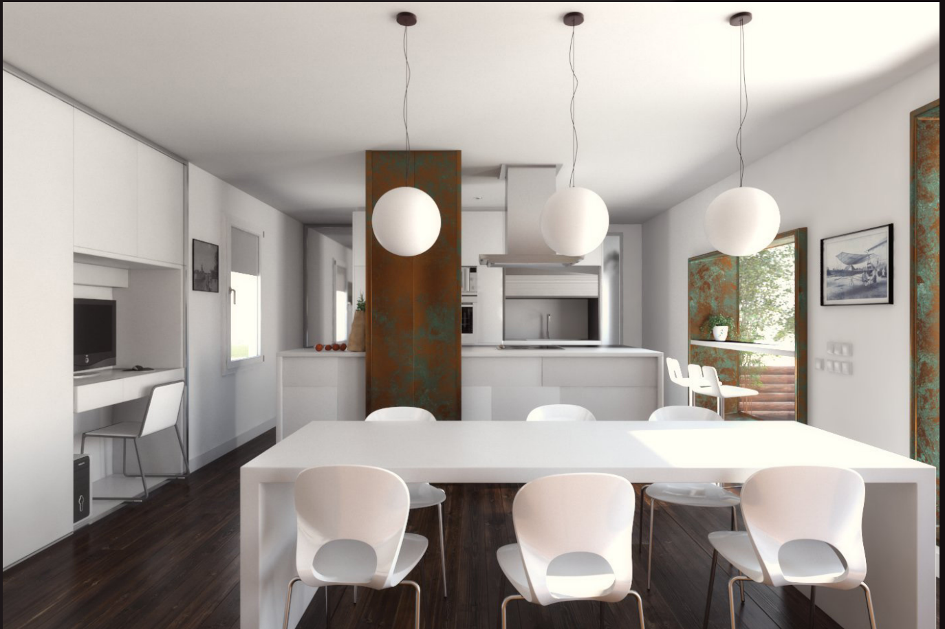
scene 02 cam 02

Have you ever wanted to make professional interior renderings? Do you know how to use V-RaySun, V-RaySky and V-RayPhysicalCamera? Have you ever had problems with composition? Archinteriors will end all your problems. Take a look at this 10 fully textured scenes with professional shaders and lighting ready to render. Get your own portfolio and join cg market.