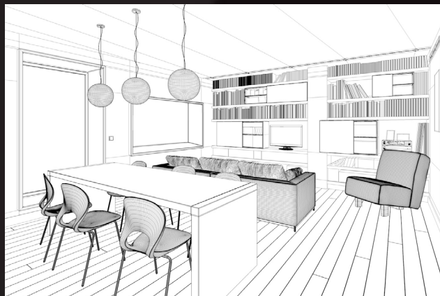
scene 02 cam 01 wire

Software and models © 2019 EVERMOTION. EVERMOTION logo is trademark or registered trademark of Evermotion Inc. in the U.S. and/or other countries. All rights reserved. All *.c4d and bitmaps models included on this collection with data are an integral part of „archinteriors vol.45 C4D” and the resale of this data is strictly prohibited. All models can be used for commercial purposes only by owners who bought this collection. The sharing of collection is strictly prohibited unless that user has written authorization from EVERMOTION.