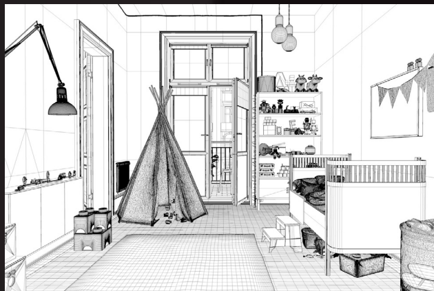
scene 04 cam 01 wire

Software and models © 2019 EVERMOTION. EVERMOTION logo is trademark or registered trademark of Evermotion Inc. in the U.S. and/or other countries. All rights reserved. All *.c4d and bitmaps models included on this collection with data are an integral part of „archinteriors vol.45 C4D” and the resale of this data is strictly prohibited. All models can be used for commercial purposes only by owners who bought this collection. The sharing of collection is strictly prohibited unless that user has written authorization from EVERMOTION.