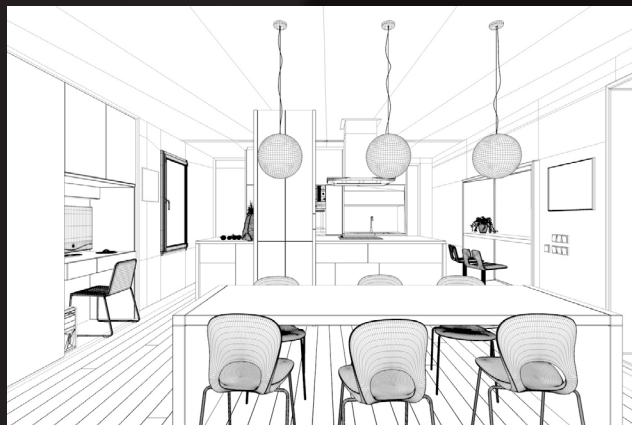
scene 02 cam 02 wire

Software and models © 2019 EVERMOTION. EVERMOTION logo is trademark or registered trademark of Evermotion Inc. in the U.S. and/or other countries. All rights reserved. All *.c4d and bitmaps models included on this collection with data are an integral part of „archinteriors vol.45 C4D” and the resale of this data is strictly prohibited. All models can be used for commercial purposes only by owners who bought this collection. The sharing of collection is strictly prohibited unless that user has written authorization from EVERMOTION.