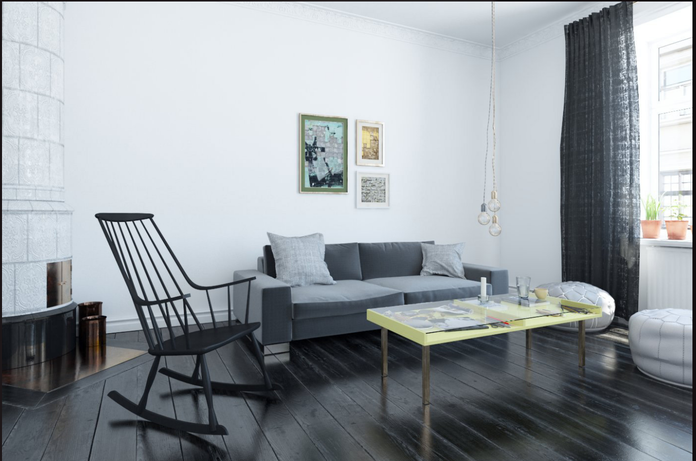
scene 05 cam 02

Have you ever wanted to make professional interior renderings? Do you know how to use V-RaySun, V-RaySky and V-RayPhysicalCamera? Have you ever had problems with composition? Archinteriors will end all your problems. Take a look at this 10 fully textured scenes with professional shaders and lighting ready to render. Get your own portfolio and join cg market.