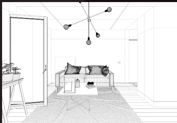
scene 07 cam 02 wire

Software and models © 2019 EVERMOTION. EVERMOTION logo is trademark or registered trademark of Evermotion Inc. in the U.S. and/or other countries. All rights reserved. All *.c4d and bitmaps models included on this collection with data are an integral part of „archinteriors vol.45 C4D” and the resale of this data is strictly prohibited. All models can be used for commercial purposes only by owners who bought this collection. The sharing of collection is strictly prohibited unless that user has written authorization from EVERMOTION.