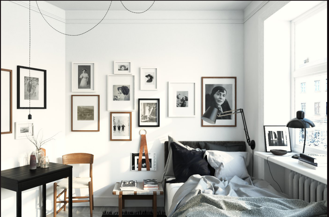
scene 03 cam 01

Have you ever wanted to make professional interior renderings? Do you know how to use V-RaySun, V-RaySky and V-RayPhysicalCamera? Have you ever had problems with composition? Archinteriors will end all your problems. Take a look at this 10 fully textured scenes with professional shaders and lighting ready to render. Get your own portfolio and join cg market.