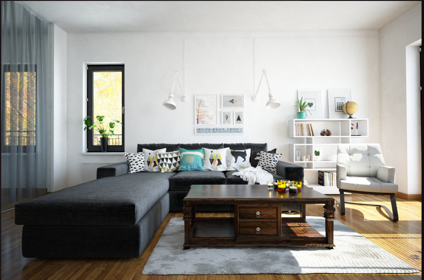
scene 08 cam 02

Have you ever wanted to make professional interior renderings? Do you know how to use V-RaySun, V-RaySky and V-RayPhysicalCamera? Have you ever had problems with composition? Archinteriors will end all your problems. Take a look at this 10 fully textured scenes with professional shaders and lighting ready to render. Get your own portfolio and join cg market.