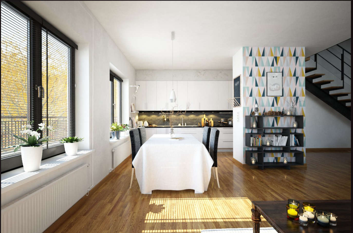
scene 08 cam 01

Have you ever wanted to make professional interior renderings? Do you know how to use V-RaySun, V-RaySky and V-RayPhysicalCamera? Have you ever had problems with composition? Archinteriors will end all your problems. Take a look at this 10 fully textured scenes with professional shaders and lighting ready to render. Get your own portfolio and join cg market.