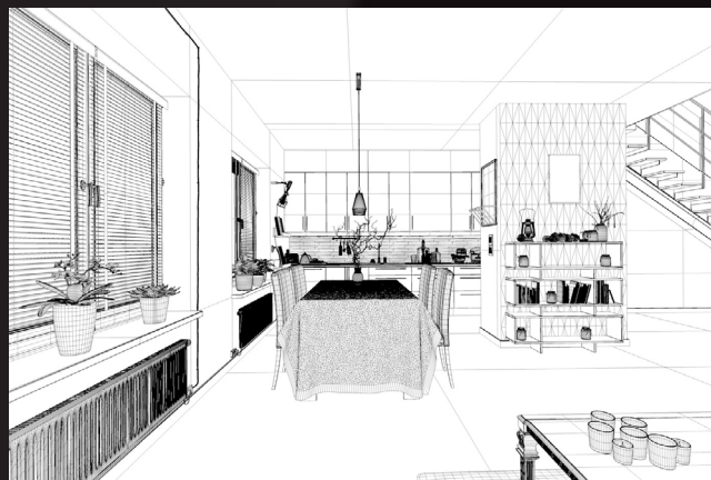
scene 08 cam 01 wire

Software and models © 2019 EVERMOTION. EVERMOTION logo is trademark or registered trademark of Evermotion Inc. in the U.S. and/or other countries. All rights reserved. All *.c4d and bitmaps models included on this collection with data are an integral part of „archinteriors vol.45 C4D” and the resale of this data is strictly prohibited. All models can be used for commercial purposes only by owners who bought this collection. The sharing of collection is strictly prohibited unless that user has written authorization from EVERMOTION.