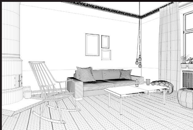
scene 05 cam 02 wire

Software and models © 2019 EVERMOTION. EVERMOTION logo is trademark or registered trademark of Evermotion Inc. in the U.S. and/or other countries. All rights reserved. All *.c4d and bitmaps models included on this collection with data are an integral part of „archinteriors vol.45 C4D” and the resale of this data is strictly prohibited. All models can be used for commercial purposes only by owners who bought this collection. The sharing of collection is strictly prohibited unless that user has written authorization from EVERMOTION.