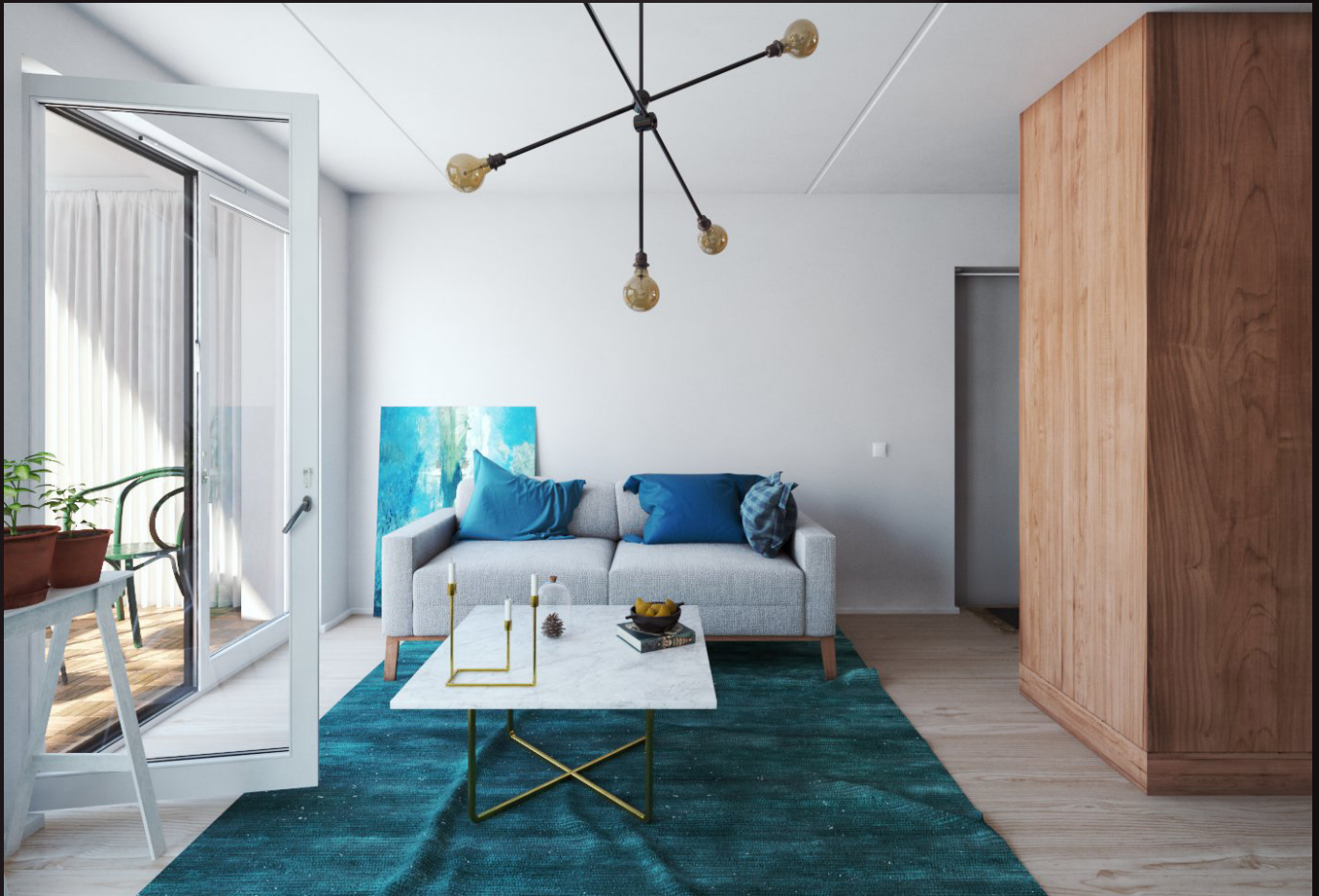
scene 07 cam 02

Have you ever wanted to make professional interior renderings? Do you know how to use V-RaySun, V-RaySky and V-RayPhysicalCamera? Have you ever had problems with composition? Archinteriors will end all your problems. Take a look at this 10 fully textured scenes with professional shaders and lighting ready to render. Get your own portfolio and join cg market.