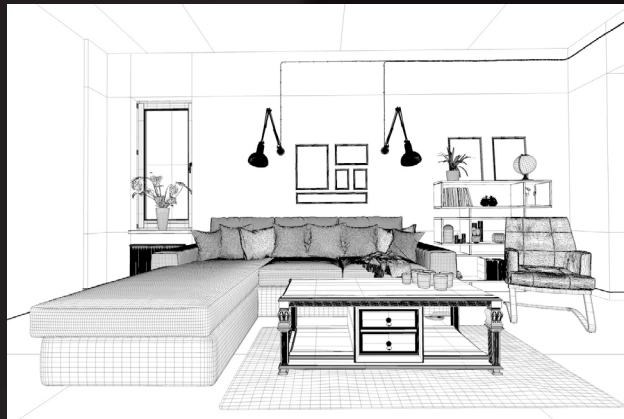
scene 08 cam 02 wire

Software and models © 2019 EVERMOTION. EVERMOTION logo is trademark or registered trademark of Evermotion Inc. in the U.S. and/or other countries. All rights reserved. All *.c4d and bitmaps models included on this collection with data are an integral part of „archinteriors vol.45 C4D” and the resale of this data is strictly prohibited. All models can be used for commercial purposes only by owners who bought this collection. The sharing of collection is strictly prohibited unless that user has written authorization from EVERMOTION.