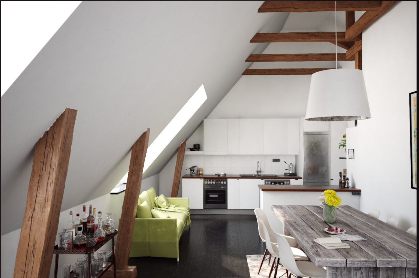
scene 10 cam 01

Have you ever wanted to make professional interior renderings? Do you know how to use V-RaySun, V-RaySky and V-RayPhysicalCamera? Have you ever had problems with composition? Archinteriors will end all your problems. Take a look at this 10 fully textured scenes with professional shaders and lighting ready to render. Get your own portfolio and join cg market.