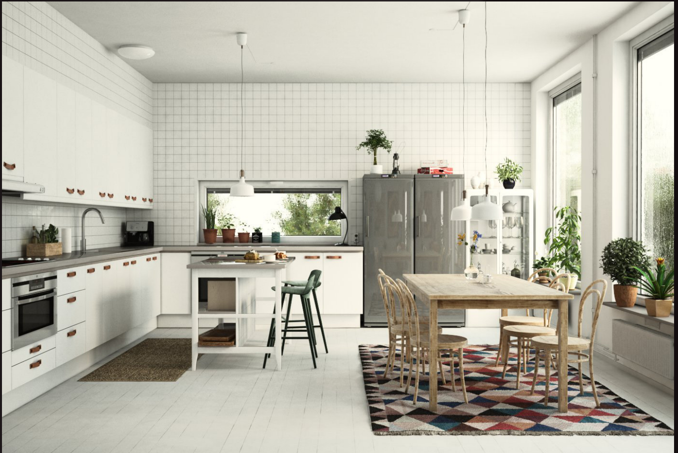
scene 06 cam 01

Have you ever wanted to make professional interior renderings? Do you know how to use V-RaySun, V-RaySky and V-RayPhysicalCamera? Have you ever had problems with composition? Archinteriors will end all your problems. Take a look at this 10 fully textured scenes with professional shaders and lighting ready to render. Get your own portfolio and join cg market.