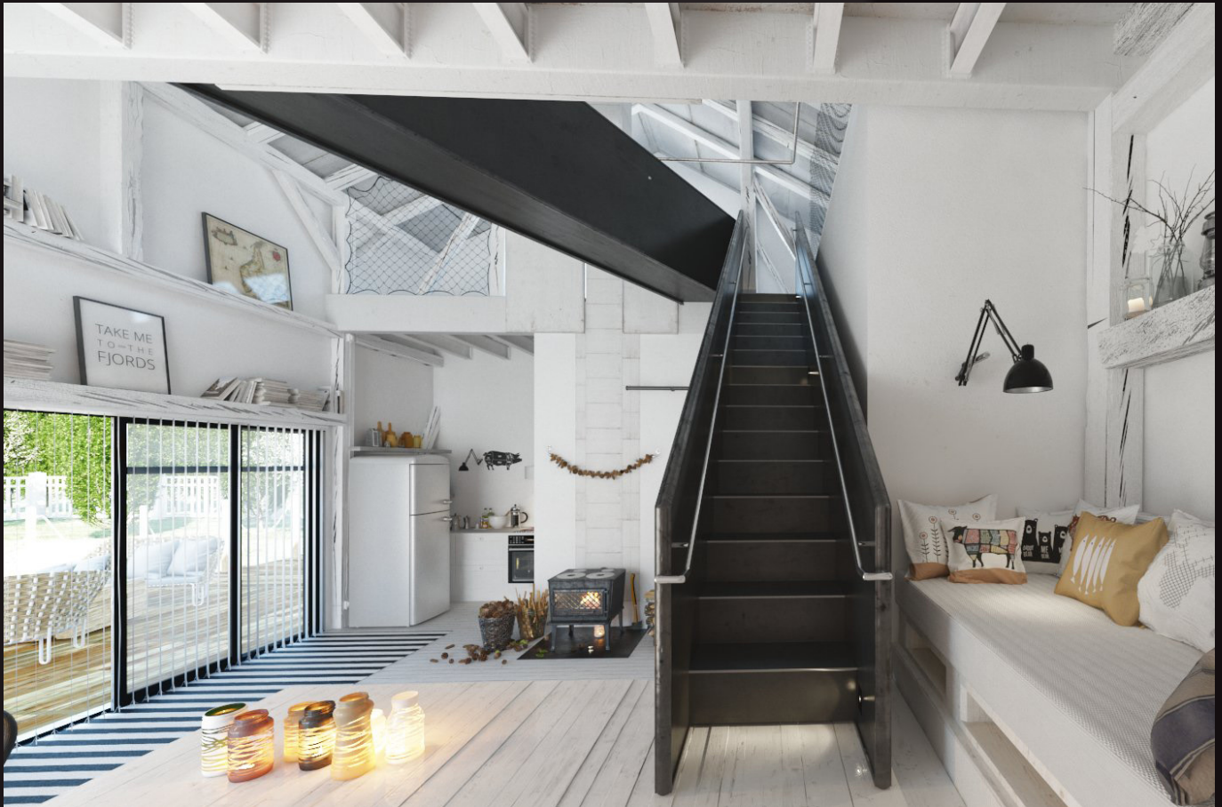
scene 09 cam 01

Have you ever wanted to make professional interior renderings? Do you know how to use V-RaySun, V-RaySky and V-RayPhysicalCamera? Have you ever had problems with composition? Archinteriors will end all your problems. Take a look at this 10 fully textured scenes with professional shaders and lighting ready to render. Get your own portfolio and join cg market.