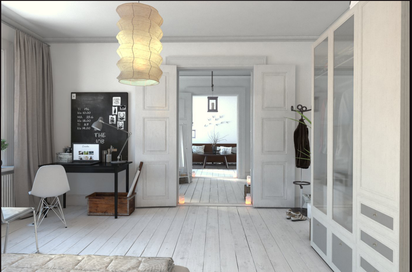
scene 01 cam 02

Have you ever wanted to make professional interior renderings? Do you know how to use V-RaySun, V-RaySky and V-RayPhysicalCamera? Have you ever had problems with composition? Archinteriors will end all your problems. Take a look at this 10 fully textured scenes with professional shaders and lighting ready to render. Get your own portfolio and join cg market.