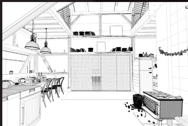
scene 09 cam 02 wire

Software and models © 2019 EVERMOTION. EVERMOTION logo is trademark or registered trademark of Evermotion Inc. in the U.S. and/or other countries. All rights reserved. All *.c4d and bitmaps models included on this collection with data are an integral part of „archinteriors vol.45 C4D” and the resale of this data is strictly prohibited. All models can be used for commercial purposes only by owners who bought this collection. The sharing of collection is strictly prohibited unless that user has written authorization from EVERMOTION.