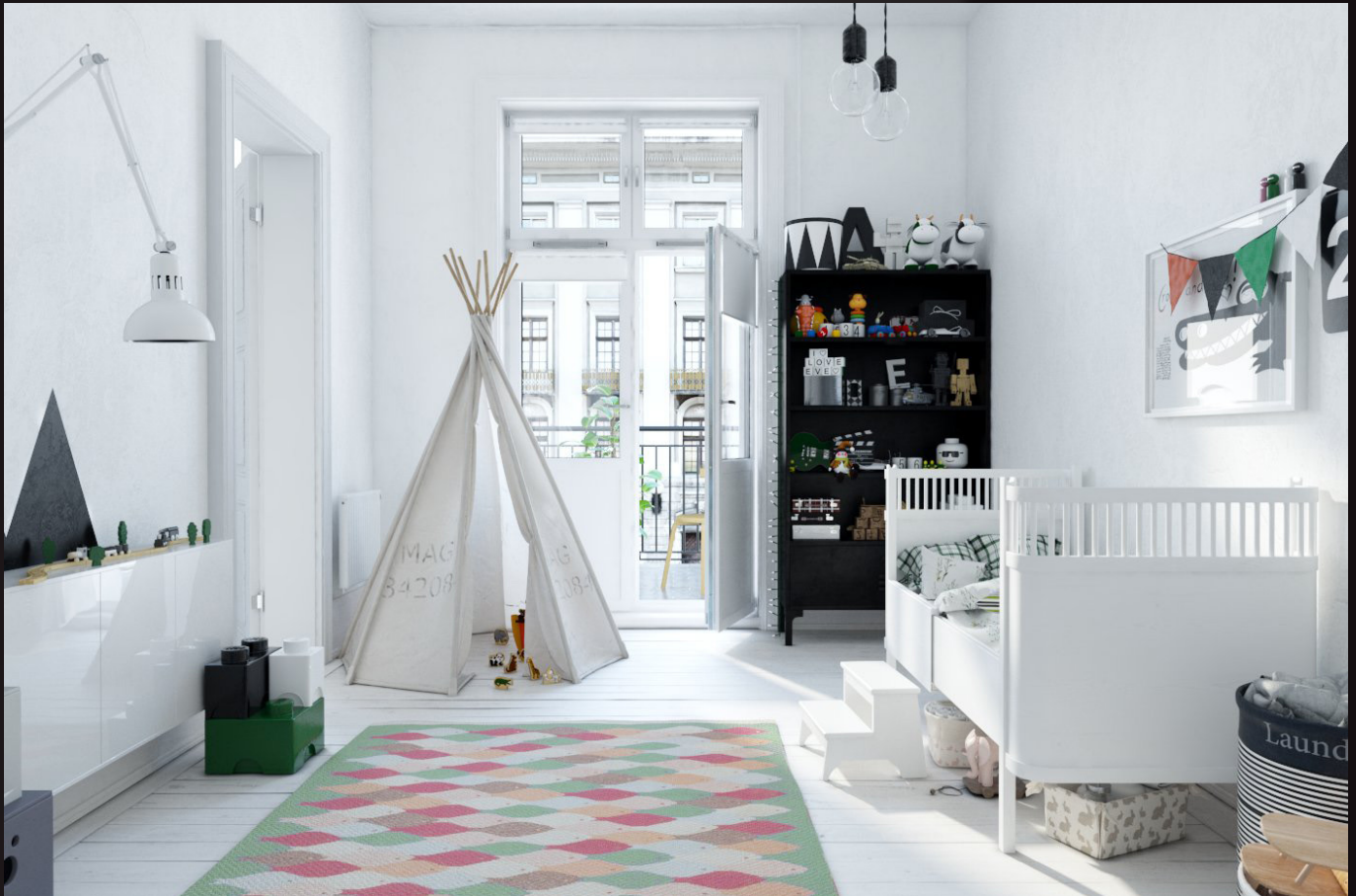
scene 04 cam 01

Have you ever wanted to make professional interior renderings? Do you know how to use V-RaySun, V-RaySky and V-RayPhysicalCamera? Have you ever had problems with composition? Archinteriors will end all your problems. Take a look at this 10 fully textured scenes with professional shaders and lighting ready to render. Get your own portfolio and join cg market.