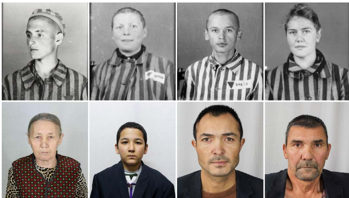
On the top row, concentration camp prisoners during the Holocaust. On bottom, captive Uyghurs in China. (Photos: Auschwitz Memorial Museum, Victims of Communism Memorial Foundation; Design: Jake Wasserman)