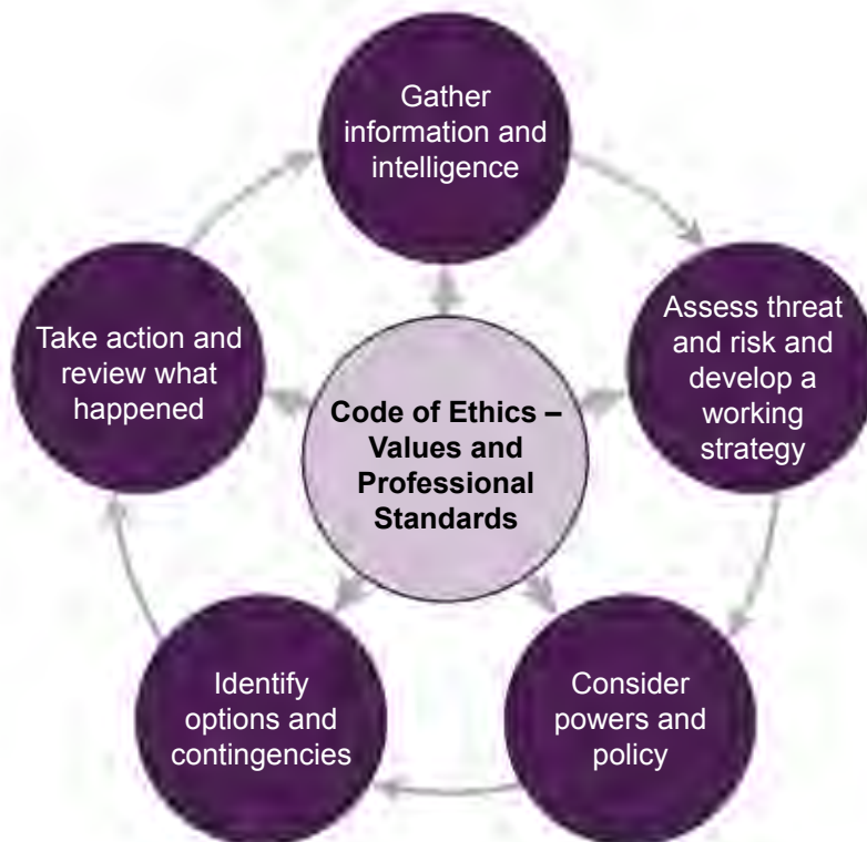
Figure 1: National Decision Model for policing