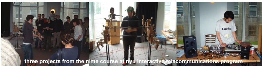
three projects from the nime course at nyu interactive telecommunications program