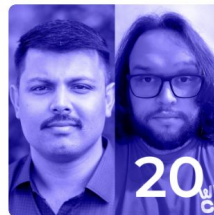
EPISODE 20: THE GLOBAL MAJORITY SPEAKS OUT ON TECH!