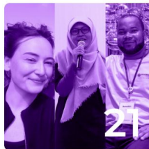
EPISODE 21: BUILDING CAPACITY FOR TECH DEVELOPMENT