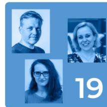
EPISODE 19: CHARTING THE MOVEMENT CHARTER