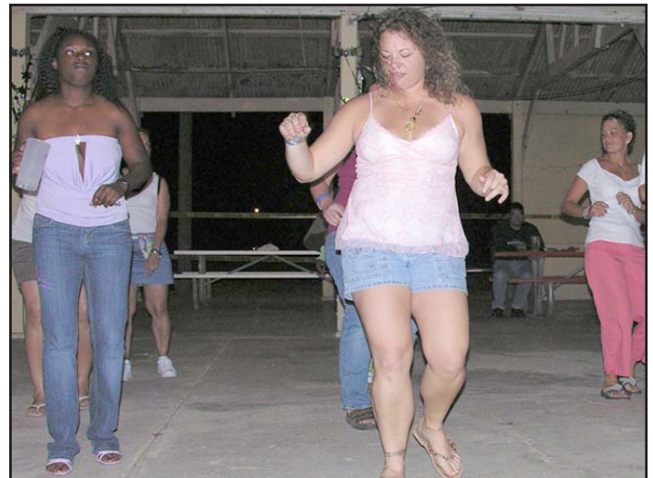
Line-dancing was a big favorite at the 'Bash.'

For more information on the Navy Ball or to volunteer to be on one of the internal committees, call 77633 or 4721.