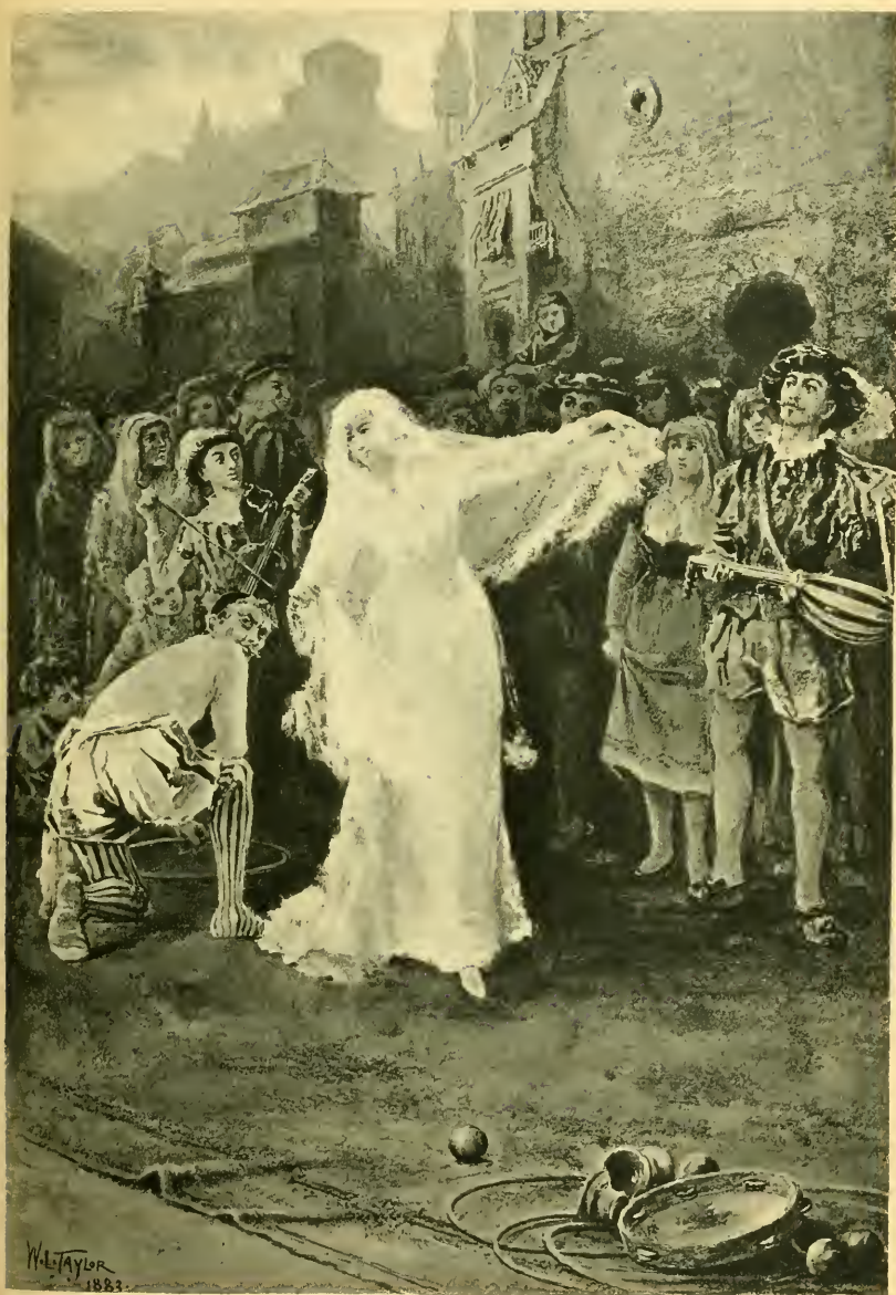
A figure litho