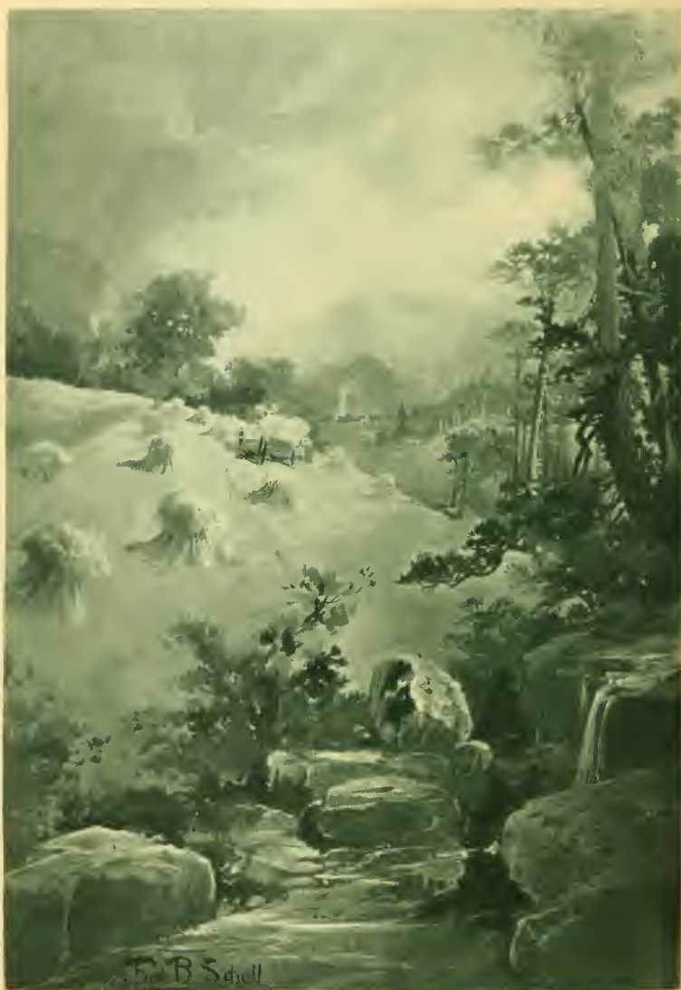
To the mountains