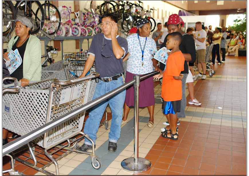
NEX patrons patiently wait in line for the store to open Nov. 3.

Store patrons were able to take advantage