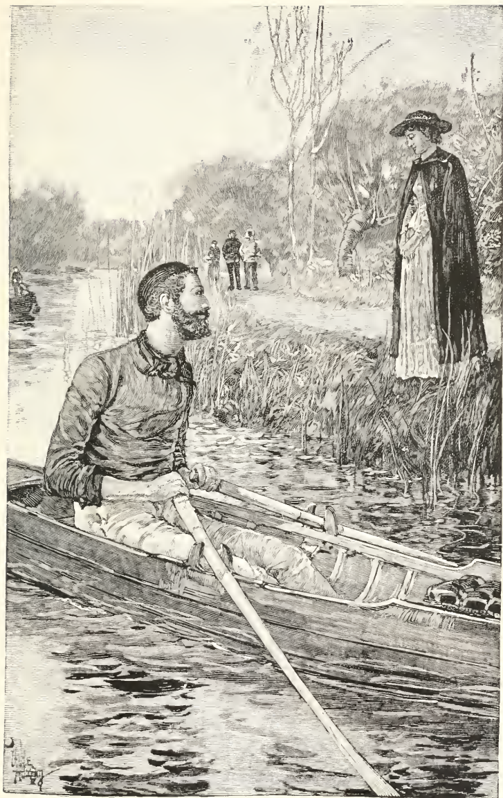
DERONDA MEETS MIRAH ON THE BANKS OF THE THAMES.