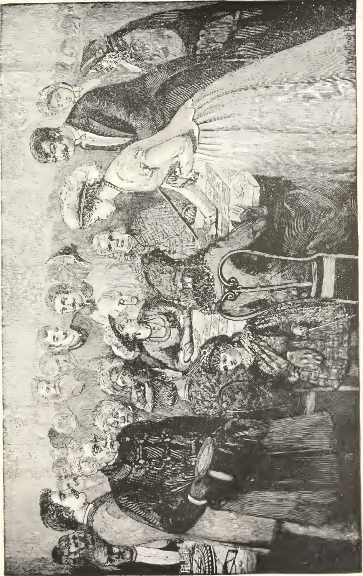
GWENDOLEN AT THE GAMING-TABLE.