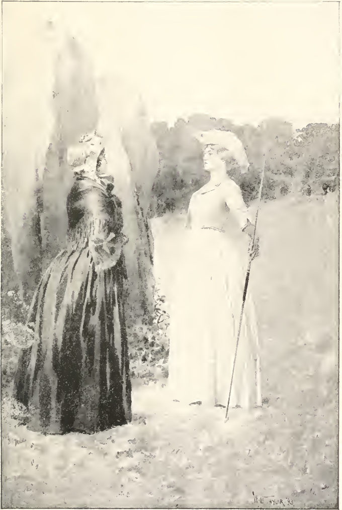
LYDIA GLASHER AND GWENDOLEN AT THE WHISPERING STONES.