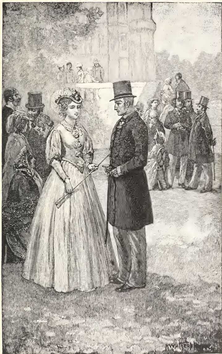
GRANDCOURT AND GWENDOLEN AT THE ARCHERY TOURNAMENT.