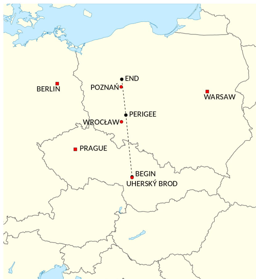
Figure 2 | Part of the track of the meteoroid above Czechoslovakia and Poland that was captured by European Fireball Network cameras.

The software also calculated the fireball's instantaneous apparent magnitude at the ground. The computation started and ended with heights of approximately 250 km, long before and after the cameras of the European Fireball Network could observe it. Its apparent magnitude started at a value of +5.7 and it became brighter quite quickly. The program gave an apparent magnitude of -5.7 when it was seen by one camera and -6.3 at perigee. The fireball subsequently dimmed, with an apparent magnitude of -5.4 when it was last seen by the cameras and a final calculated value of +6.0 at a height of 257 km. These values are not entirely certain,