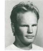
Donald Jamison Maintenance Seminary