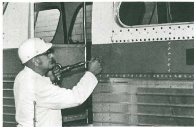
RIVETS OUT —Worker pulls last rivets to allow outside panel to be removed.