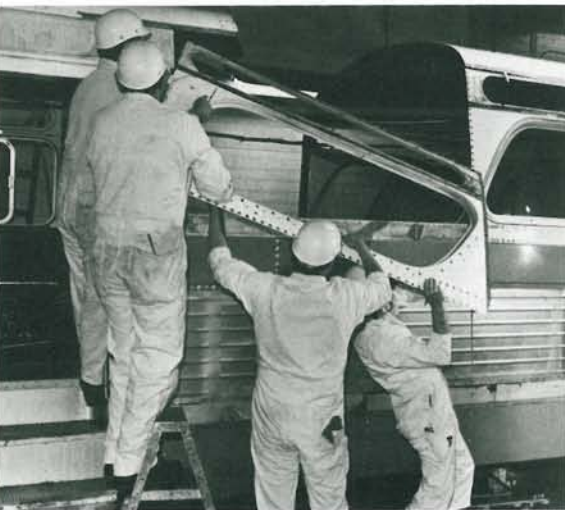
EASY DOES IT —Window frame section is lifted out as dismantling continues.