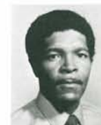
Leon Pryor Transportation Seminary