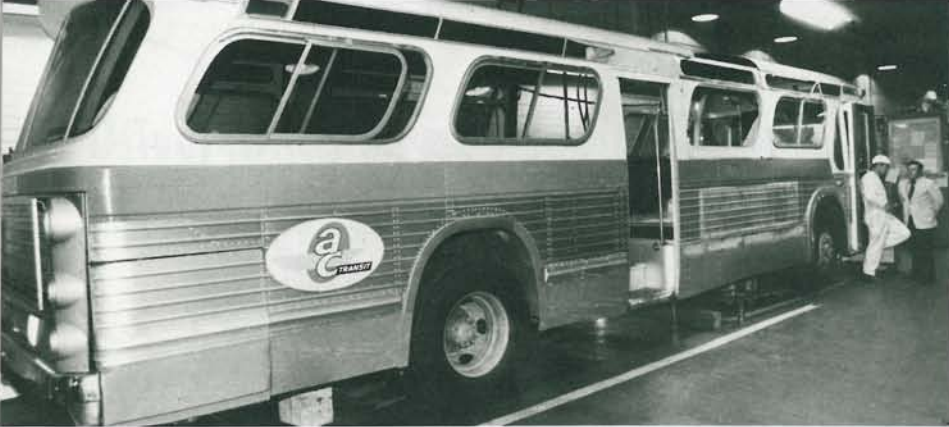
READY FOR SURGERY —With seats removed and roof and floor paneling already cut away, bus No. 708 awaits the next move—removal of a section between front wheels and rear door. At this point, the bus still is 35 feet long.