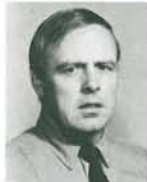
James Stewart Transportation Emeryville