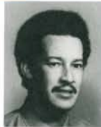
Billy Green Transportation Emeryville