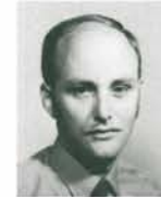
Donald Militello Transportation Seminary