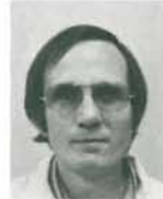
Ormond Seavey Stores Emeryville