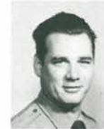
W. McGuinness Transportation Seminary