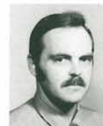
Jack Patterson Transportation Seminary