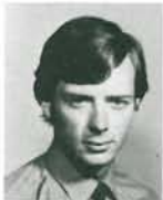
Danny Hitchcock Transportation Seminary