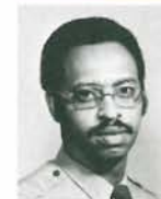
Ronald Kelly Transportation Richmond