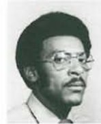
Esque Martin Transportation Emeryville