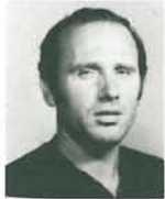
E. Sgouros Maintenance Seminary