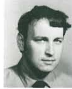
Paul DeMarco Transportation Seminary