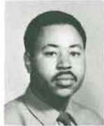
Ernest Shilah Transportation Seminary