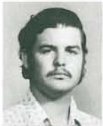
Charles Stafford Maintenance Seminary