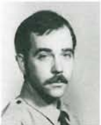
Michael Hearing Transportation Seminary