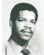
Timothy Sowell Transportation Seminary