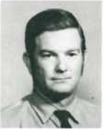
Vernon Faver Transportation Richmond