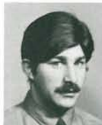
Irwin Huebsch Transportation Seminary