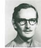
Joseph Johnson Transportation Emeryville