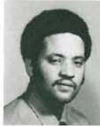
Preston Chenault Transportation Emeryville