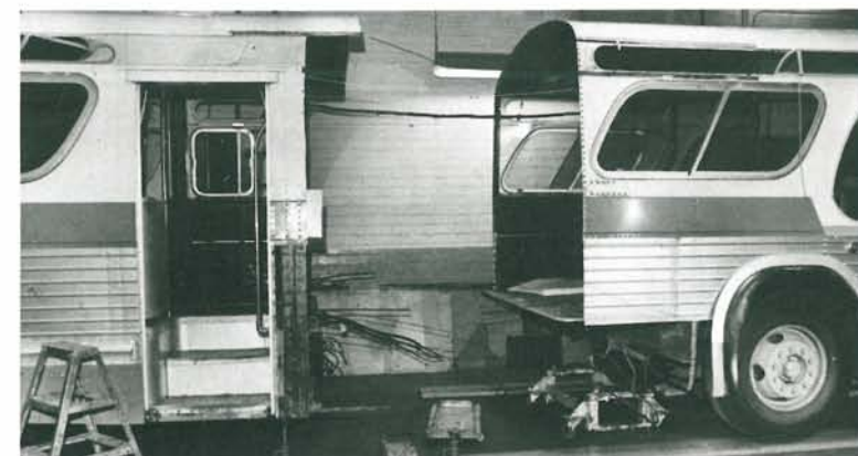
CUT-AWAY —The two sections of the bus now are ready to be rejoined. When the connection is completed, the interior will be refurbished with floor and ceiling carpeting and wood-grained melamine paneling.