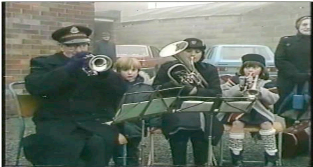
Figure 7 Christmas in Goldthorpe