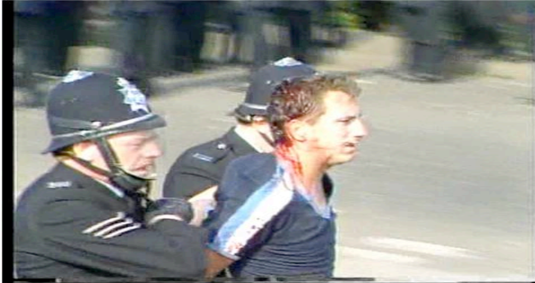
Figure 6 Arrest at Orgreave

This appendix contains an edited selection of comments drawn from focus groups and questionnaires produced during the initial study. They have been organised into four sections which correspond directly to the first four research questions. They are intended to provide an indicative impression of the range of comments and opinions expressed in our field work and to allow readers to relate to the material we drew on in the preparation of this report.