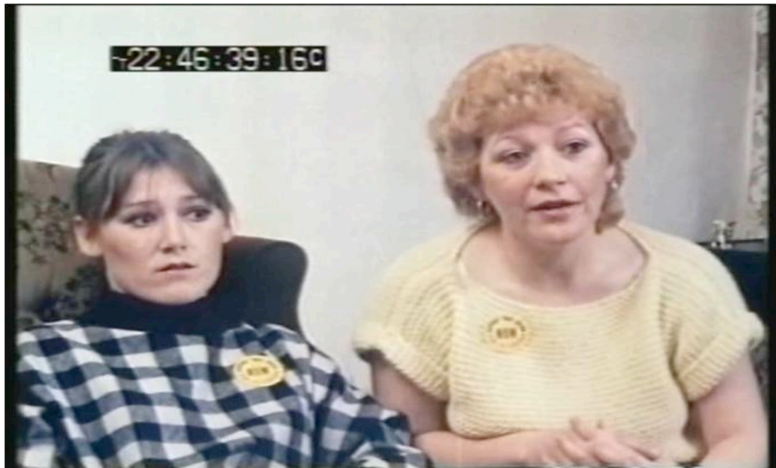
Figure 5 Miners' wives discuss the strike

And the women that supported us, who did the kitchens in our communities, did tremendous jobs with very little uh equipment to work with and they provided meals for the children and for the lads who went picketing and I think that should go down in the annals of the history of our dispute. – Miner: focus group, 2008