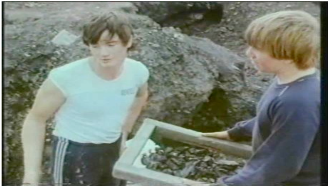
Figure 8 Scavenging for coal