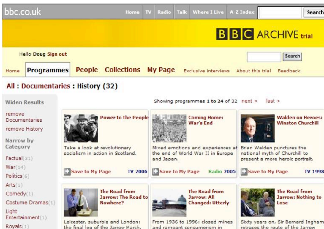
Figure 1 BBC Archive trial Interface

programmers. Central to this study was a desire to explore the relationships between various stakeholders, between content providers (BBC archives) and a range of public and broadcast audiences. At a time when the BBC is developing new approaches to disseminating archival resources, and engaging with new audiences via a range of digital initiatives and archival supported programmes, the study is extremely timely. The core of the project was designed to look at how the BBC's regional public audiences might interact with 'sensitive' archival sources, in what sense they could access and utilise these materials as part of their own memories of historical events, what issues and problems might arise, and ultimately how these findings could be used to inform future archival activities, digital accession, academic practice and drive programming. Over the 12 months that the project was 'live' many exciting developments took place which both informed our research and began to determine the direction it took.