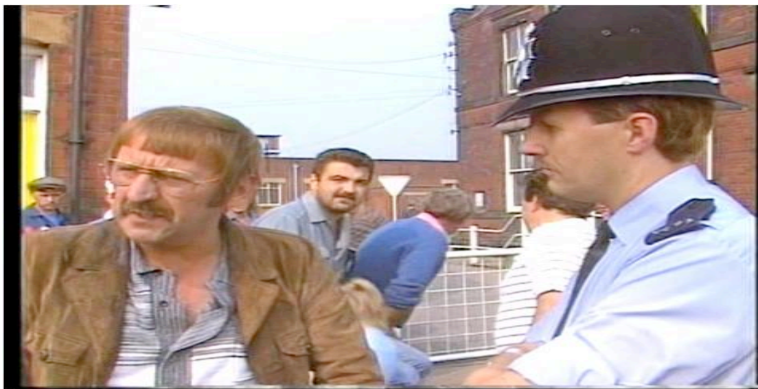
Figure 9 Community policing during the strike