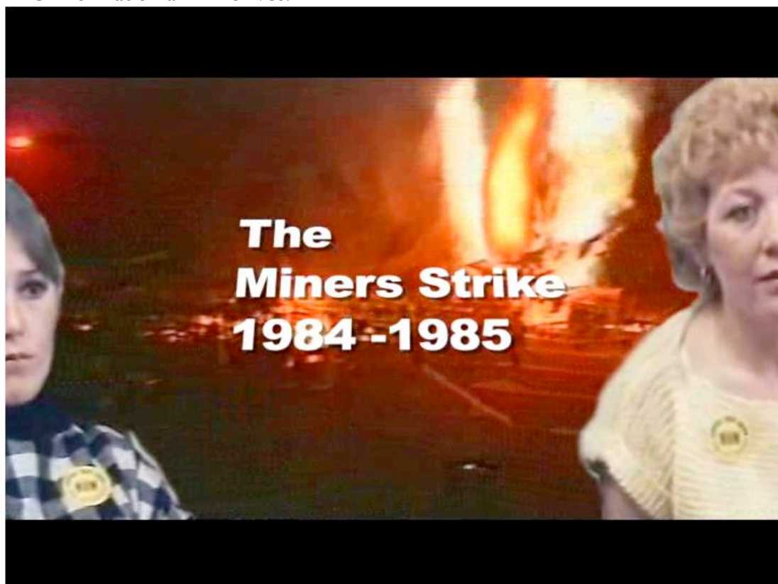
Figure 3 Project film titles

To answer our primary questions we worked with groups of miners, police officers and people directly involved in or affected by the strike. The team used BBC materials as the basis for a series of 12 extended focus groups, interviews and follow-up questionnaires which explored the potential of archival material as sources of media and communications history, memory and education. We decided that a qualitative approach based on interviews, discussions and questionnaires would enable us to explore key themes in-depth and allow participants to fully respond to our questions and engage with a selection of archival materials. As part of the focus groups we produced a compilation film of BBC news items with the full support of BBC Information and Archives.