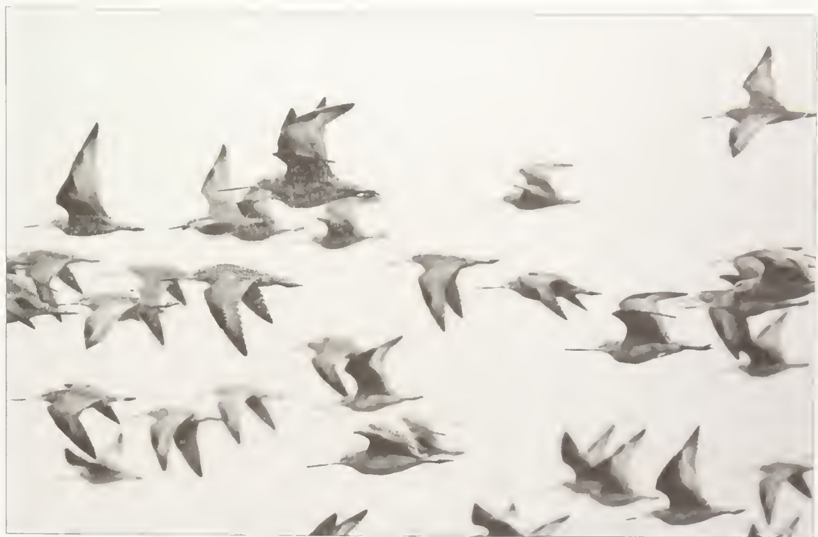
Marbled Godwits leaving their high-tide roost.

From September 2007 through August 2008, Golden Gate Audubon volunteers surveyed the North Richmond Shoreline between Point San Pablo and Point Pinole and observed tens of thousands of shorebirds, waterbirds, raptors, and passerines.