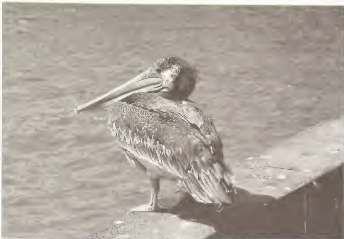
Juvenile Brown Pelican.

Course material includes a generously illustrated 1,300-page textbook, an audio CD of bird sounds, and online exams. After