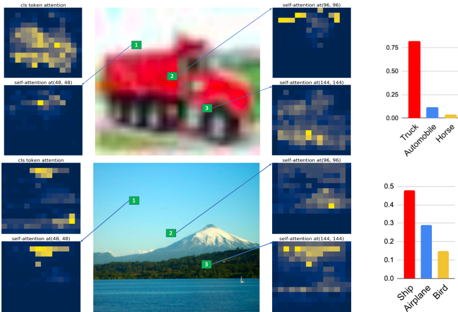
Figure 2: Representative example of an ID sample of Truck (above), and an OOD sample of Mountain (below). Among the four attention maps of each image, top left represents the class token, the remaining correspond to the image position marked with green square block. The right bar plot shows the top 3 similar class embedding.

and consistently outperforms ResNet and achieves an improvement as high as 19.6%. Our default AUROC score using embedding similarity also outperforms our baseline by a large margin. This result proves the objectness properties and exploitation of its related attributes through global attention play the most crucial role for outlier detection. It bolsters our hypothesis that, for outlier detection, a transformer can serve as the de-facto feature extractor without any bells and whistles.