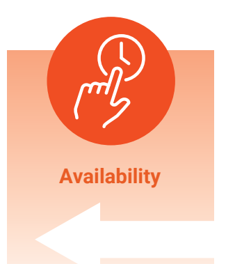
FIGURE 3. The four dimensions of inclusion in education in conflict and crises settings