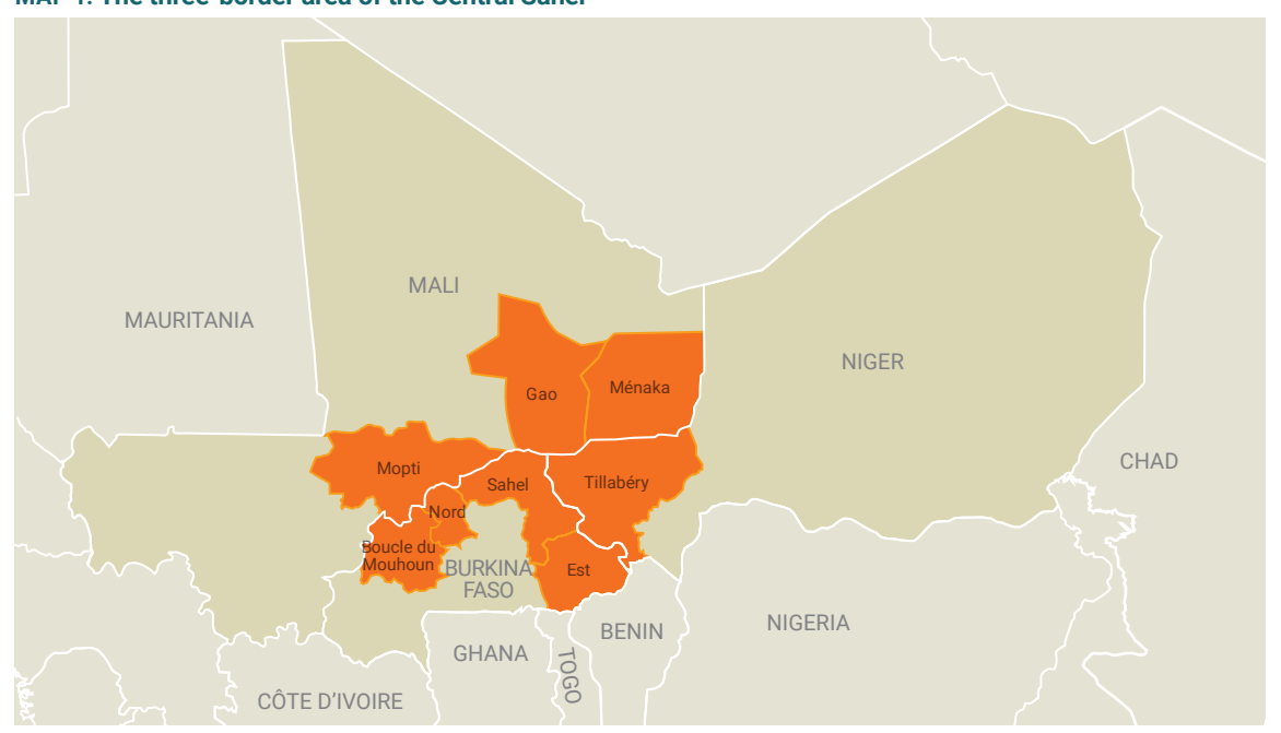
MAP 1. The three-border area of the Central Sahel

In the face of growing needs, the national response and international support to the crisis of education in conflict settings in the Sahel remain inadequate. Additionally, there is limited evidence on what works to deliver learning in areas where schools have been closed as a result of insecurity and in areas that are insecure in the Sahel or why existing frameworks or programs do not translate into actual change, suggesting the need for country-specific analysis to tease out subnational dynamics.