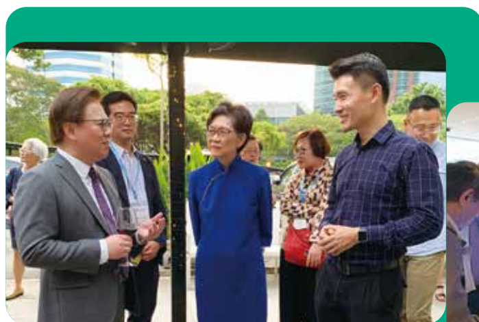
新加坡考察團 Cultural visit to Singapore