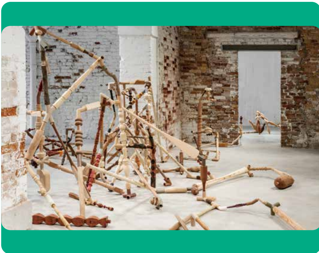
謝淑妮《Negotiated Differences》 Negotiated Differences by Shirley Tse