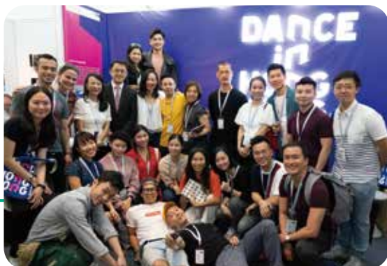
參與德國杜塞爾多夫國際舞蹈博覽會 2018 Participation in internationale tanzmesse nrw 2018