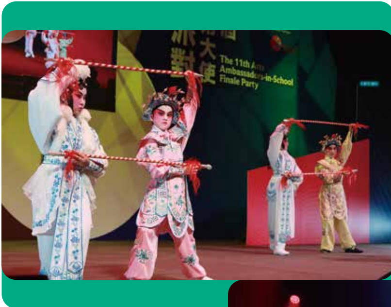
第 11 屆校園藝術大使大派對 The 11 th Arts Ambassadors-in-School Finale Party