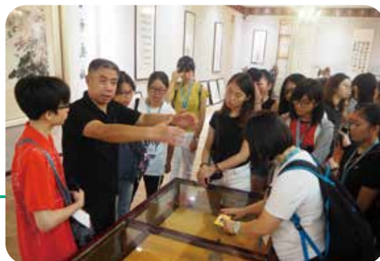
校園藝術大使計劃「豫見河南 —— 藝遊文化古都之旅」 Arts Ambassadors-in-School Scheme — Cultural Exchange Tour to Henan