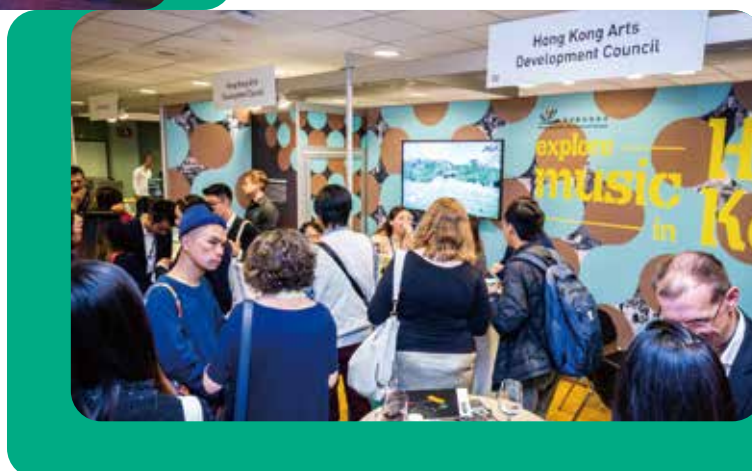
Classical:NEXT 2019 音樂博覽會 Classical:NEXT 2019 Music Expo