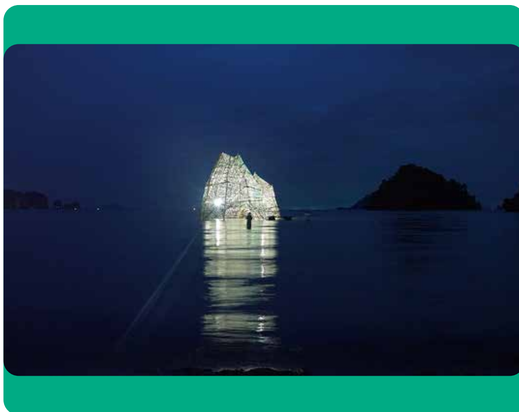
Map Office 《Ghost Island》 Ghost Island by Map Office