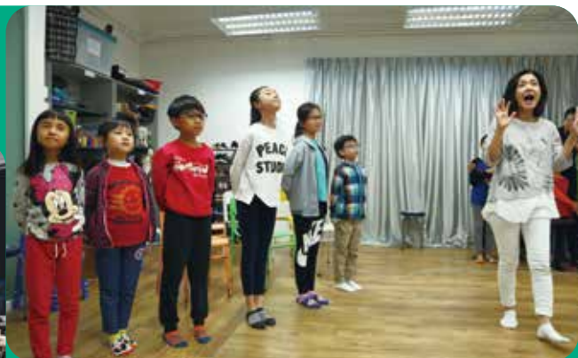
iStage 充分利用工作室進行排練 iStage fully utilises the space for rehearsal