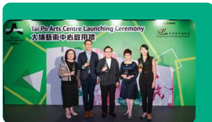
大埔藝術中心啟用禮 Tai Po Arts Centre Launching Ceremony