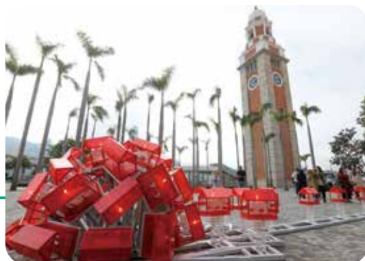
第二屆「賽馬會藝壇新勢力」——《家?》 The 2 nd "JOCKEY CLUB New Arts Power" — Home?

推出「Classical:NEXT 2019 音樂博覽會津貼計劃」、「Mori Art Museum 實習計劃 2019」、「Clore 領袖培訓計劃——香港獎學金 2019/20」及第三屆「藝術製作人員實習計劃」