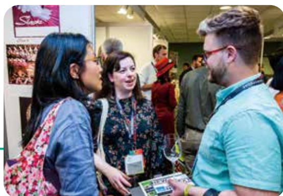
參與「Classical:NEXT 2019 音樂博覽會」 Participation in “Classical:NEXT 2019 Music Expo”