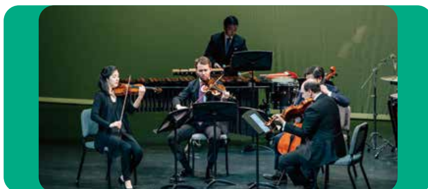
敲擊襄的國際共襄創意學院 Toolbox International Creative Academy of the Toolbox Percussion

(獲資助藝團名單詳見第 103-108 頁) (See pages 103-108 for the full list of recipients)