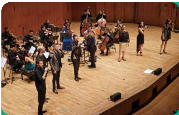
香港城市室樂團《CCOHK Vocal Series》 CCOHK Vocal Series by City Chamber Orchestra of Hong Kong