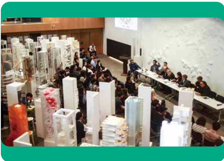
第 16 屆威尼斯國際建築雙年展「垂直肌理：密度的地景」—— 香港回應展