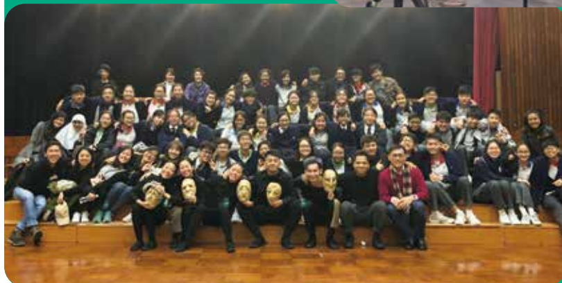
學校與藝團伙伴計劃首階段（先導計劃） Arts-in-School Partnership Scheme (Pilot Stage)