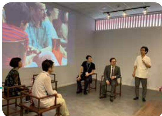
大會委員新加坡考察團 Council Members' Cultural Visit to Singapore