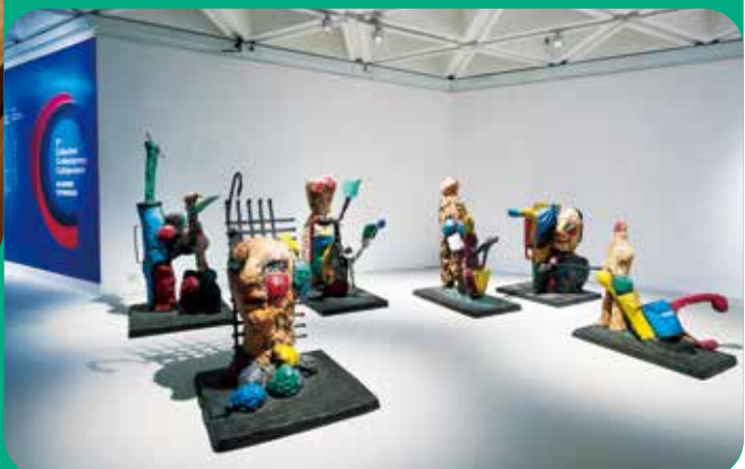
香港藝術中心「第五屆收藏家當代藝術藏品展」 “The 5 th Collectors’ Contemporary Collaboration” by the Hong Kong Arts Centre