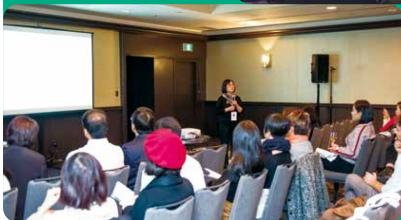
CINARS 國際演出交易會 CINARS Biennale