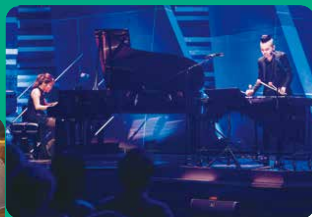
2018 香港藝術發展獎 Hong Kong Arts Development Awards 2018