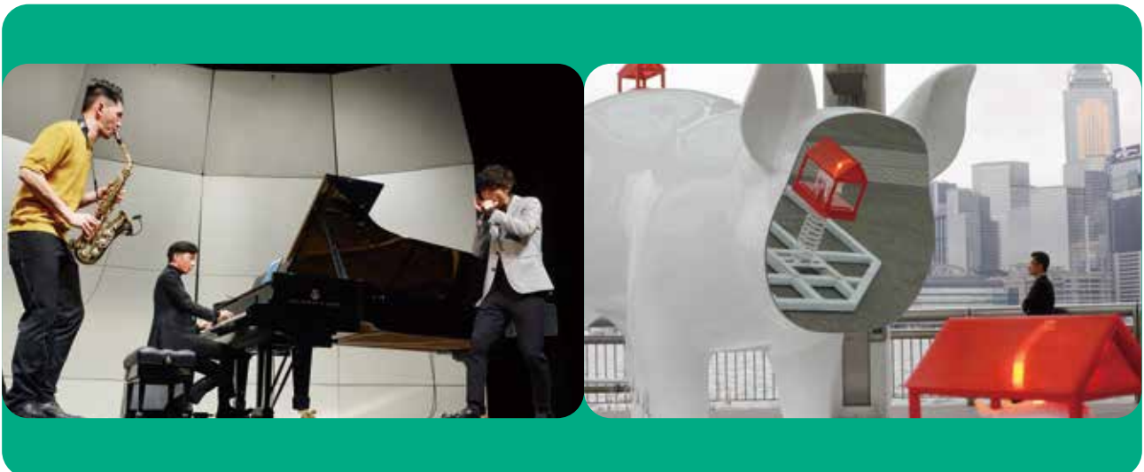
Music Lab 《指魔俠 × 琴戀克拉拉 × SMASH》(重演) Fingerman x Beloved Clara x SMASH (Re-run) by Music Lab