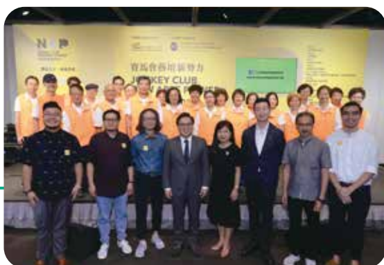
第二屆「賽馬會藝壇新勢力」新聞發布會 The 2 nd “JOCKEY CLUB New Arts Power” Press Conference