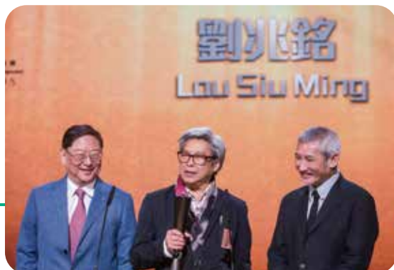
「2018 香港藝術發展獎」頒獎禮 “Hong Kong Arts Development Awards 2018” Presentation Ceremony