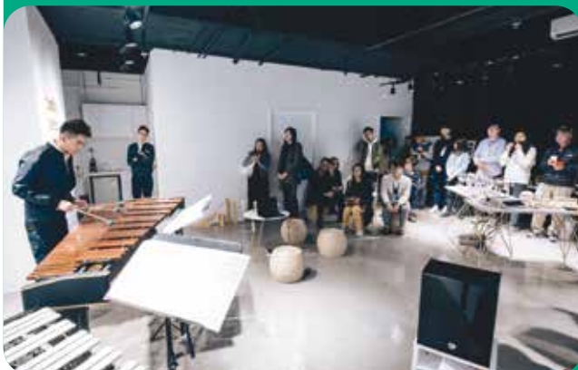
ADC 藝術空間（柏秀中心）：敲擊襄 ADC Artspace (Po Shau Centre) - Toolbox Percussion