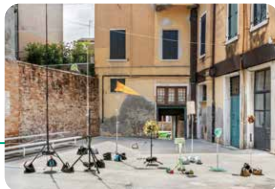
第 58 屆威尼斯視藝雙年展外圍展 —— 「謝淑妮：與事者，香港在威尼斯」 The 58 th International Art Exhibition — La Biennale di Venezia — Shirley Tse: Stakeholders, Hong Kong in Venice