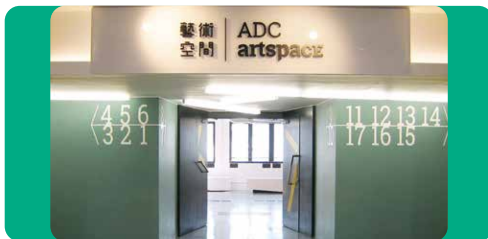
ADC 藝術空間（創協坊） ADC Artspace (Genesis)