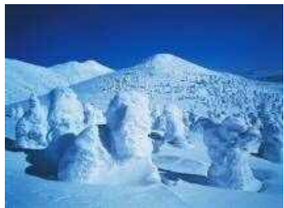
Silver Frost on Hakkoda Mountain