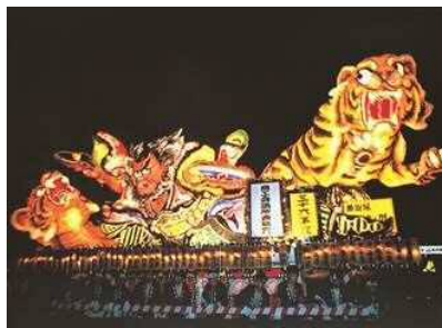
Aomori Nebuta Festival (Summer)