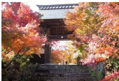
Teramachi with Autumn Leaves