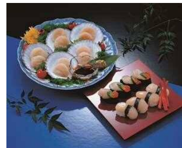
Safe and Tasty Scallop