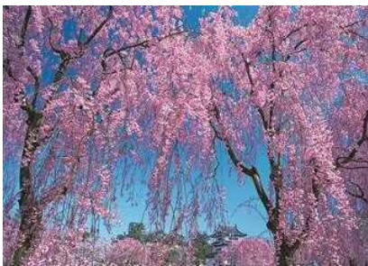
Cherry in Hirosaki Castle Park (Spring)