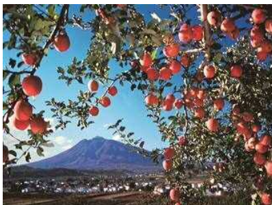
Japan Champion of Apple Production