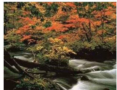
Oirase Mountain Stream (Autumn)