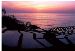
Shiroyone Rice Terraces