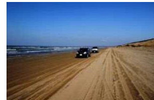
Chirihama Nagisa Driveway