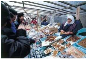
Wajima Morning Market