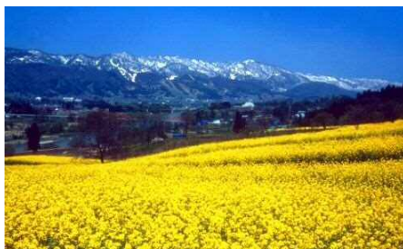
Nanohana Park and Chikuma River