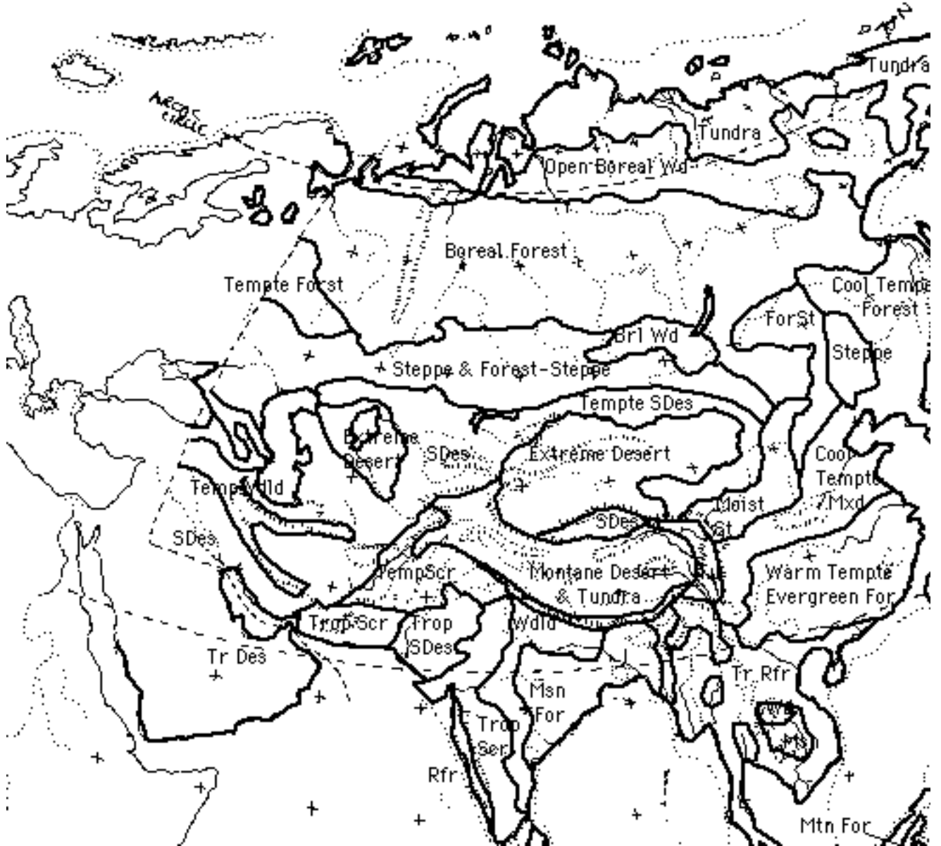
Present-Potential (i.e. in absence of agriculture) 4,000-0 y.a.