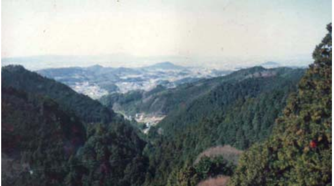
Mt. Kaguyama, from the SE of the Yamato plain. In the upper center, the Unebi mountain near Kashihara, with Emperor Jimmu's grave; to the right of it, Mt. Kaguyama.

She hides in the Iwa[ya]to cave ("stone [house] door") as she had been insulted in many ways (see below, A 9 sqq) by her unruly younger brother Susa.no Wo, originally the god of the ocean, after he had climbed up to heaven. 27 Amaterasu enters the cave and slams its rock gate shut behind her. The world is thrown into darkness, and the gods assemble in the bed of the heavenly river Ama.no Yasu-Kawa to deliberate what to do (B 3). They decide to use a trick. They prepare a ritual and festival in front of the cave, complete with music and dancing. One goddess, Uzume, dances an erotic dance, lowering her garments and exposing her genitals (C 3, D 2). This makes the other gods shake with laughter.