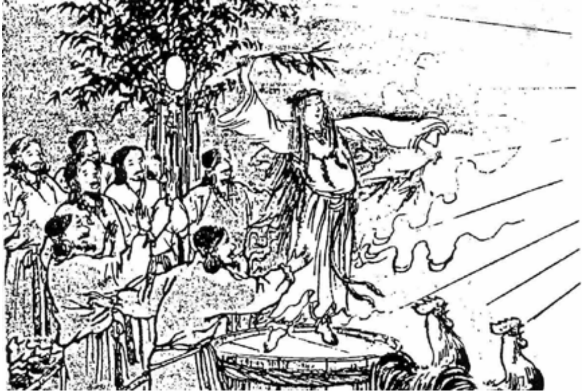
Uzume dancing in front of the Iwato cave. From: Rotermund 1988: 203 [ Shōgaku kokugo tokuhon 5, Monbushō 1935, Kokuritsu kyōiku kenkyū-jo ]

Amaterasu is plagued by curiosity, opens the gate a crack and peers out. She is shown a mirror, Snow White-like, 28 and sees a "more eminent" deity than herself. This competition makes her come out of the cave (D 4). The god Ta-jikara ("arm-strong"), hiding next to the door, immediately seizes her and another god, Futo-tama , puts a string ( shimenawa ) 29 behind Amaterasu so that she cannot go back into the cave (D 6). The world is saved from eternal darkness.