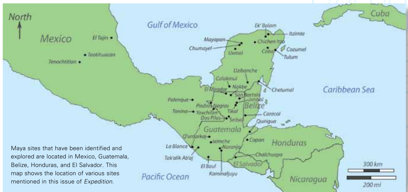
Maya sites that have been identified and explored are located in Mexico, Guatemala, Belize, Honduras, and El Salvador. This map shows the location of various sites mentioned in this issue of Expedition .

To understand and follow this long development, Maya civilization is divided into three periods: the Preclassic, the Classic, and the Postclassic. The Preclassic includes the origins and apogee of the first Maya kingdoms from about 1000 BCE to 250 CE. The Early Preclassic ( ca. 2000–1000 BCE) pre-dates the rise of the first kingdoms, so the span that began by ca. 1000 BCE corresponds to the Middle and Late Preclassic eras. The Classic period ( ca. 250–900 CE) defines the highest point of Maya civilization in architecture, art, writing, and population size. The Classic period has Early, Late, and Terminal subdivisions, the latter overlapping with the Postclassic, and corresponds to the collapse of most Classic