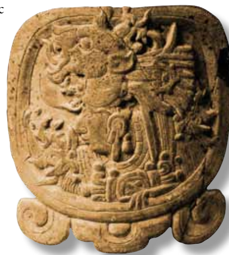
The Calakmul king Yuknoom Ch'een II ("Yuknoom the Great"), depicted here, defeated Tikal three times during his reign of 50 years (636–686 CE).

Our knowledge of Classic lowland Maya kingdoms has been vastly increased by deciphered royal texts that allow us to combine historical and archaeological information. Classic Maya kings were members of royal houses and dynasties of successive ancestral rulers. One of the greatest Classic period kingdoms was Tikal, which appears to have founded client kingdoms throughout the Early Classic lowlands. Tikal's power was eclipsed after its defeat in 562 CE