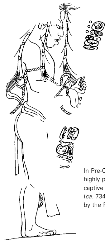
In Pre-Columbian times war captives were highly prized by the Maya. This portrait of a captive of Jasaw Chan K'awiil, king of Tikal (ca. 734 CE), was found in his tomb excavated by the Penn Museum's Tikal Project.

kingdoms and the beginning of the transformations that define the Postclassic period. The Postclassic saw a revival of Maya civilization beginning by ca. 900 CE and was cut short by the Spanish Conquest (1524–1697 CE). Over this span, uncounted generations of Maya people lived in villages, towns, and cities from the southern coastal plain and mountainous highlands of Chiapas and Guatemala, to the tropical lowlands of northern Guatemala, Belize, and Yucatan. The Maya created a sophisticated agricultural system, supplemented by forest, river, and seashore resources, to support a population that reached into the tens of millions. Archaeology has revealed this agricultural infrastructure, well adapted to varied highland and lowland environments. Excavated canals show that irrigation was employed in the highland Valley of Guatemala by the Middle Preclassic and expanded during the Late Preclassic. The lowlands hold extensive remnants of raised fields and drainage canals that made swampy land productive, and expanses of terraces that did the same for hilly terrain. Research has identified the agricultural bounty from crops like maize, beans, squashes, manioc, chili peppers, and cacao, along with domesticated turkeys, and cotton for skillfully woven clothing and textiles.