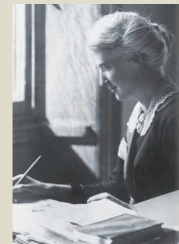
Eglantyne Jebb, founder of Save the Children

Save the Children is an international NGO that works to make children's rights to survival, development, protection and participation a reality worldwide. It was established in the UK in 1919 and is currently at work in approximately 120 countries. The UN and the governments of many countries have a high regard for Save the Children as a pioneer of children's rights, and we have achieved breakthroughs in the way the world treats children. Save the Children Japan was established in 1986. We are active in international programs in fields such as health and nutrition and education. When conflicts or natural disasters occur, we provide emergency and humanitarian responses. In Japan, we have actively addressed issues of child poverty and have also conducted various programs in response to large-scale disasters, through these programs, we work to make children's rights a reality.