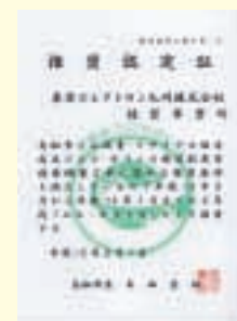
Eco Office certificates