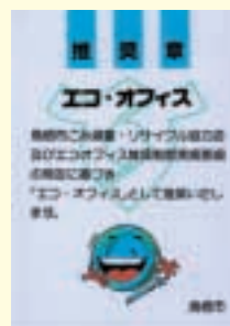
Eco Office commendation

In February 1998, the Saga plant was awarded a certificate by Tosu City in recognition of the plant's previous efforts to address environmental issues. The plant has been and will be inspected and recertified at two-year intervals.