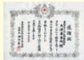
Certificate of appreciation from the Japanese Red Cross Society