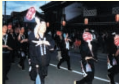
Scene from the Esashi Folk Music Festival