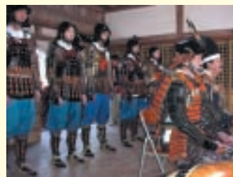
Scene from the Shingenko Festival