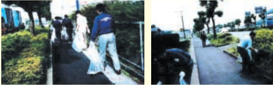
Employees involved in beautification activities

During June (Environment Month) and October (Hygiene Month), plant employees clean up the plant grounds and its environs, led by members of the Safety and Hygiene Committee and Safety Promotion Committee.