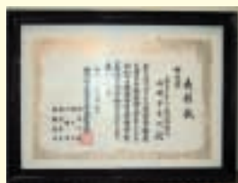
Commendation for promotion of recycling activities