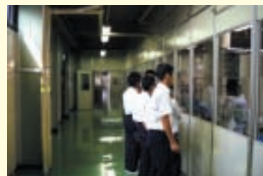
Work study program for local junior high school students