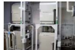
Newly-installed Air-cooled Vacuum Pump

To reduce water usage, the Saga plant has converted from a water-cooled vacuum pump used in manufacturing to an air-cooled type. This is because calculations and a study by the Resource Conservation Committee showed that the conventional pump was consuming a large amount of municipal water. By converting, the plant was able to reduce water usage by about 18,000m 3 per year, which was also quite good in terms of cost-benefit analysis.