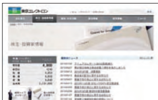
TEL webpage for investor relations

To ensure that foreign investors have fair and equal access to the information, the Company strives to disclose all information simultaneously in Japanese and English. However, due to the time required for translation, there may be cases where the posting of English information to the website is delayed slightly.