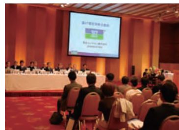
Annual shareholders' meeting

To encourage lively discussions at annual shareholders' meetings and to encourage them to exercise their voting rights, invitations are sent out early—more than three weeks prior to the meeting—and for the convenience of our shareholders, we work to avoid the date when most major Japanese companies hold their shareholders' meetings. Tokyo Electron participates in the web-based voting platform for institutional investors operated by Investor Communications Japan Inc. (ICJ). To supplement the above shareholder meeting related initiatives, Tokyo Electron's website carries notice of convocation, notice of resolution and materials of shareholders' meetings. An English version of the notice of convocation of Annual General Meeting of Shareholders is also provided.