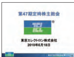
Materials prepared for an annual shareholders' meeting