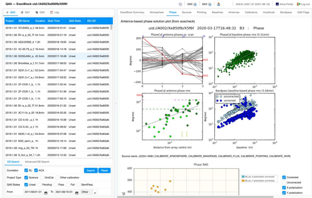
Figure 2. ALMA's AQUA, developed with ZK tools for observation data analysis